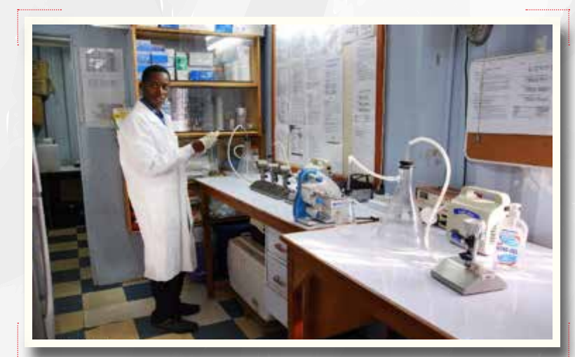
SWAP'S Water Lab

2009 - Research team started an Immunization Study (SWEPI) in Homa Bay and Suba. They also did a hand washing hygiene/water treatment study at clinics in Homa Bay. Life Straw study continued in Nyando.