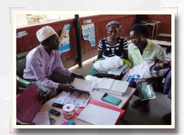
Antenatal Care Study - Saving Lives at Birth Award

2012 - The research team did two follow up studies on Water/Hygiene in Antenatal Care (SWANC) in Suba and Mbita, Hand washing and hygiene in schools (CHAK/UNICEF), two surveillance studies (Life Straw and Hand Towel) a Chlorox study. (Testing free chlorine in water in households).