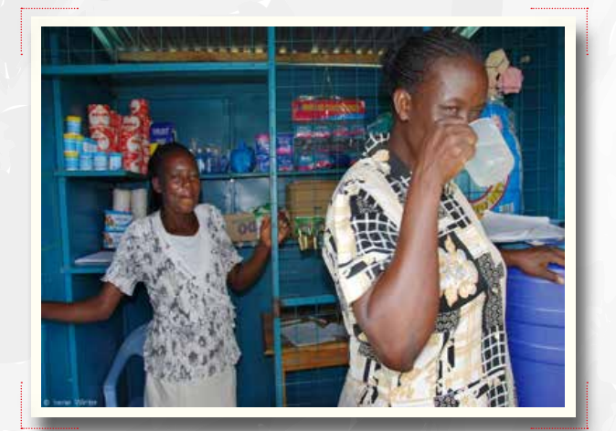
Community Health Promoters at Nyakwere Jamii Center