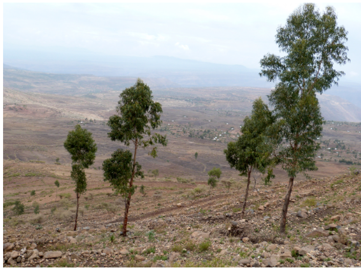
Figure 5. The landscape scattered only with Eucalyptus