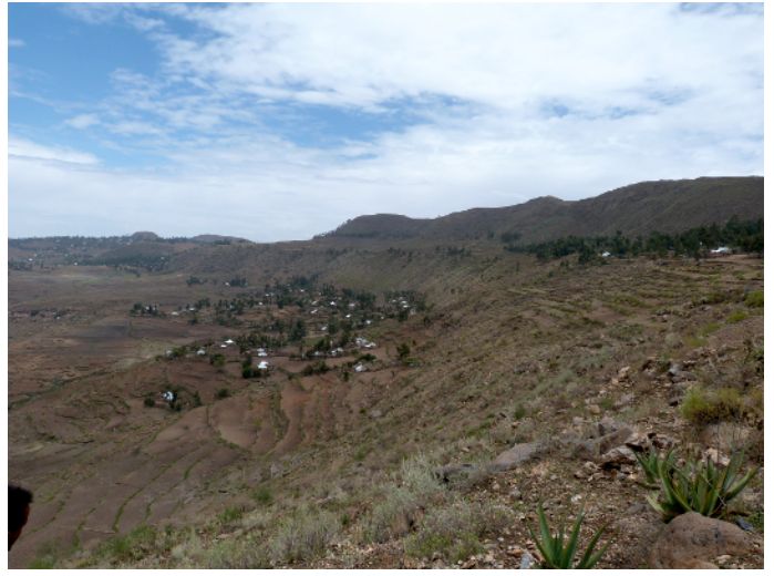
Figure 2. Degraded lands at Seret site

There are very few physical structures at the site to prevent erosion and landslides, and little vegetation cover, making this site extremely vulnerable to erosion. Indeed landslides occur frequently here, destroying houses and crops of communities downhill. Restoring the Seret exclosure is therefore not only beneficial for forests and biodiversity, but for communities' livelihood resilience as well. The scarce vegetation is predominantly Acacia abyssinica, Acacia etbaica, Dodonaea angustifolia and scattered Eucalyptus trees.