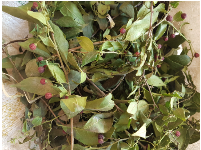
Figure 10. Branches of the valuable gešo plant

Ethiopia is by far Africa's largest producer of honey, which is highly ranked as one of world's most refined honeys. Honey is important in Ethiopian culture (e.g. when the Queen of Sheba went on her historic journey north to visit King Solomon she brought honey as part of the many gifts she took with her). It has traditionally been used in a variety of ways, as food, in the making of wine and as a medicinal aid. Honey is Tigray's only export item and the region produces a very distinctive white honey, made from a local blossom, labiate (Tshage family) (Figure 12). This white honey has a distinctive aroma, unique flavor and high market price. Due to the low rainfall and subsequent decline of the flowers that produce the white honey, bees are declining or feeding on other plants and producing yellow honey. Sometimes they are fed flour and sugar by farmers in attempt to prevent their decline. Combating climate change and restoring the remnant forest and forest corridors is vital for the survival of bee populations and, by extension, this important source of income for Tigray's communities.