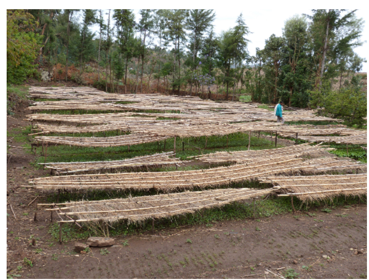
Figure 4. A nearby nursery represents what the project's nurseries will look like

The community members, districts officers and kebele (neighborhood) representatives convened to discuss the restoration of the Seret site. Among the topics discussed, community representatives listed the people's preferred species. They listed species which grow well in the area and are valuable income sources, including gešo ( Rahmnus prinoides ), the crop used to make local Ethiopian beer. These species will be among those planted. Currently 20 community members are participating in seed collection. Local seeds are being collected from the surrounding areas and bought on the market. Following this, a seedling production center will be established. The My'sehe nursery is being set up and will be run by 19 community members. 40,000 seedlings will be grown for the first planting season when the next rainy season begins in June to August 2017. See figure 7 for the project timeline.