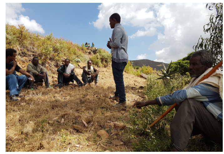
Figure 8. Preliminary meetings with community leaders

In October and November, meetings took place with community representatives and government officials. More than 100 people participated. Empowering local communities to take ownership of the restoration efforts, a community by-law was agreed that describes the ownership of the site, the rights and obligations of the community and more. Vulnerable members of the community, including women, youths and landless farmers, will be targeted for project engagement. 39 people have already been recruited as the nursery establishment gets underway and a further 534 will be enlisted to carry out the remaining project activities, including planting and tree aftercare. The soil and water conservation structures will be carried out by community members who have committed to providing free labor to support this aspect of the project. Different soil and water conservation and water harvesting structures are being planned such as stone bunds and microbasins. There is the potential to build a small reservoir on site as well.