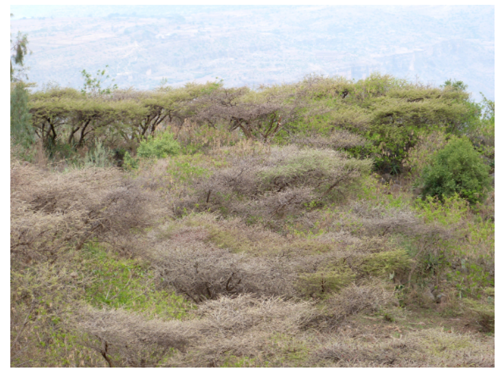
Figure 6. A nearby area restored for 5 years demonstrates the potential the project to restore forest cover