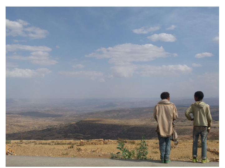
Figure 3. Community members overlook the degraded landscape