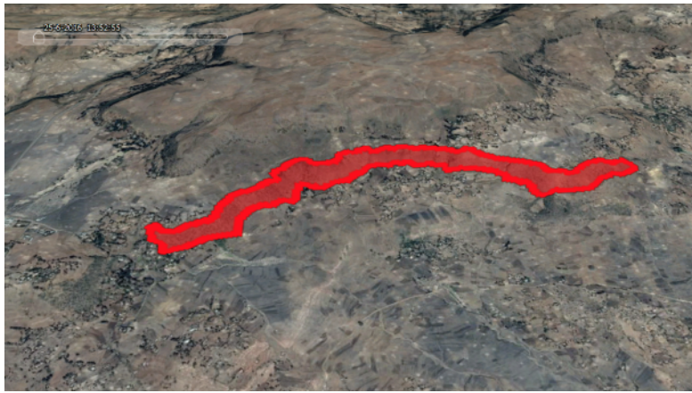
Figure 1. Polygon of Seret site

The project has identified its first intervention site, around the village of Seret. This site is located in the highlands of Central Tigray, on a steep slope about 2,800 meters above sea level. Most of the topsoil and parts of the subsoil have already been washed away by erosion. The site is highly degraded and only around 10% of forest cover is left.