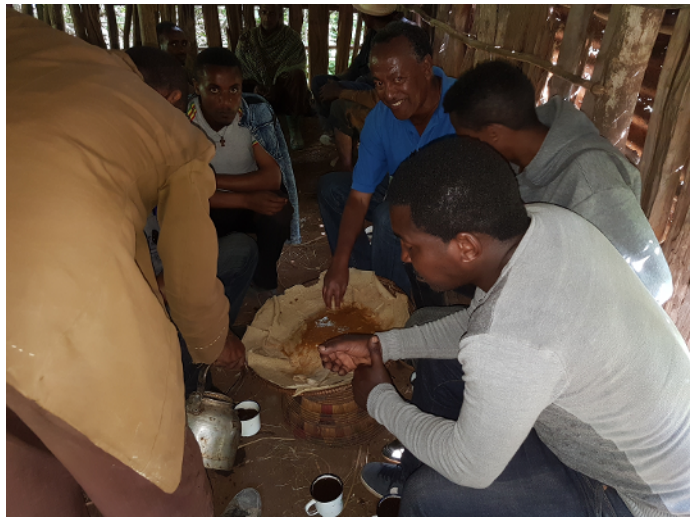
Figure 11. Drinking tella