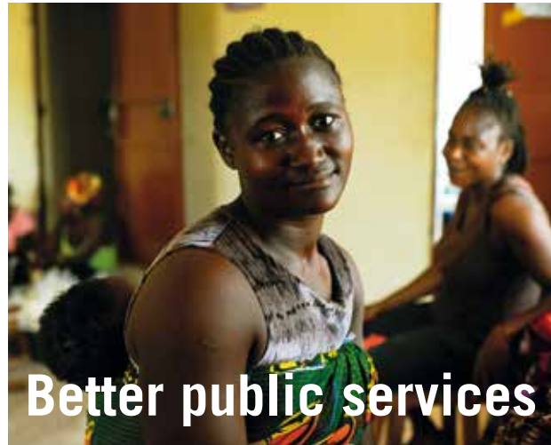
Better public services