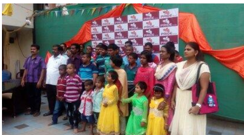
Republic Day Program.