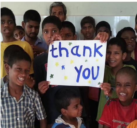
The children want to say a big “Thank You” to you.

Please feel free to let us know what you think of it, and how we may improve on our reporting.