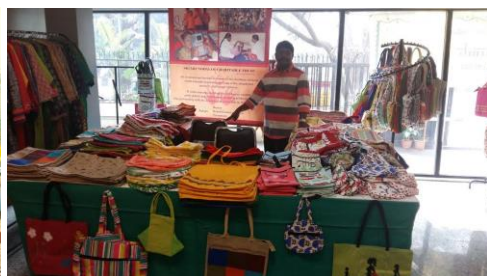
Participating at Pratibimp