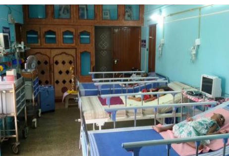
New Medical Unit