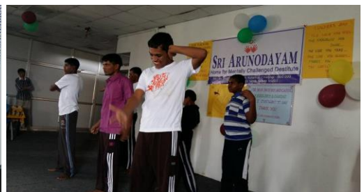
Teacher's Day Celebrations