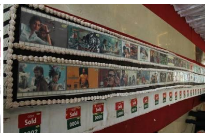
"Joy of Giving" Week Celebrations