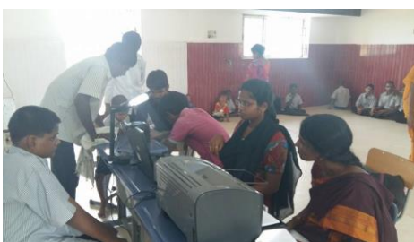
Aadhar Card Camp