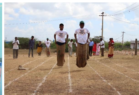
Founder's Day Celebrations