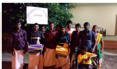
Dr. Abdul Kalam's Birthday Celebrations