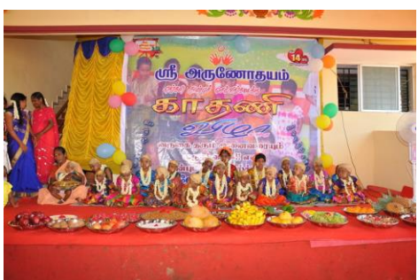
Ear Piercing Ceremony for the Girls