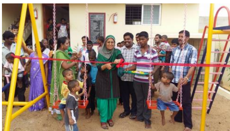
Children's Playground Inauguration