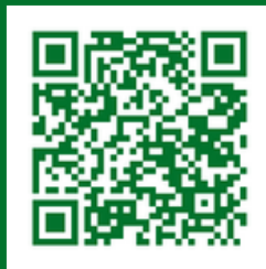
NASEEA Facebook Page