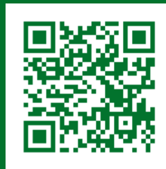
PRESENT Coalition Facebook Page