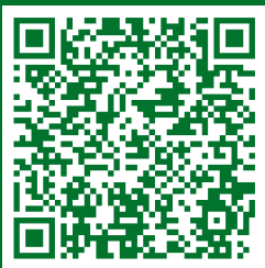
LSEED Center Primer

SCAN THE QR CODES to learn more about LSEED Center's program, projects, and activities.