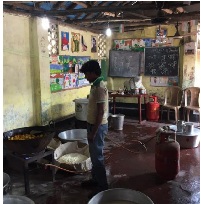
PREPARING FOR THE LANGAR IN THE TOPSIA COMMUNITY CENTRE