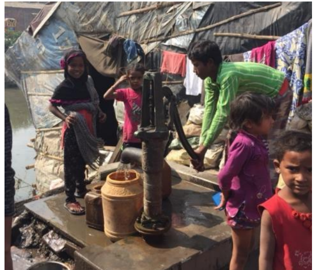
WELL WATER IS CONTAMINATED. NOT FOR DRINKING

Tiljala SHED 28A, Syed Amir Ali Avenue, 4th Floor Kolkata – 700017 West Bengal INDIA Tel. 9831413187; 9331020633 Email : contact@tished.org