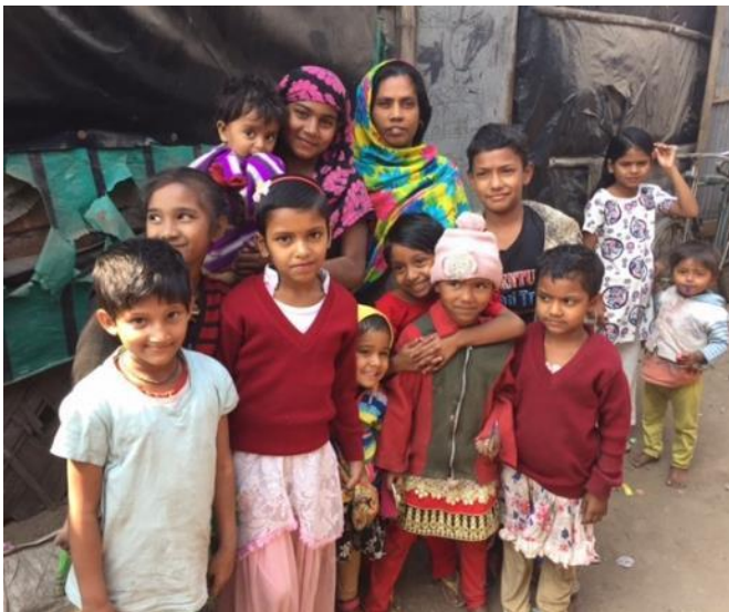
TOPSIA'S CHILDREN ARE VULNERABLE TO ABUSE, EARLY MARRIAGE, CHILD LABOUR, ILLITERACY, CRIME AND EXTREME POVERTY