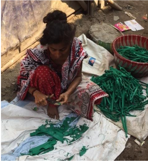
TRIMMING CHAPPALS EARNS AROUND Rs50 PER DAY

At this point Tiljala SHED considers that both the need and the infrastructure now exist in Topsia to justify the introduction of this new program to enhance the educational opportunities for the children most at risk of dropping out of education.