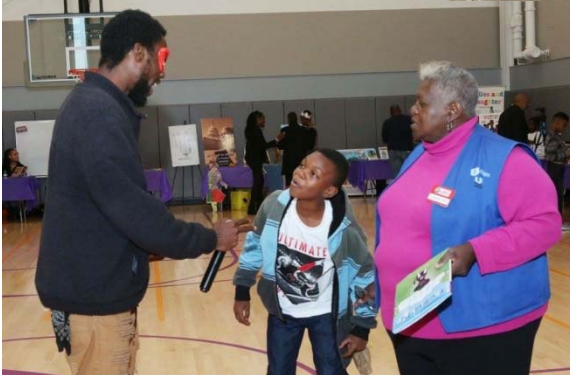
Foster Grandparent served at East of the River Book Festival - Saturday, October 22, 2016 at Rocketship Rise Academy. They assisted children with reading, meeting authors and crafts.