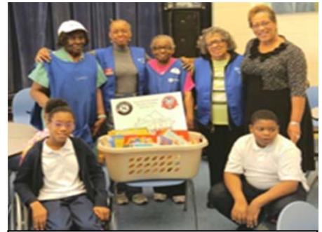
Foster Grandparents donate books Miner Elementary School collected from Foster Grandparent Programs nationally. March, 2016