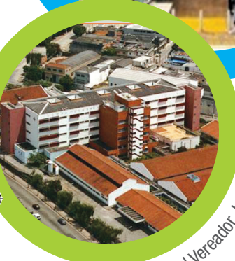
Hospital Municipal Vereador Jose Storopoli