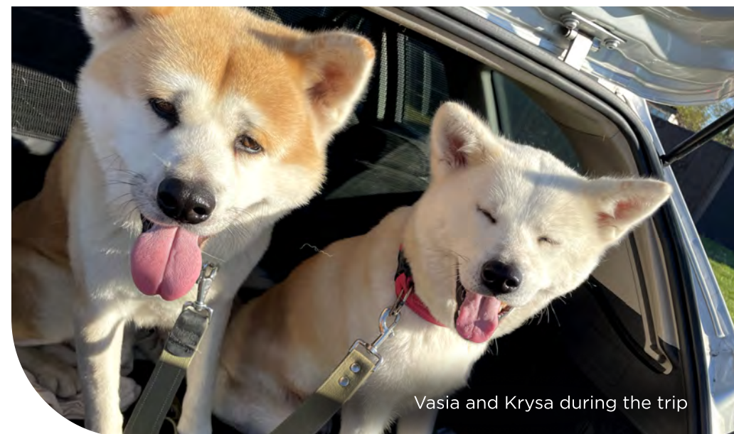
Vasia and Krysa during the trip