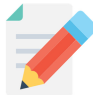
Writer's Corps High School & Above

One Love's national Campus Ambassador program creates a virtual and collaborative space for students to engage with others in their pursuit to build grassroots movements to end relationship abuse in their communities.