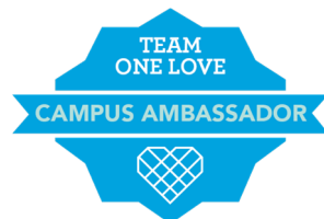
Campus Ambassadors High School & College

Creating a Team One Love Club is a great way to root students in One Love's mission and programs. The club setting provides a structure for students and community members to raise awareness and activate their community. Contact us to learn how to get your club started!