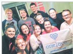
One Love Club All Ages

To create real community change we must combine education with action. Below are some additional ways communities nationwide engage with One Love to build a movement to end relationship abuse. For more information on volunteer opportunities, email volunteer@joinonelove.org