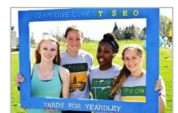
Yards for Yeardley All Ages

Do you have a (healthy) obsession with making sure your friends and family know about healthy relationships? Love giving tips and advice and writing about pop culture and thought pieces? Consider joining our Writer's Corps and help grow our digital content on joinonelove.org !