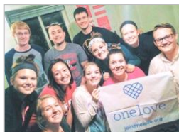
One Love Club All Ages

To create real community change we must combine education with action. Below are some additional ways communities nationwide engage with One Love to build a movement to end relationship abuse. For more information on volunteer opportunities, email volunteer@joinonelove.org