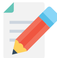
Writer's Corps High School & Above

One Love's national Campus Ambassador program creates a virtual and collaborative space for students to engage with others in their pursuit to build grassroots movements to end relationship abuse in their communities.