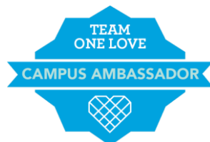
Campus Ambassadors High School & College

Creating a Team One Love Club is a great way to root students in One Love's mission and programs. The club setting provides a structure for students and community members to raise awareness and activate their community. Contact us to learn how to get your club started!