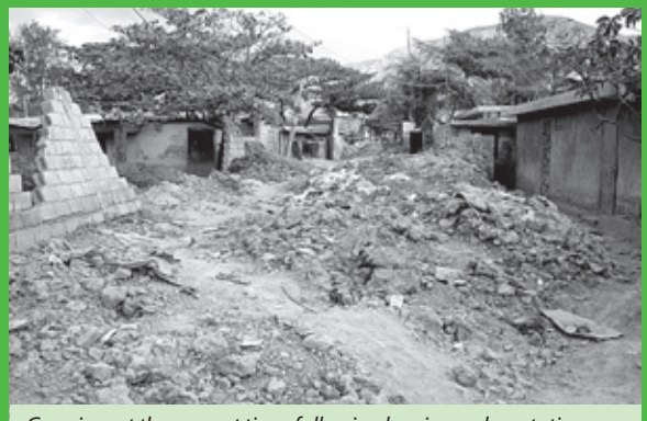
Gonaives at the present time, following hurricane devastation

• Thanks to the support of the Baptist Missionary Society 200 children in the badly hit hurricane area of Gonaives are still benefiting from the emergency education grant in 2008, offering them schooling for a year.