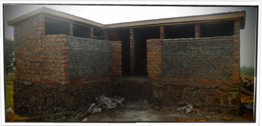
Our shower cubicles in progress - Notice the two panels at the front built from recycled plastic water bottles