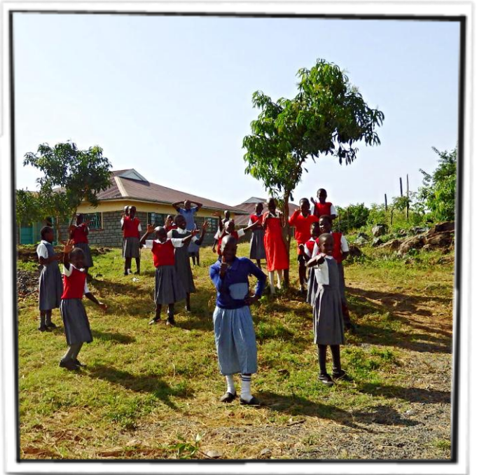
Our happy girls standing in front of their new classrooms

unique design element when building the showers to teach our girls about reusing and recycling.