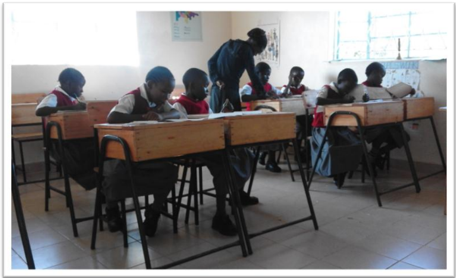
Akili Girls in class at the new campus

boarding house within our Obambo compound. The 20 girls in our 3rd and 4th grade classes have moved from Obunga to live there! The other 10 girls come from Obambo village and are day scholars. We want the surrounding community to feel supported by our school so will be enrolling 5 girls from the Obambo community in each grade level in the future.