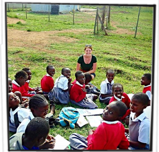
The Akili girls taking part in a Sustainability Club meeting