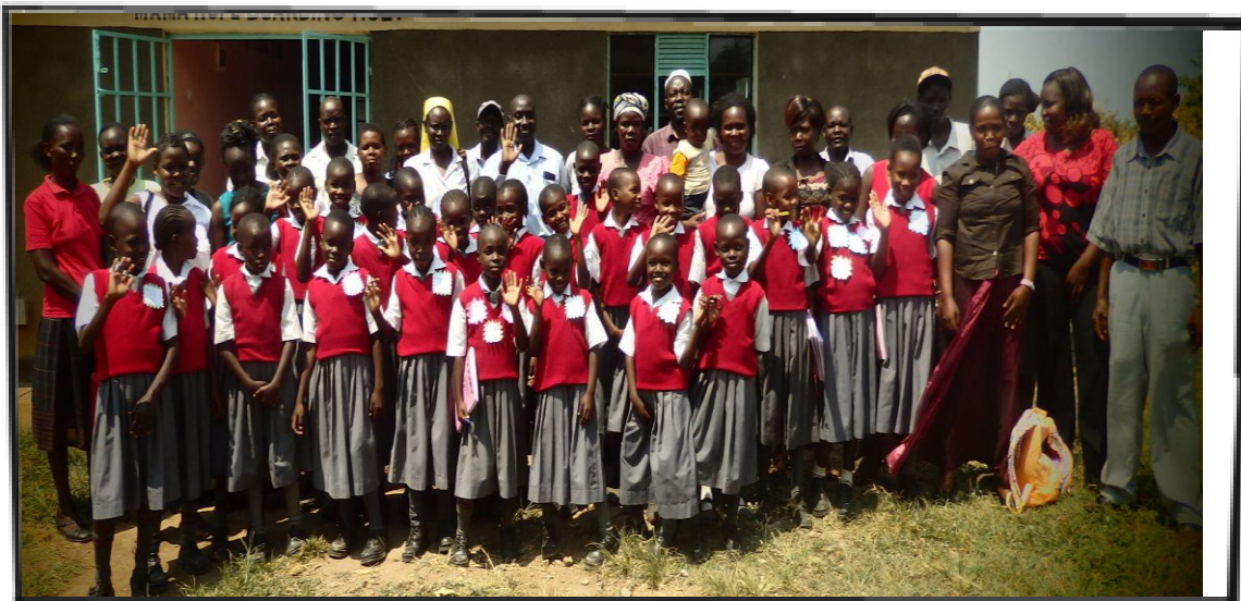
Our girls and their parents standing in front of the new boarding house at our end of term celebration

Just saw the end of term two and on the last day we held a celebration and presentation for all parents. There were songs, dances, poem recitals and rounds of applause for all students, especially our outstanding achievers. The chairman of our parents made a beautiful speech in which he commented on the positive changes he has seen in the girls who have moved from Obunga out to our Obambo campus. He spoke about their confidence, their increase in activity and how they are looking “fat” thanks to three healthy meals a day. This was such a compliment for us and helped us to see that even with all the bumps over the past years we have made so much progress and our girls are proof of that.