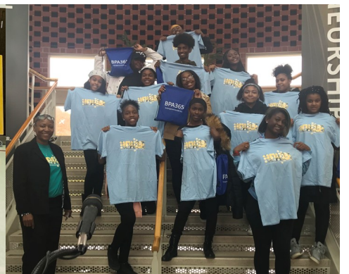
Workshop for Chicago Links Debs and Escorts March 10, 2019 and performance for Bullying Prevention and Awareness 365 conference October 2018.