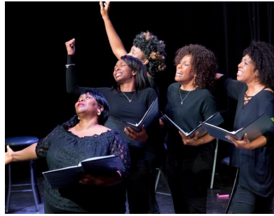
Our adult play, My Vagina. My Voice. Continues to draw large audiences and bookings. We performed for a national Sexual Health conference in July.