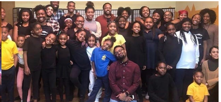
Our youth went to see "Hamilton" downtown. Members of the Hamilton Chicago cast came to the south side to see Global Girls in 2018.