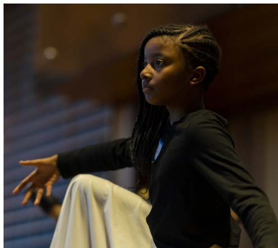
Destiny the student and Destiny the performer. The difference is being FIRED UP!.