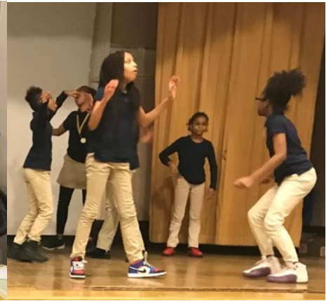
Global Girls programs with community partners - St. Jude Educational Institute and Fernwood Elementary School.