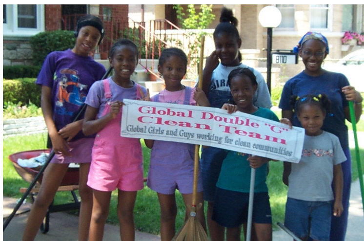
One of the very first Global Girls' groups back in 2001.

Performance is a huge and driving component of the Global Girls organi-