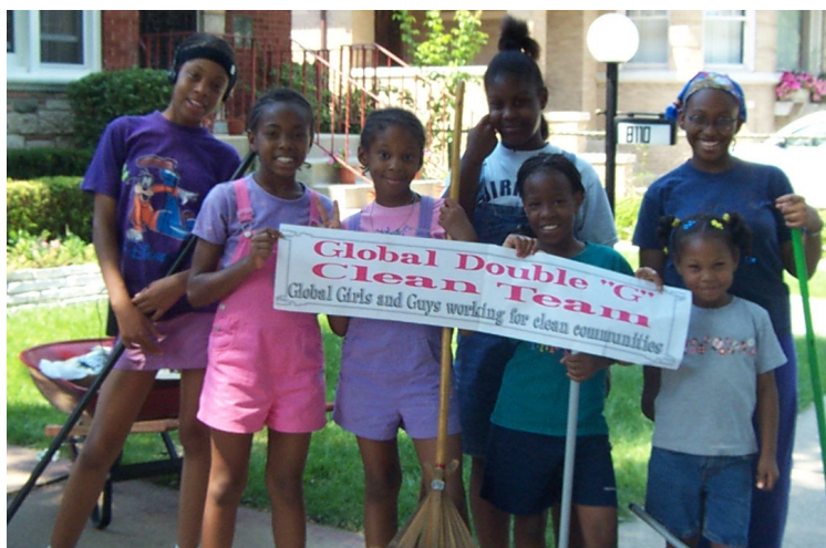
One of the very first Global Girls' groups back in 2001.

come EVERYONE!" one girl exclaimed, emphatically! Another expressed how she likes "...going to the After School Program....It gives me something much better to do after school, and when school is out, then I look forward to the summer program." Yet, another simply enjoys being a "...Global Girl because I love the Studio. It's fun and safe. What you say there stays there." The girls have a voice when they are in the Global Girl setting; they enjoy the rules of discussion, the "Safe Place", "Check-Ins", the "Session Guidelines" and overall, the "Global Girl way."