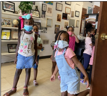
Lining up for the morning handwashing & bathroom break.