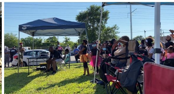
SHOWTIME at the Global Studio. Well... in the yard, under the hot, hot sun!