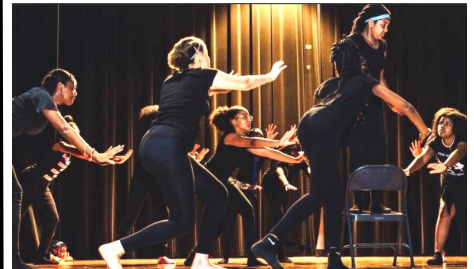
The YouTube show, "Global Chat" production team is hard at work planning each aspect of the every segment.