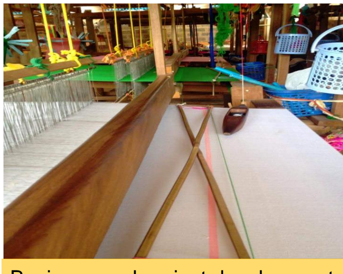
Business and project development

We provide scholarships to enable women to complete tertiary education. Each scholarship runs on the understanding that women will return to their region to take an active leadership role to be the change for the future.