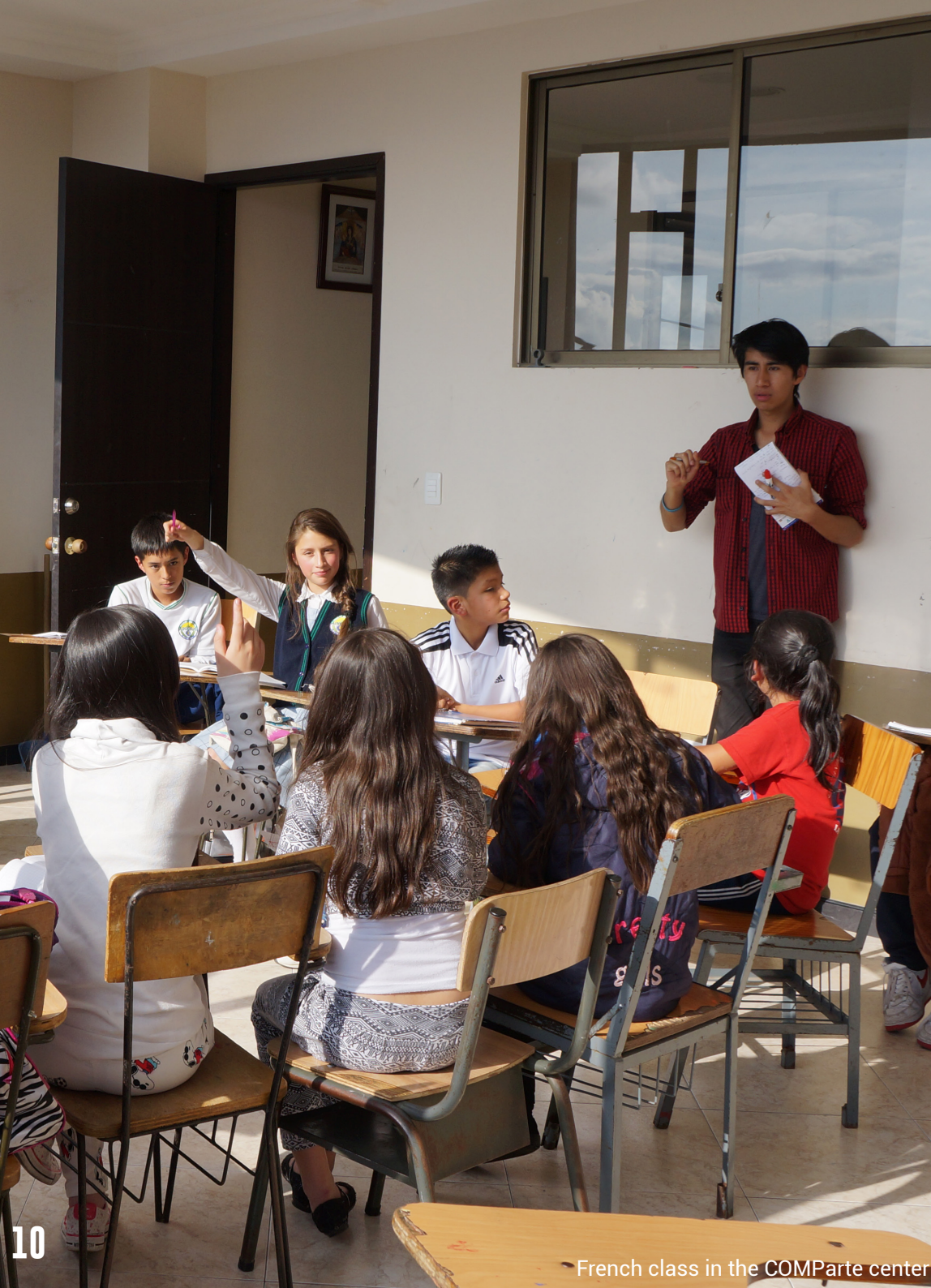
French class in the COMParte center