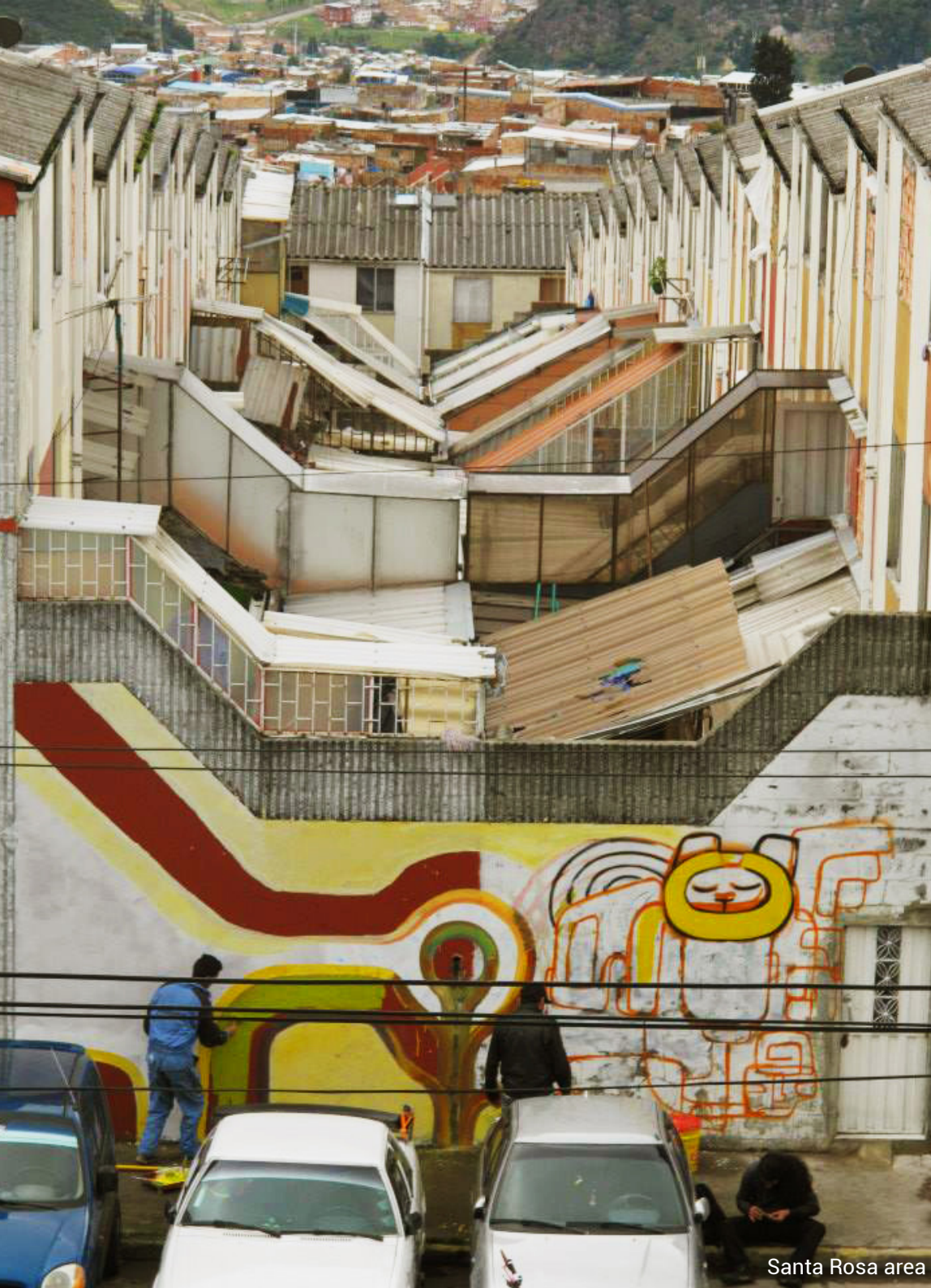
Santa Rosa area