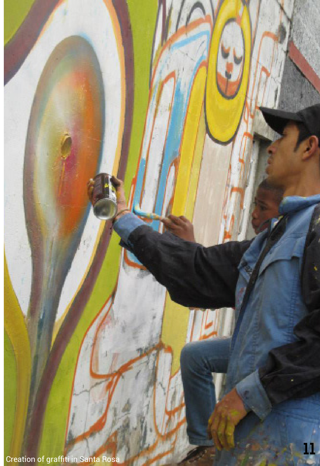
Creation of graffiti in Santa Rosa