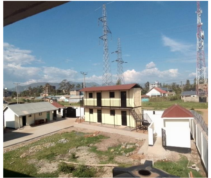
Centre's compound view 2