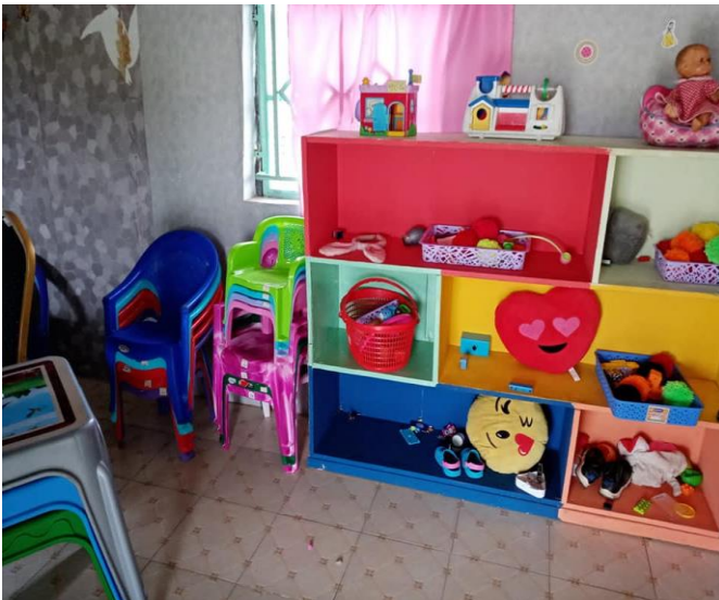
Day care centre