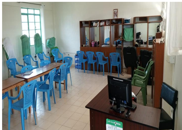
Hairdressing & beauty therapy class