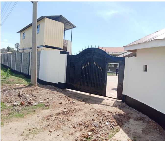
Centre's compound view 3