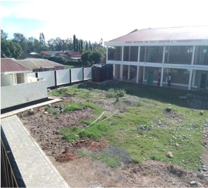
Centre's compound view 1