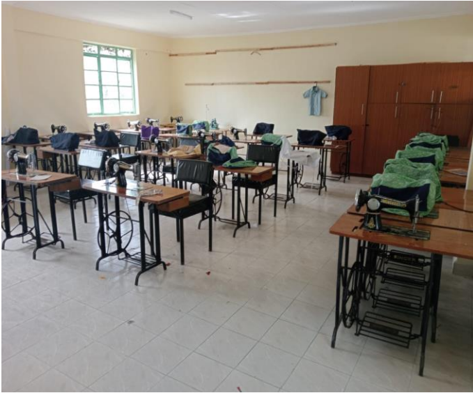
Fashion & design class