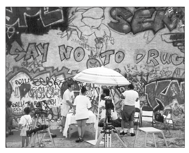
Figure 6: Community work in a neighborhood that used to be called the Badlands of north Philadelphia.

Toporek, R. Other videos on Rolfing SI for children at http://tinyurl.com/toporek-youtube.