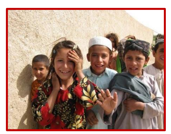
Thank you for all of your support! These past 17 years have been truly successful!

running water from a deep well, but still lacks electricity. The village has a second farm about four hours away by car, where we grow more temperate crops, such as grapes, pomegranates, and figs. The orphans tend to the gardens at the project after school hours.