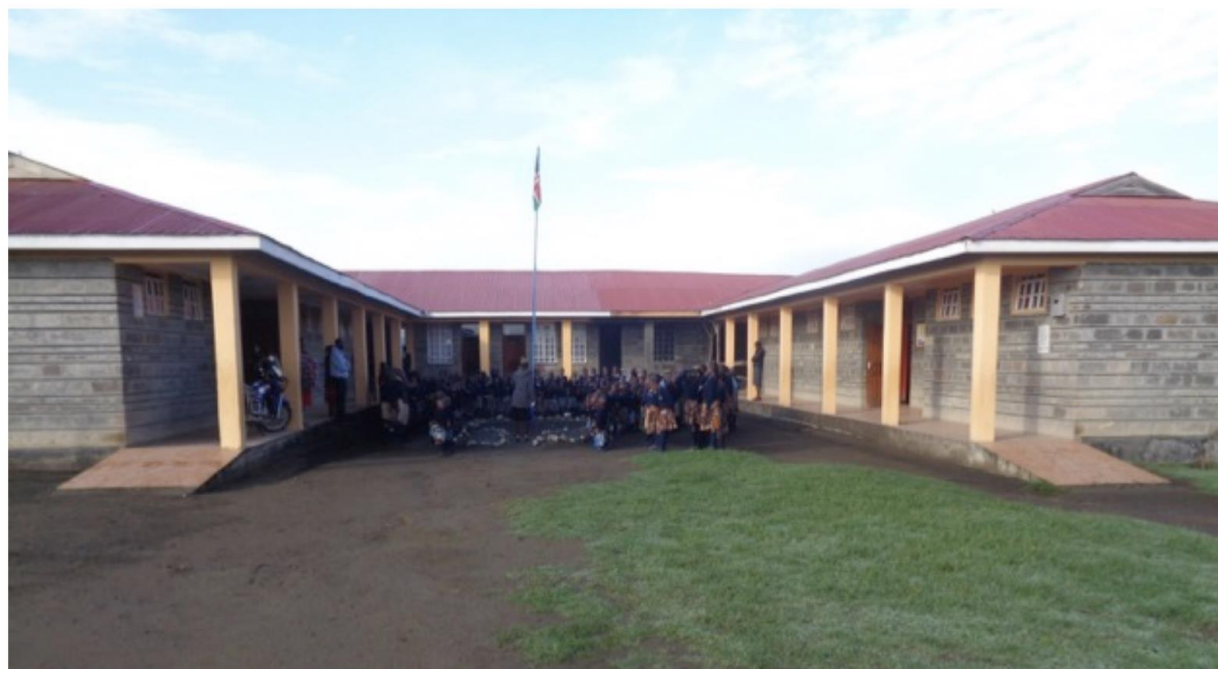
First 8 classrooms

Concept for The Live and Learn in Kenya Education Center in the Slums of Nakuru, Kenya Rift Valley Leben und Lernen in Kenia e.V. Live and Learn in Kenya Int'l