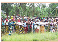
Women celebrating at the ground-breaking ceremony of our Commercially Integrated Farming Initiative (CIFI) project in Rwanda.

This led Women for Women International to start the Commercially Integrated Farming Initiative (CIFI) in Rwanda. This program goes beyond traditional means of fighting hunger by merely distributing food, and actually teaches the women in our programs the skills, techniques and sustainable practices of commercial integrated farming.