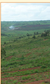
Land donated for the CIFI Rwanda project -- rolling green hills as far as the eye can see.