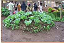
Organic farming techniques yield more crops that can get to market faster.

The crisis demands a sustainable solution that reaches beyond immediate aid and into the realm of true relief. A generous donation from you today of $20, $30 or even $50 will help us fund new initiatives that actually came directly from the women in our programs. Women in our programs told us they want to learn how to farm so they can feed and support their families as well as help to sustain their communities.