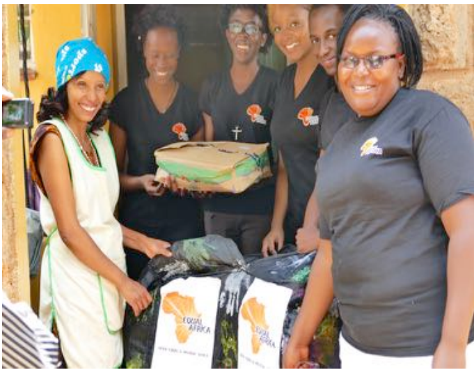
Manager Happy to Receive Donations