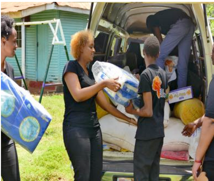
Equal Africa Team