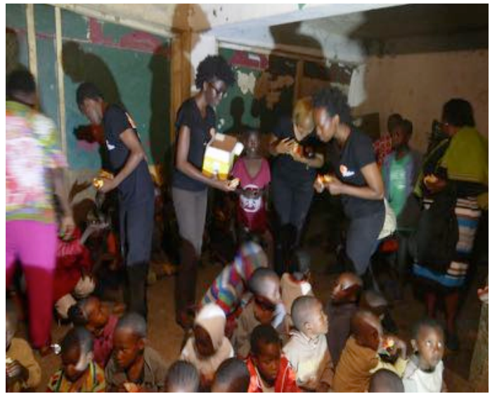
Volunteers Giving Biscuits to Kids