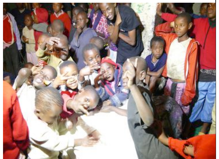
Happy Children Say Goodbye to Equal Africa Team