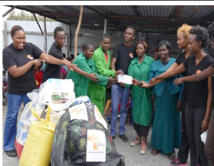
Cash Donation for the Carers