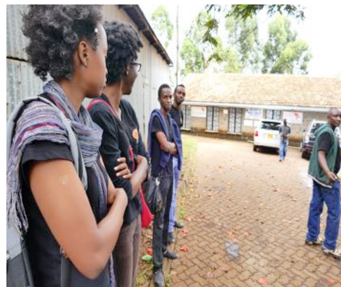
Volunteers Stand Outside Equal Africa Office