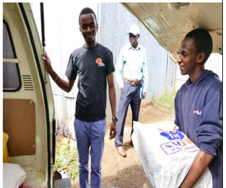
Loading Donations into the Vehicle