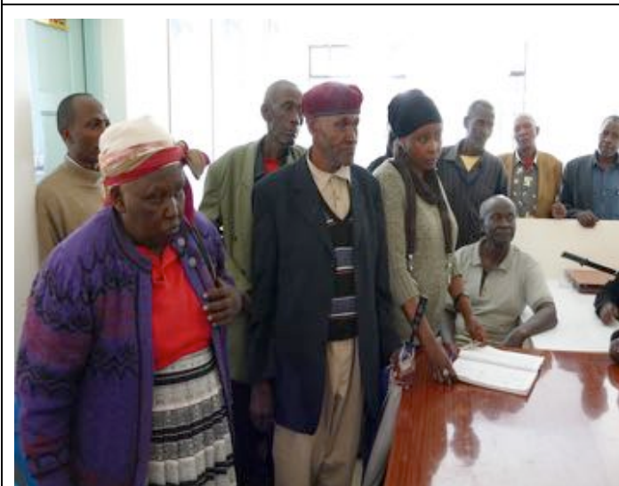
Elderly People who are Beneficiaries of Equal Africa