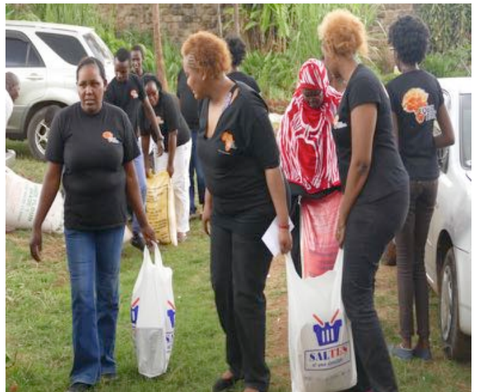
Equal Africa Team