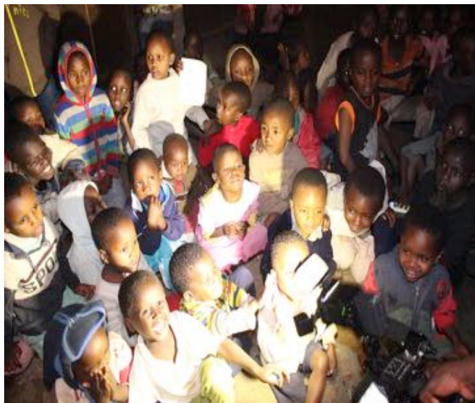
Orphaned Children at Good Samaritan