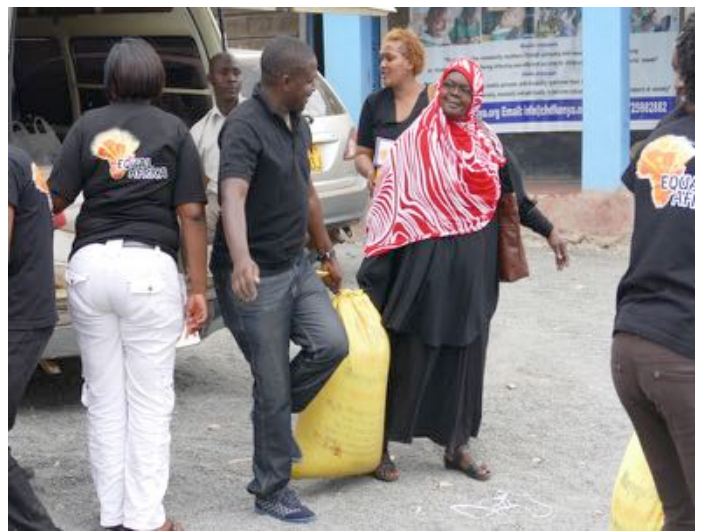
Equal Africa Team