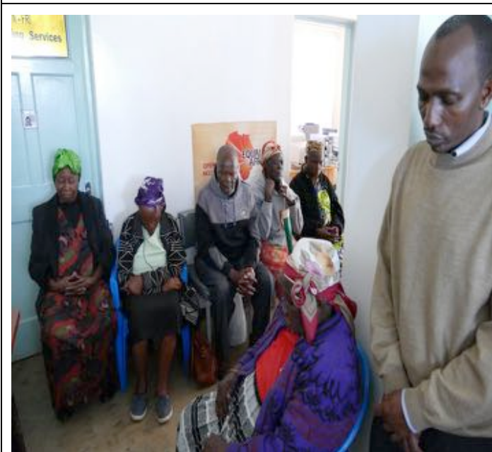
Elderly Beneficiaries of Equal Africa