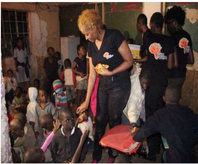
Volunteers Giving Biscuits to Kids