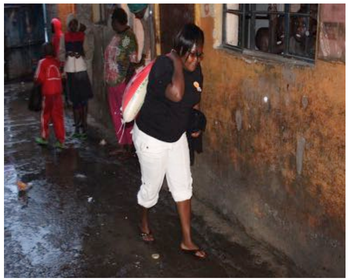
Offloading the Donations