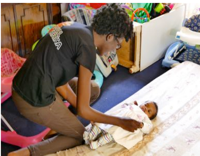
A Volunteer Interacting with a Baby