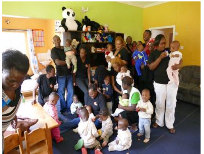
Equal Africa Team at Angel Centre