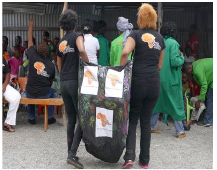
Equal Africa Team