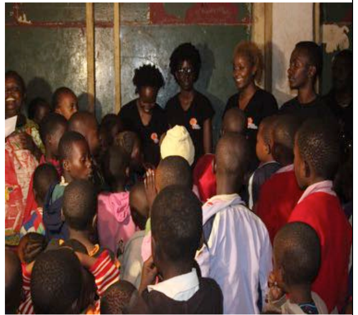
Good Samaritan Home