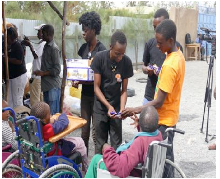
Volunteers Give Biscuits to Kids