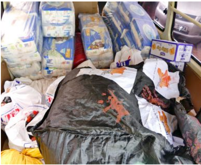
Food Donations for Angle Center Home