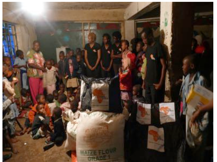
Happy to Receive Donations