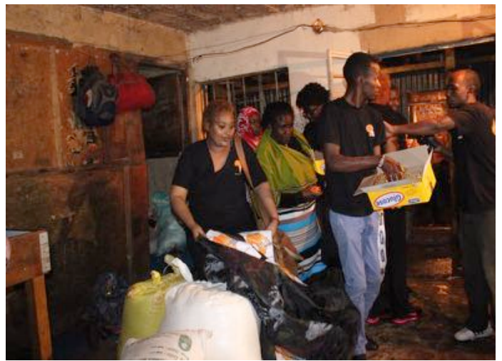
Equal Africa Team