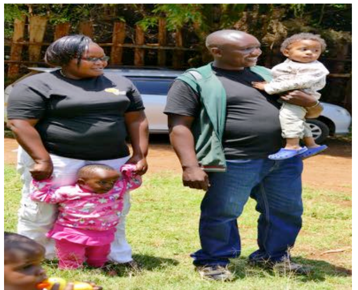
Equal Africa Team with Kids