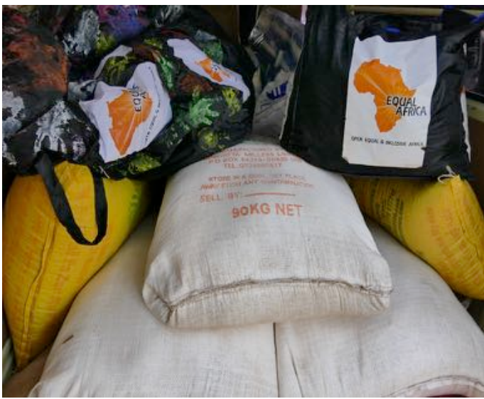
Donations for Good Samaritan Home