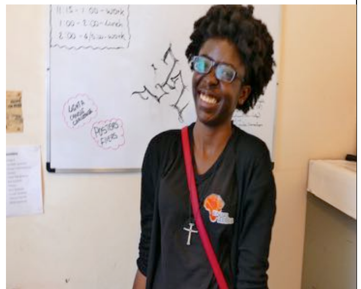
A Volunteer in Equal Africa Offices