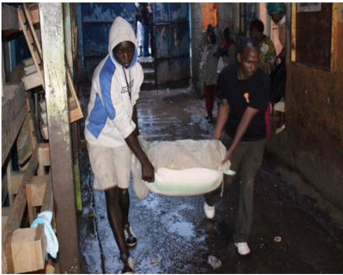
Offloading the Donations