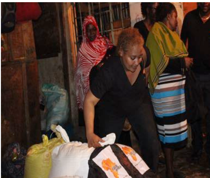
Equal Africa Team