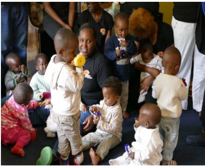
Interacting with the Babies