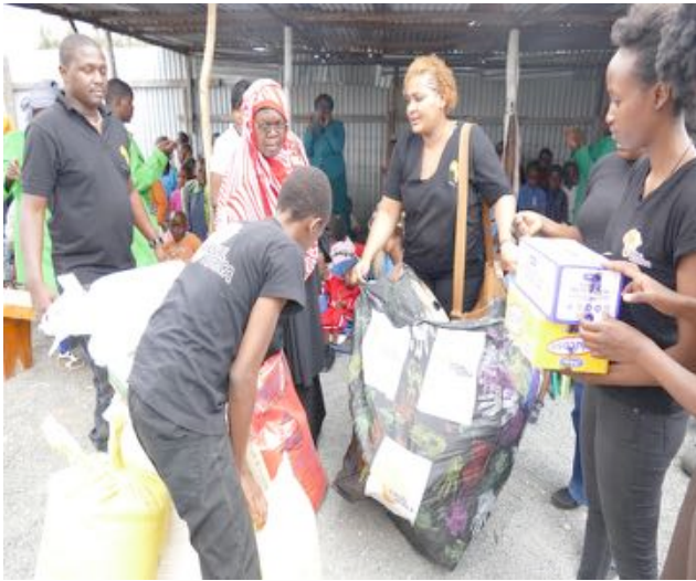
Equal Africa Team