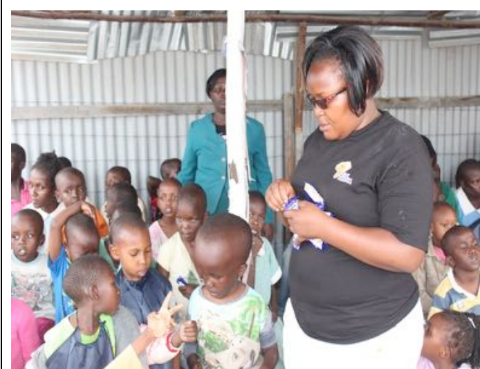
A Volunteer Giving Biscuits to Orphans