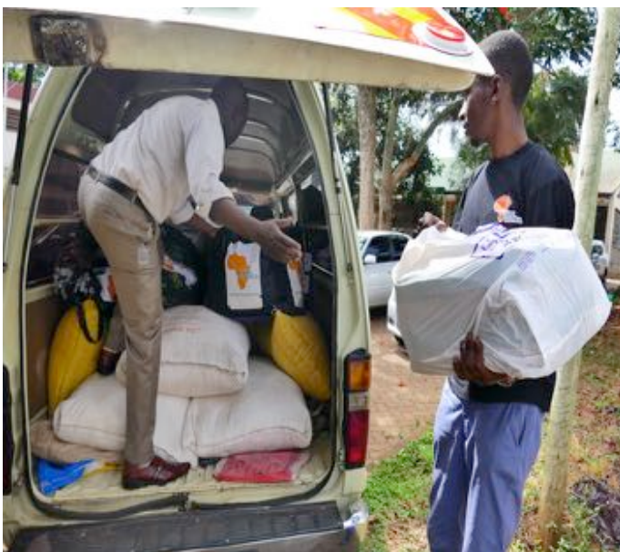
Loading Donations into the Vehicle