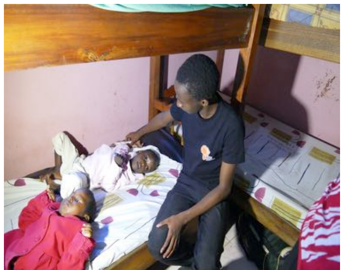
Equal Africa Volunteer at the Home