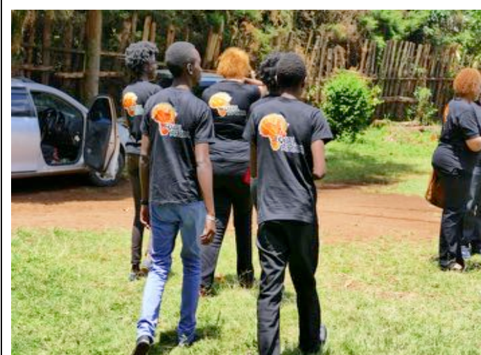
Equal Africa Team