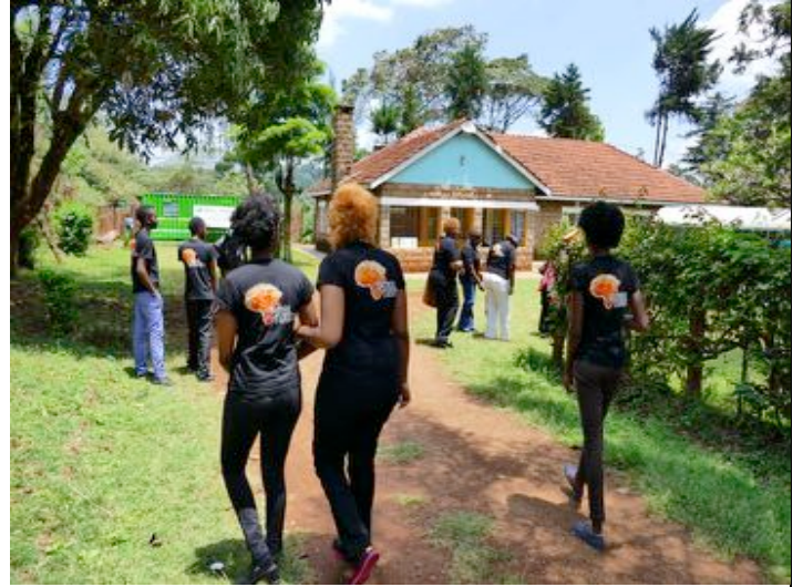
Equal Africa Team