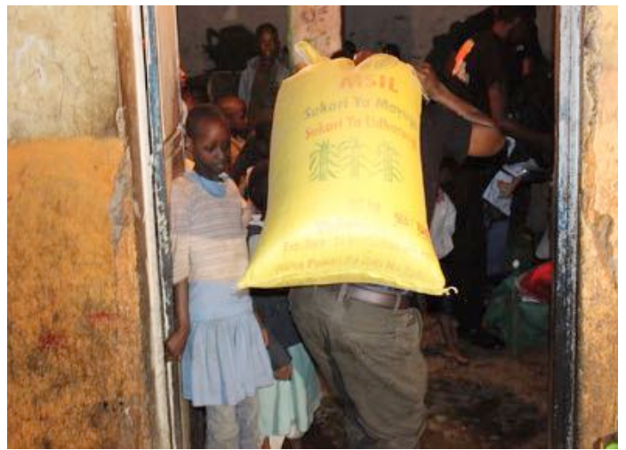
Offloading the Donations