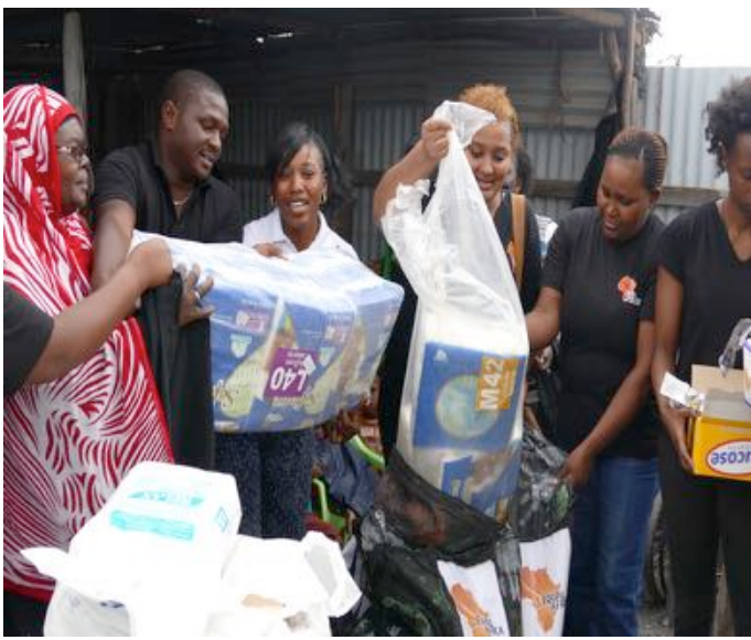
Unpacking the Donations