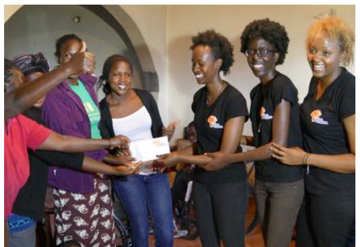
Presenting Cash Donations for Carers