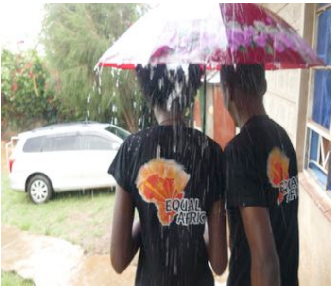
Equal Africa Volunteers