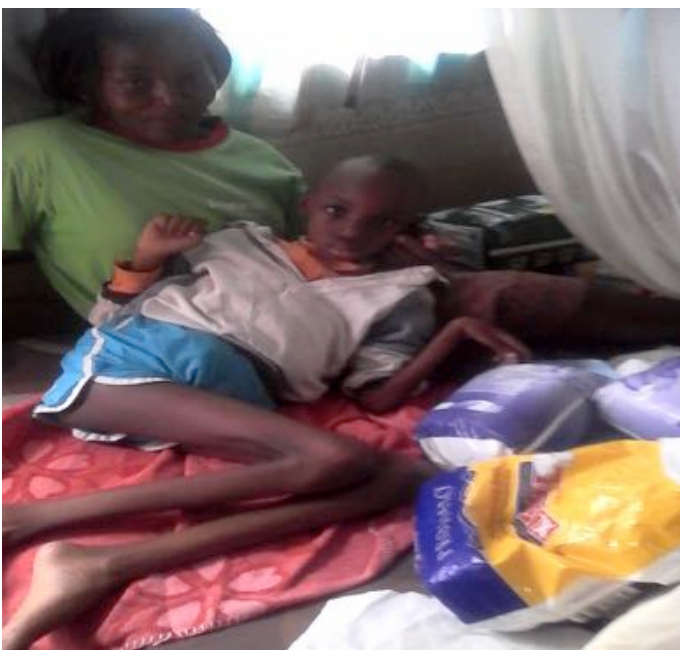
Happy to Receive Adult Diapers