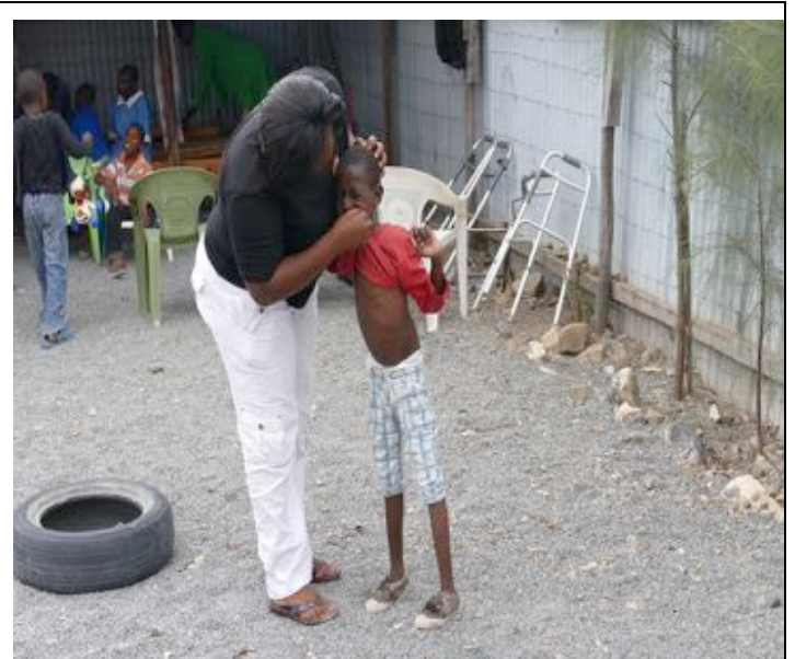
Equal Africa Volunteer at Compassionate Home