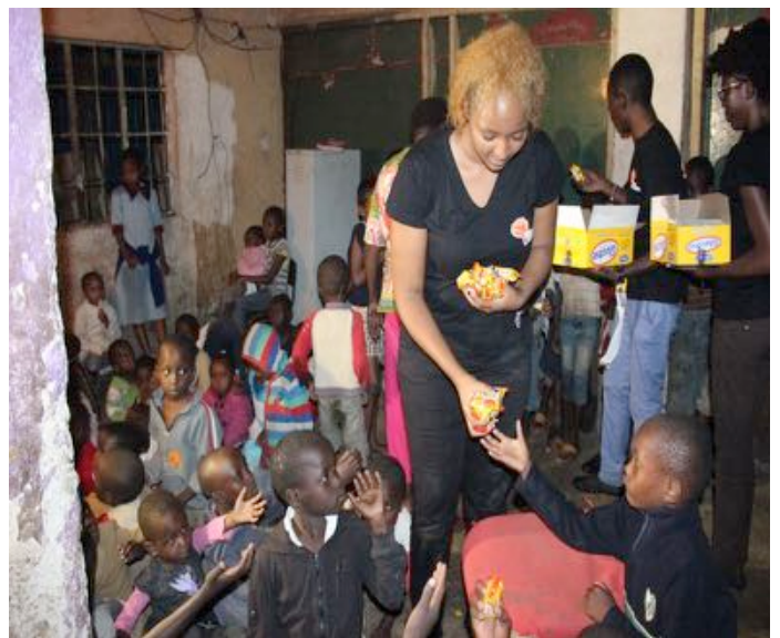
Volunteers Giving Biscuits to Kids