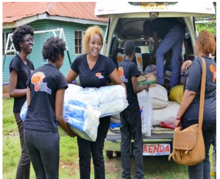
Equal Africa Team