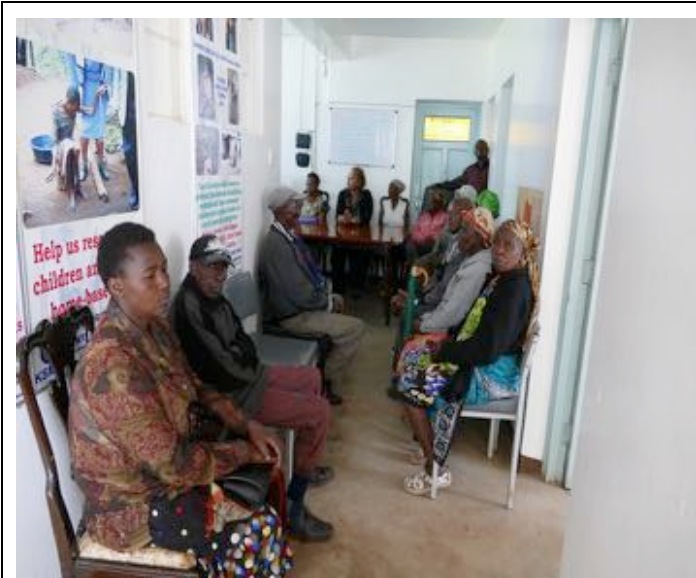
Elderly People who are Beneficiaries of Equal Africa