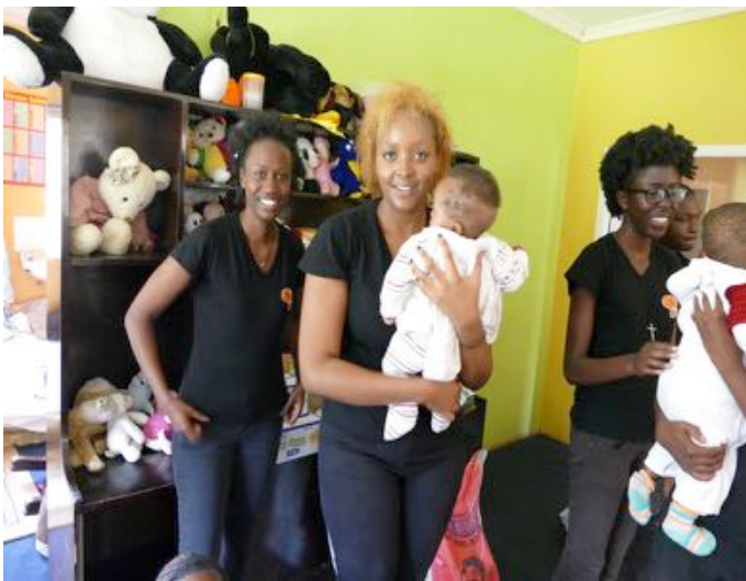
Equal Africa Volunteers with Kids