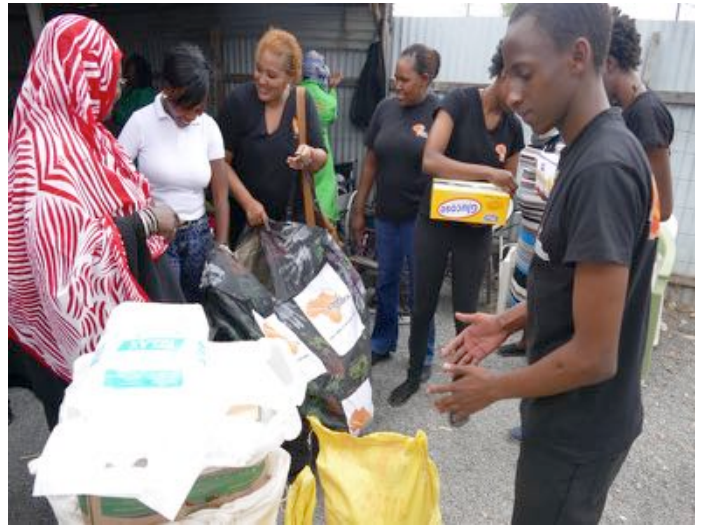
The Manager Happy to Receive Donations