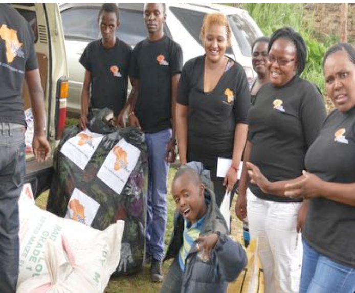
A Happy Child Welcomes Equal Africa Team