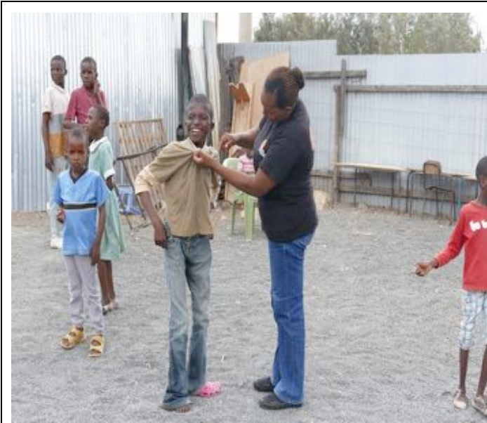
Equal Africa Staff at Compassionate Home