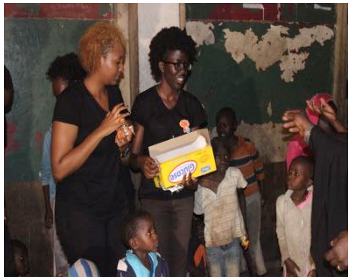
Volunteers Giving Biscuits to Kids