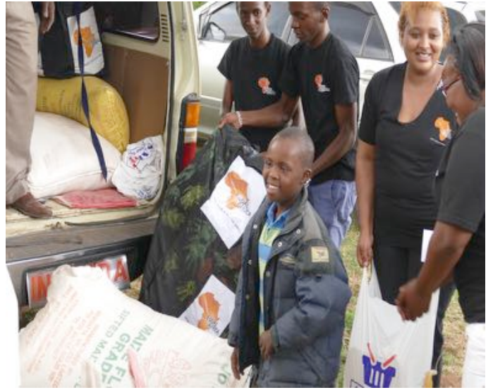
Offloading Food Items