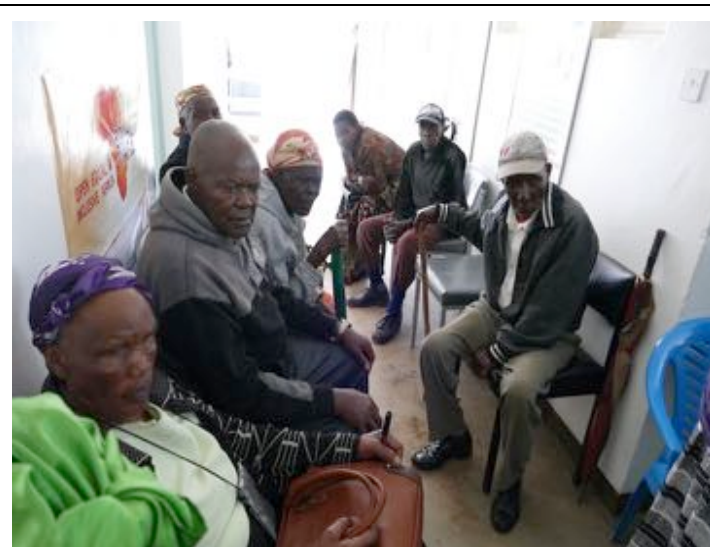
Elderly People who are Beneficiaries of Equal Africa