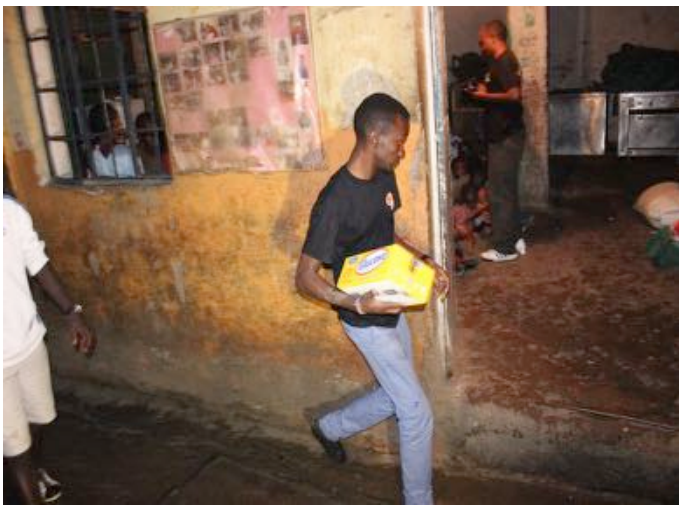
Offloading the Donations