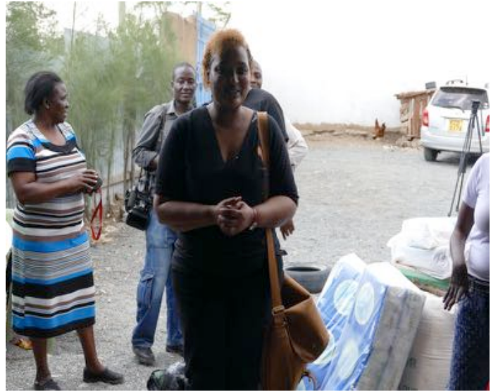
The Prabhudas Pattni Relief and Welfare Programme will Keep his Spirit Alive