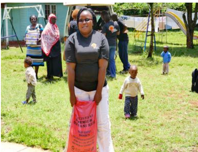
Equal Africa Volunteers