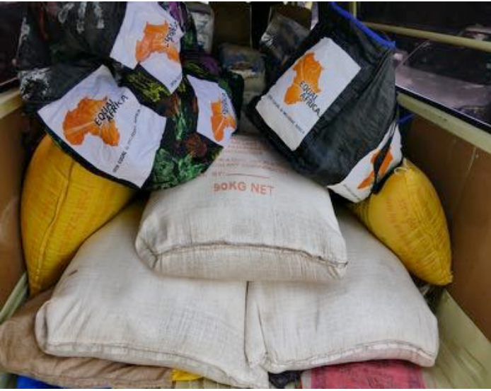
Food Donations for Total Rehab Home