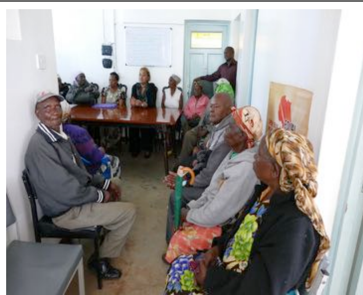
Elderly People at Equal Africa