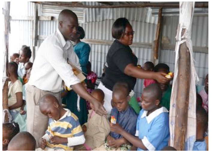
Volunteers Give Biscuits to Kids