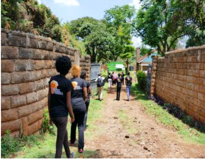
Equal Africa Team