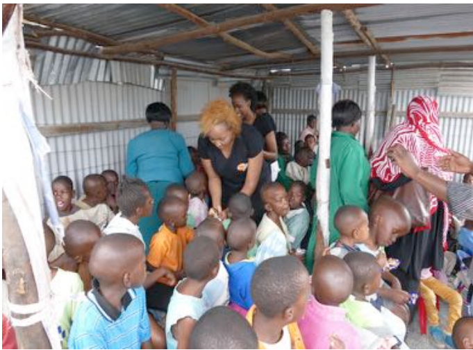
Volunteers Give Biscuits to Kids