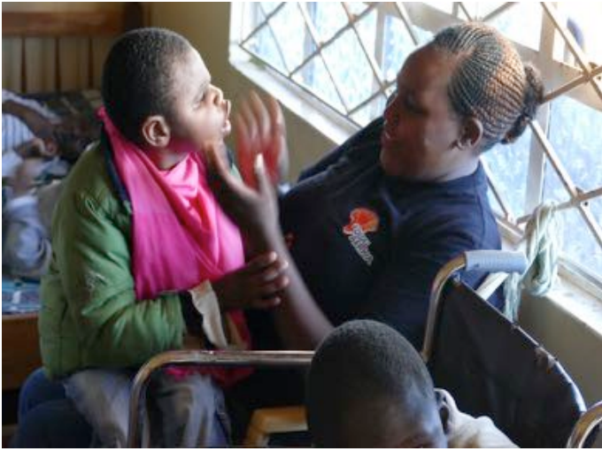
Equal Africa Staff with the Children