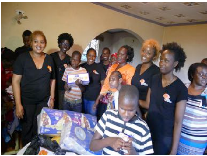
At the Total Rehab Home