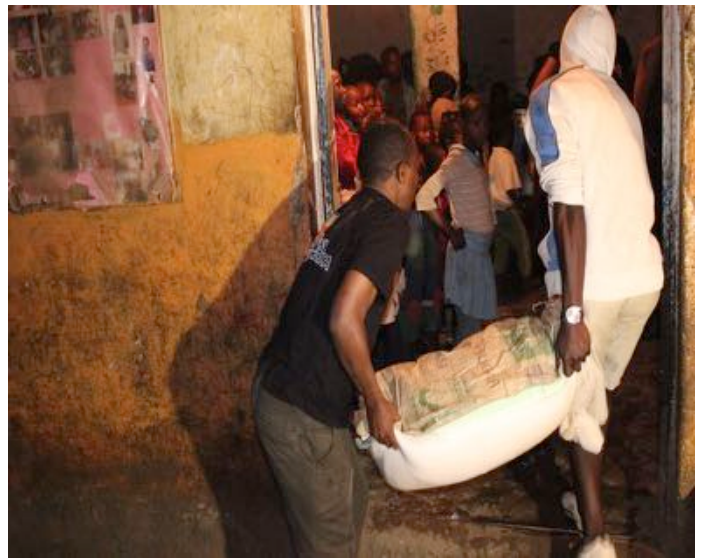
Offloading the Donations