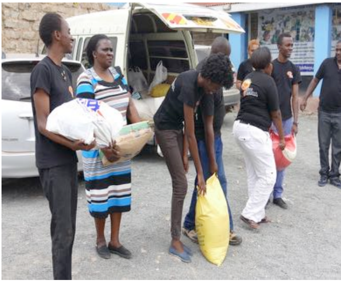
Equal Africa Team