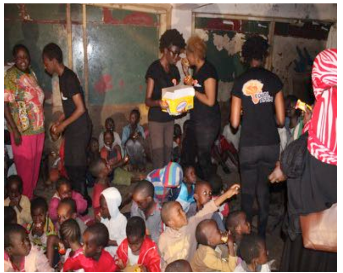
Volunteers Giving Biscuits to Kids