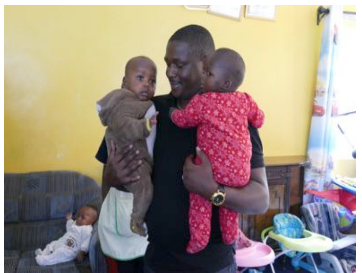
Equal Africa Staff holding Babies