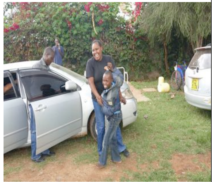
Happy Child Say Goodbye to Equal Africa