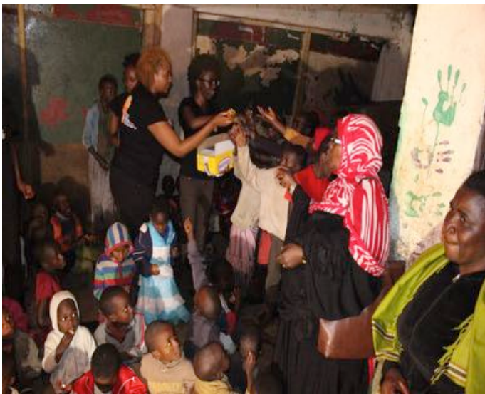
Volunteers Giving Biscuits to Kids