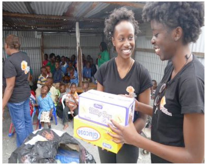
Equal Africa Team