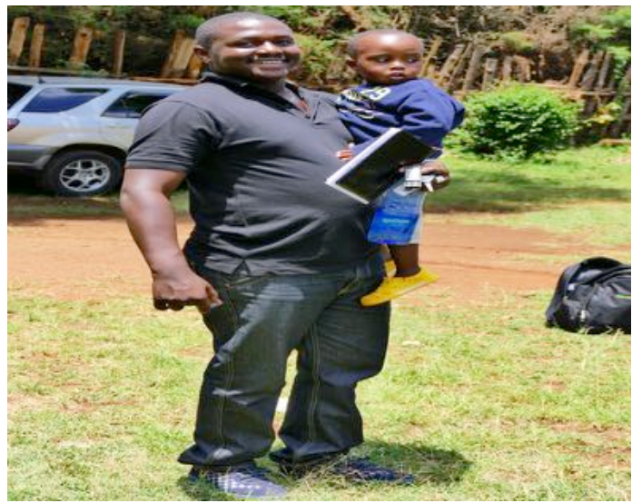
Equal Africa Staff at Angle Centre