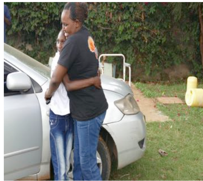
Happy Child Say Goodbye to Equal Africa