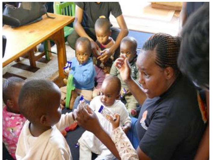
Equal Africa Staff