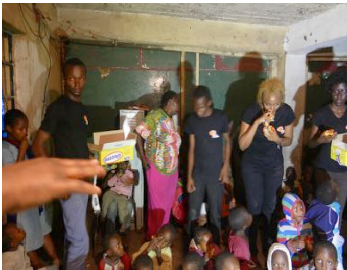
Volunteers Giving Biscuits to Kids