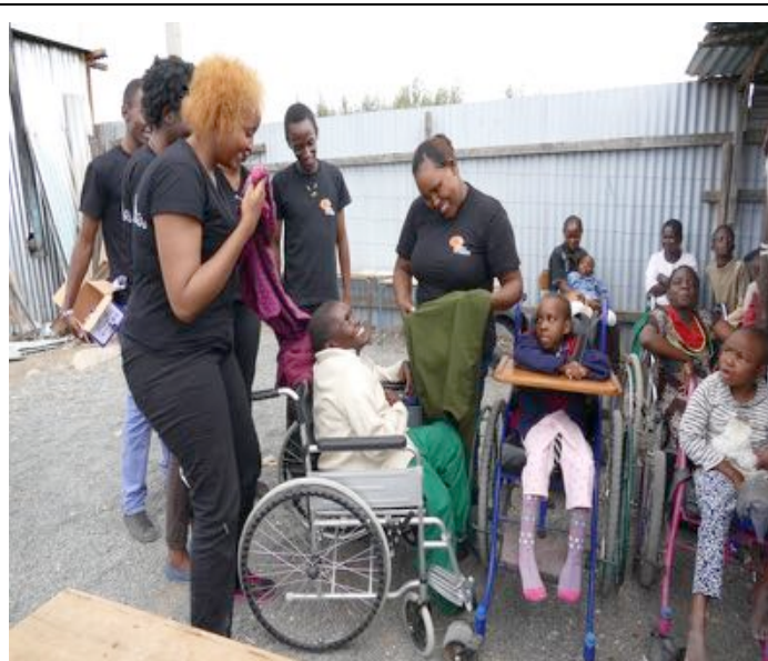
She is Happy to Receive Dresses