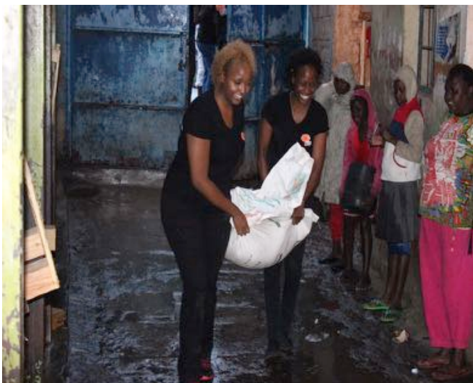
Offloading the Donations