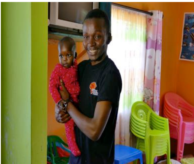
A Volunteer Holding a Baby at Angel Centre