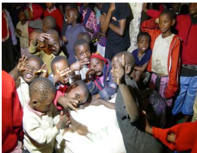
Happy Children Say Goodbye to Equal Africa Team