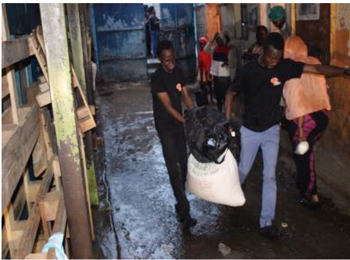
Offloading the Donations