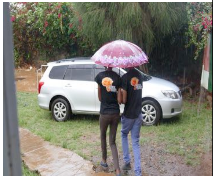
Equal Africa Volunteers