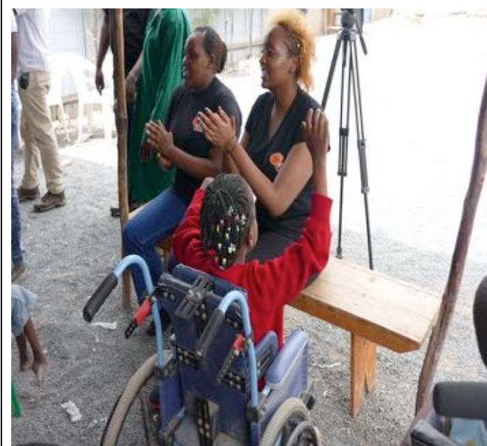
Equal Africa Team