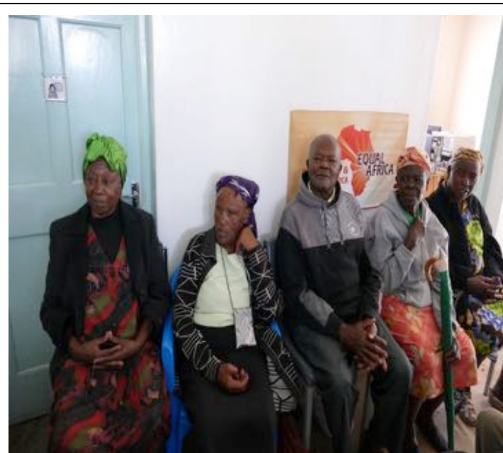
Elderly Beneficiaries of Equal Africa