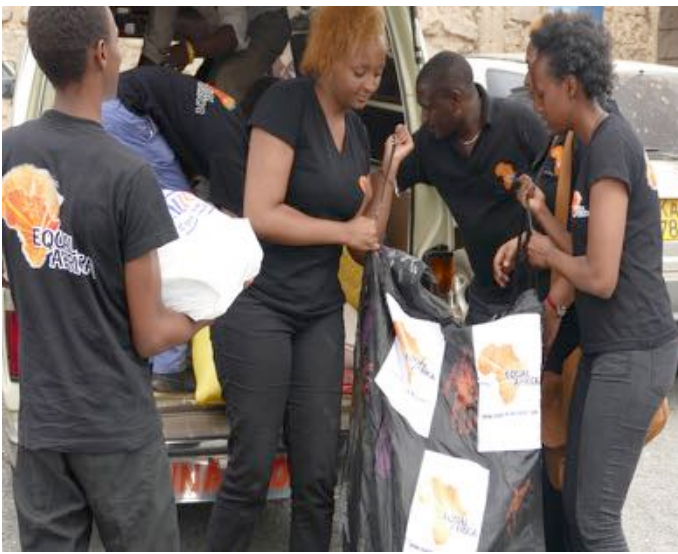
Equal Africa Team