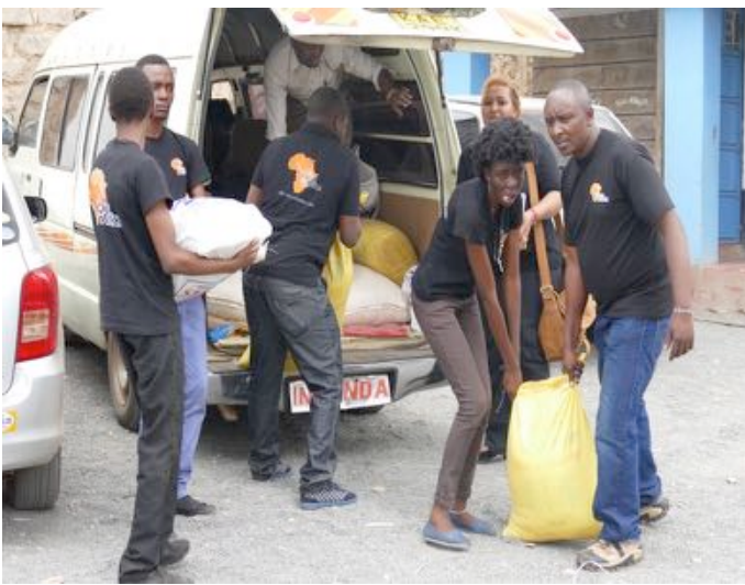
Equal Africa Team