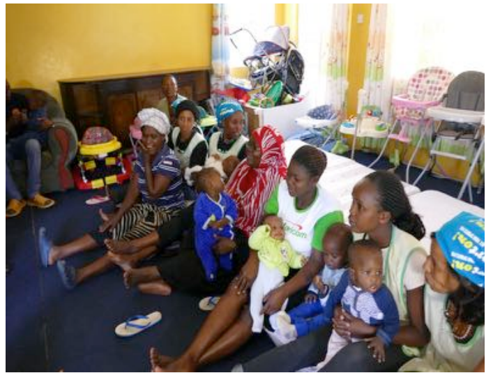
Caring for Abandoned Babies