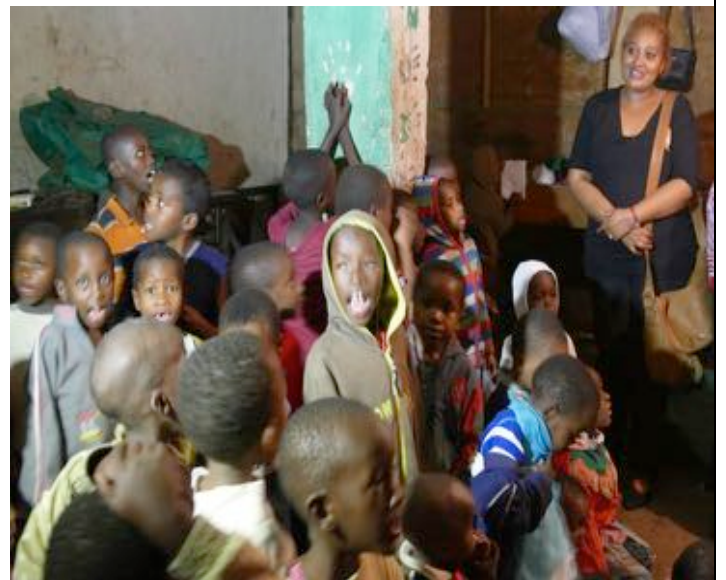
Good Samaritan Home