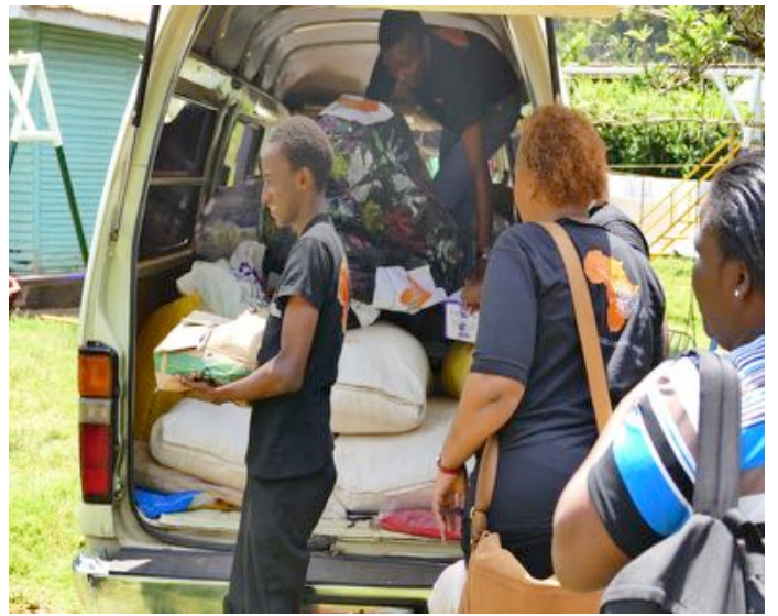
Offloading the Donations