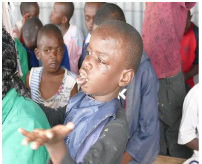
A Child Asking for More Biscuits