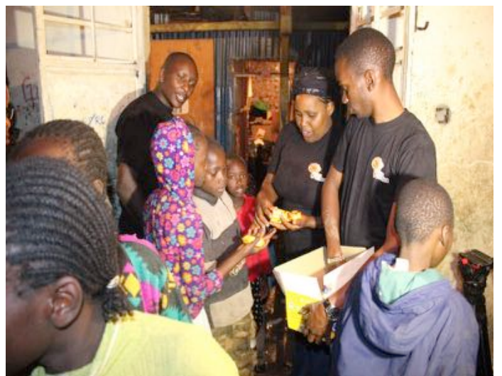
Volunteers Giving Biscuits to Kids