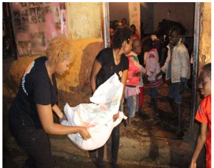
Offloading the Donations