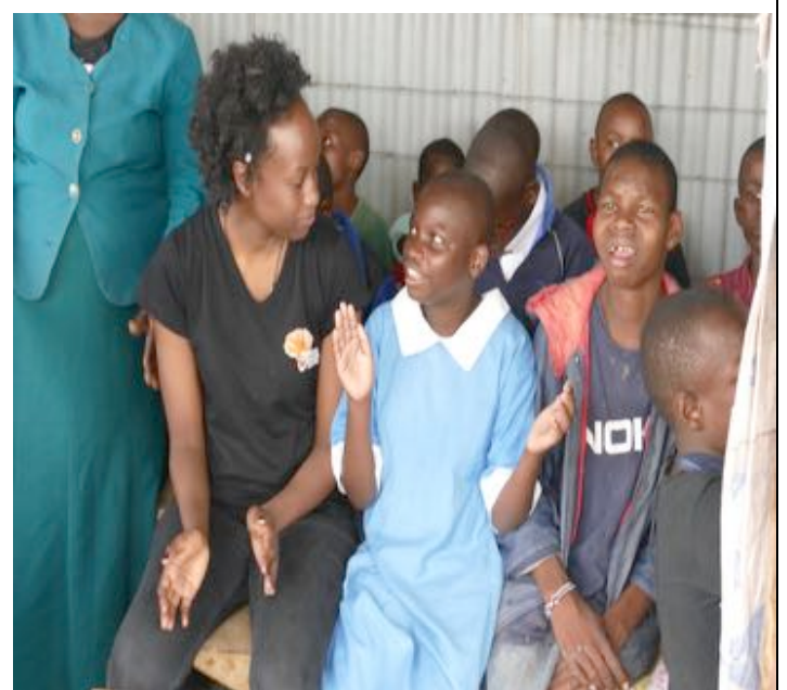
Equal Africa Volunteer Singing with Children