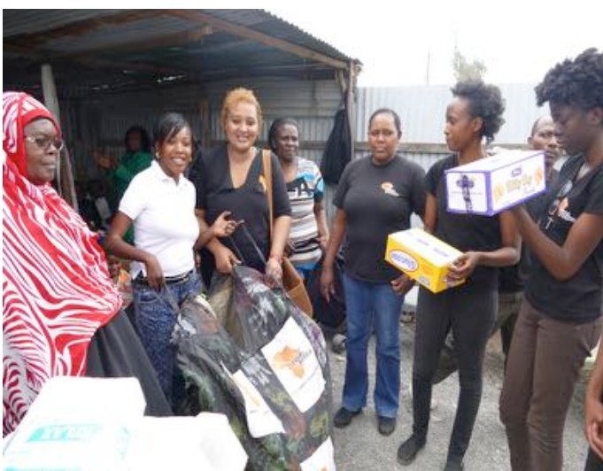
Executive Director Presents Donations