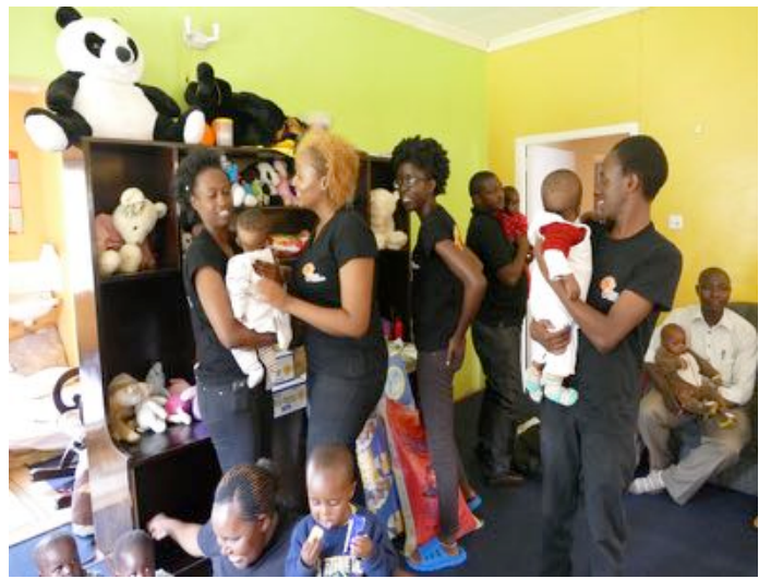
Interacting with Abandoned Babies