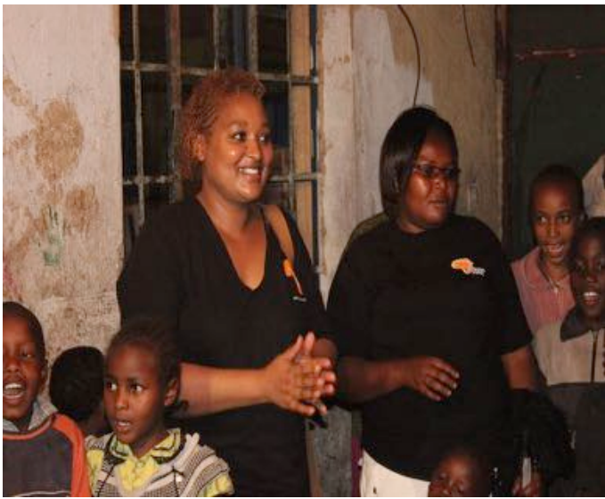
Equal Africa Team