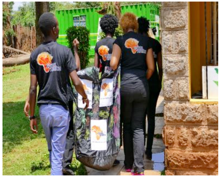
Donations for Angle Centre