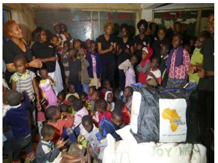
The Orphans and Equal Africa Team