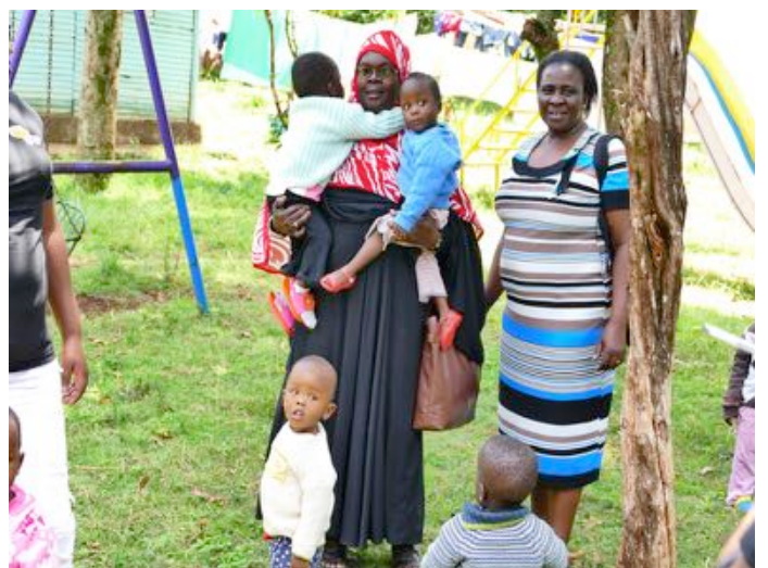
Kids Happy to See Equal Africa Team