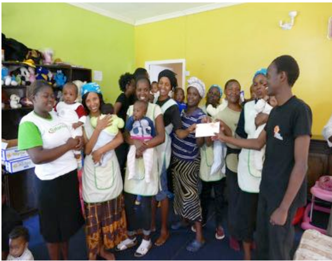
Carers Happy to Receive Cash Donation