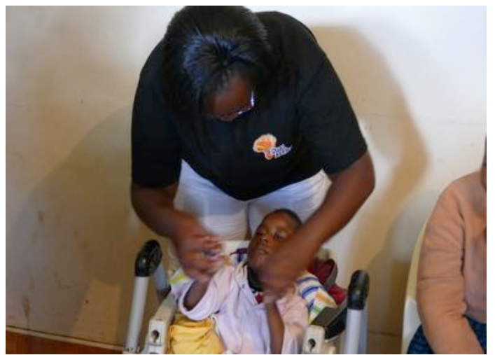
A Volunteer Speaking with a Child