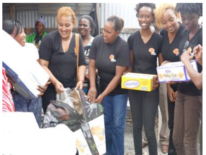
The Manager Happy to Receive Donations