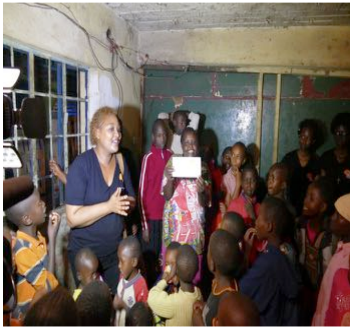
Cash Donation for the Carers