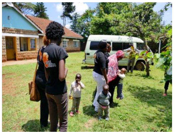
Equal Africa Team Playing with the Kids