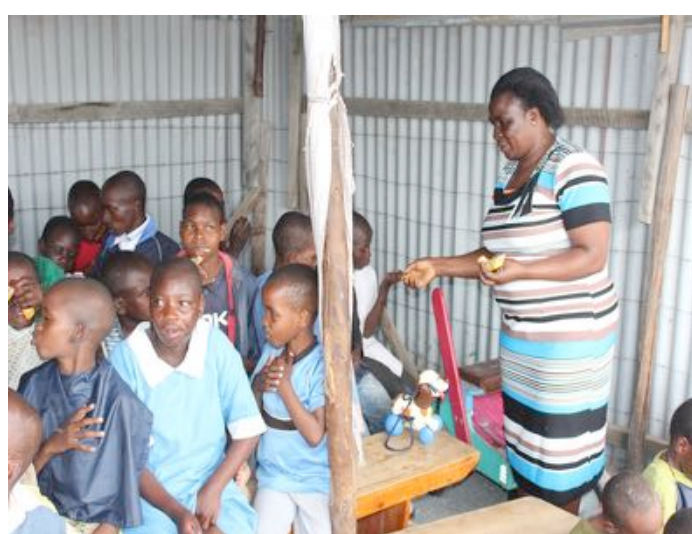
A Volunteer Giving Biscuits to Orphans