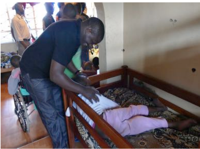
Equal Africa Staff Interact with Children