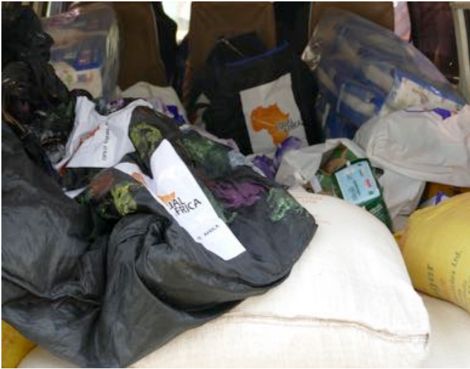
Donations for Compassionate Home