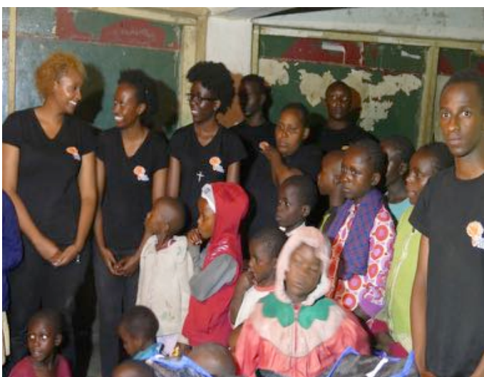
Volunteers at Good Samaritan Home