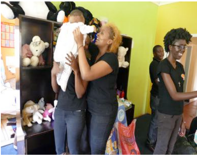
Happy to be at Angles Centre