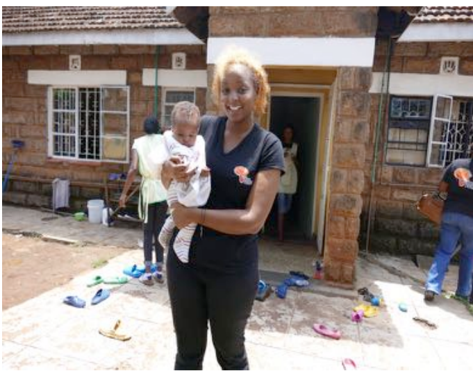
A Volunteer Interacts with a Baby