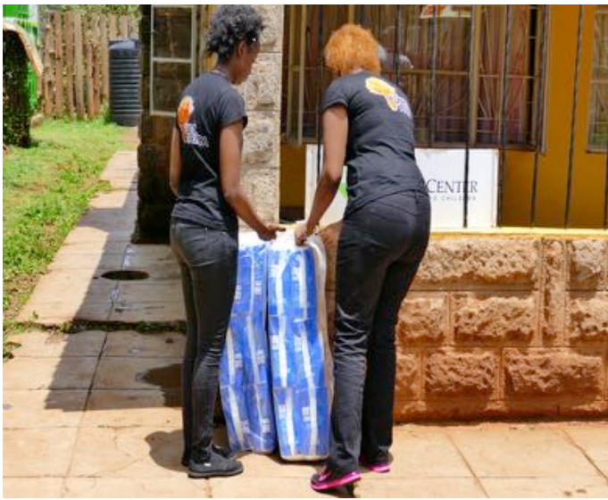
Diapers for Use during Water Shortage