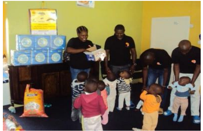
Children at the Home being served with snacks