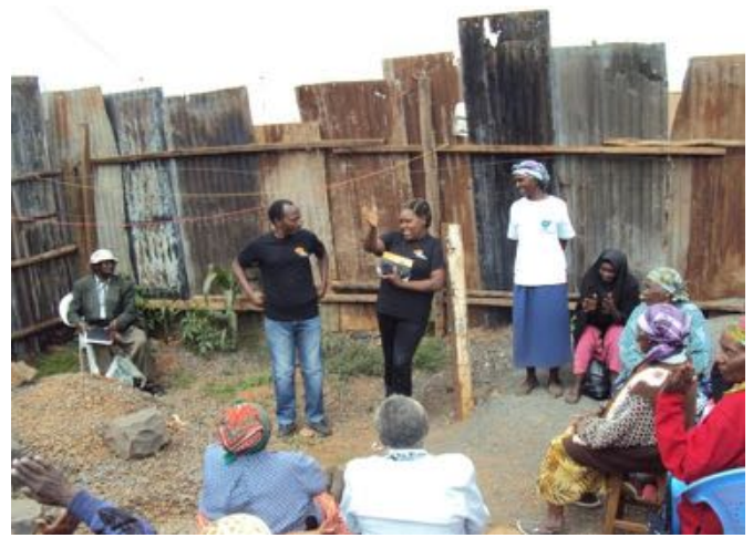
Equal Africa staff consulting