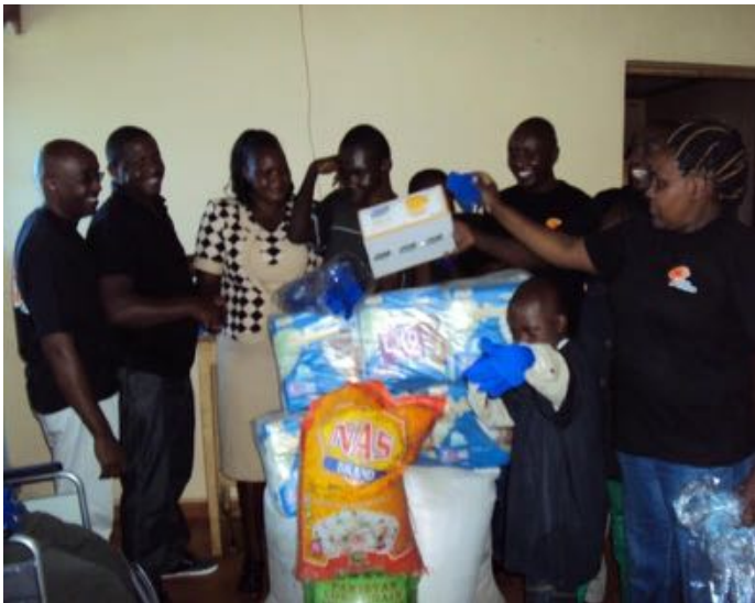
Donations presentation at the Home