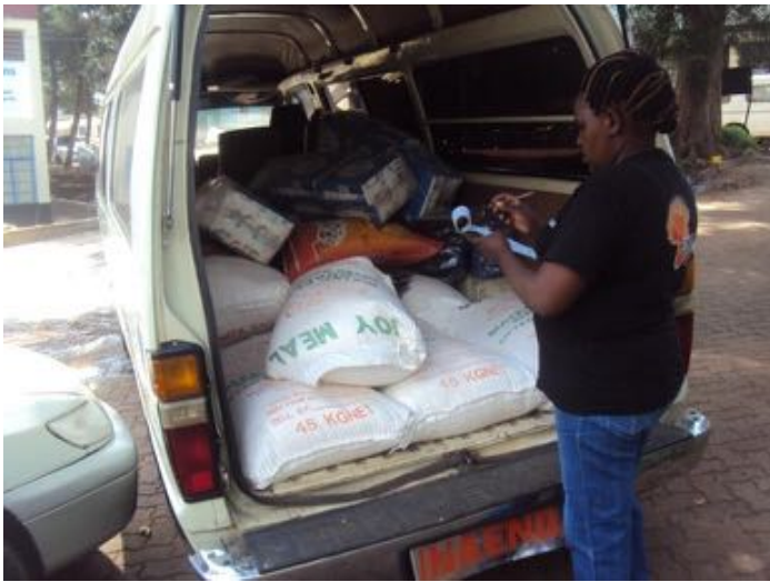
EA staff verifying donations before departure to Homes