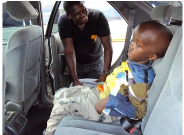
A PWID being taken to hospital by EA vehicle