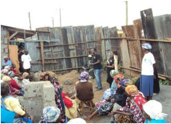
EA staff addressing the elderly