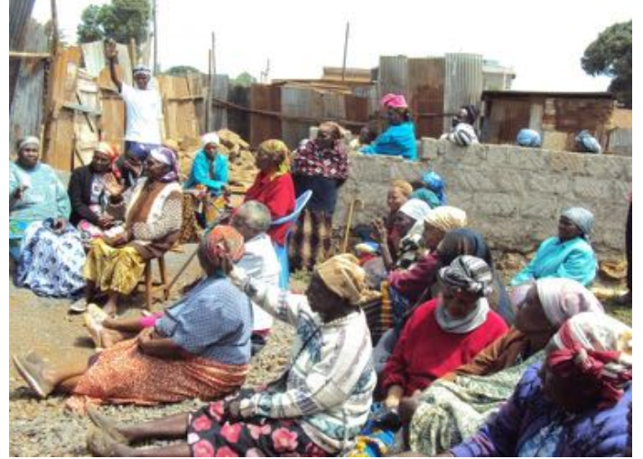
Elderly people during the function