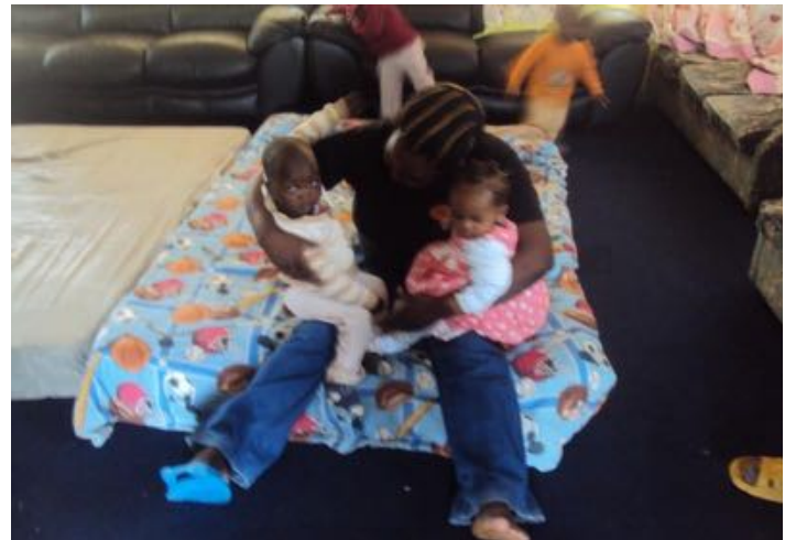
An Equal Africa staff interacting with abandoned children