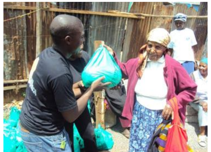
Food donation presentation