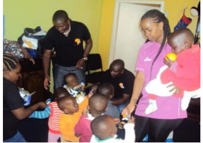
Abandoned children eating biscuits