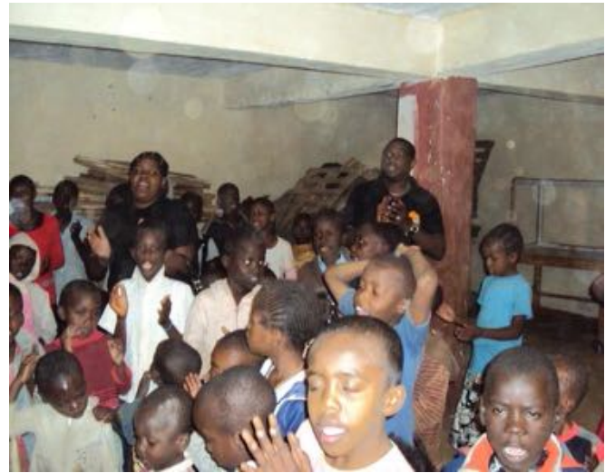
Orphans singing for joy