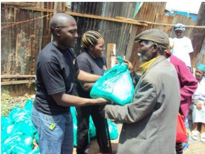
An elderly lady giving thanks for the food donation