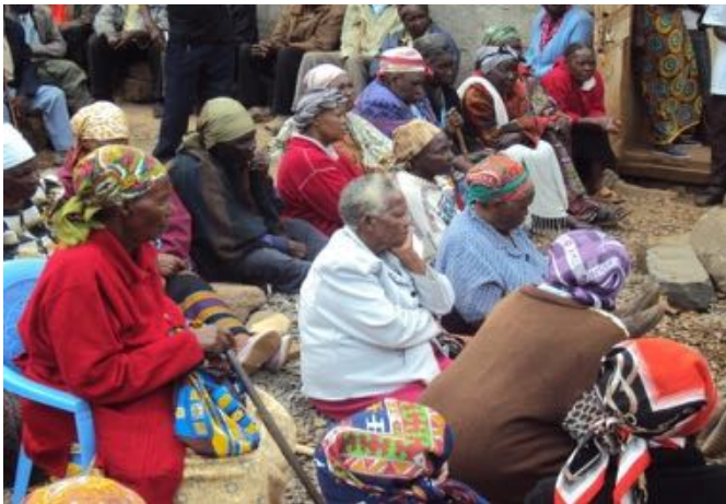
Elderly people listening to the speaker