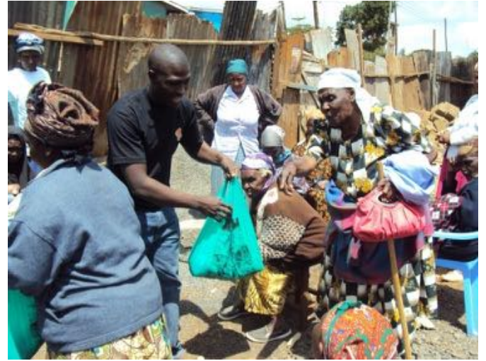
An elderly woman receiving food donation