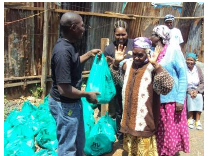
An elderly lady giving thanks for the donation