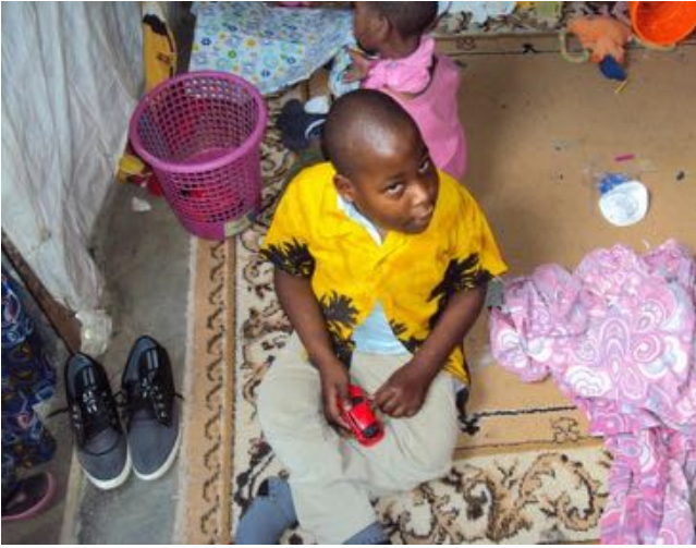
A child in a happy mood at the Home