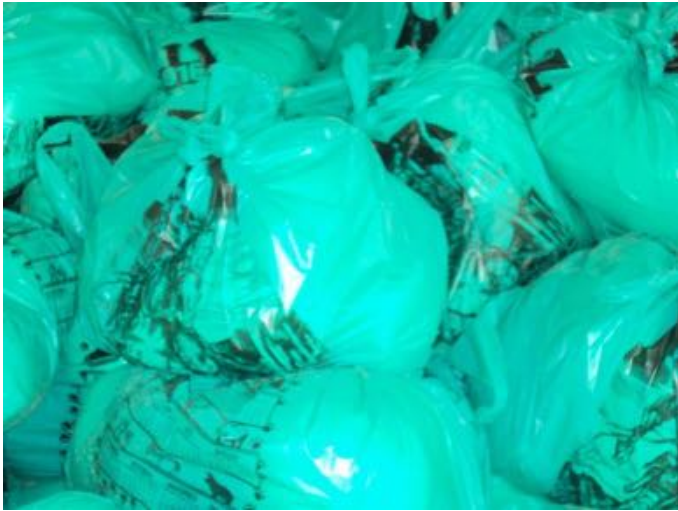
Donations for the elderly