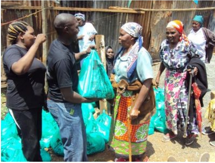
An elderly woman receiving food donation