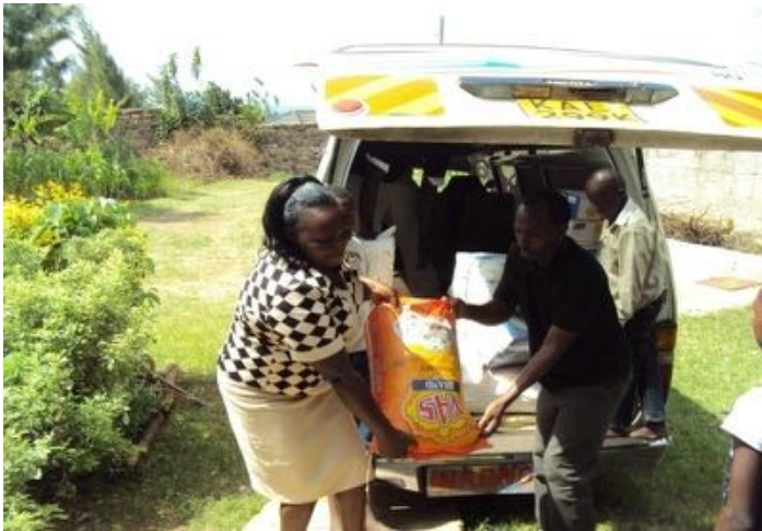
Donations being off-loaded