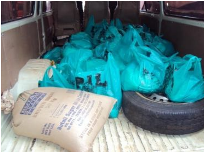
Donations for the elderly