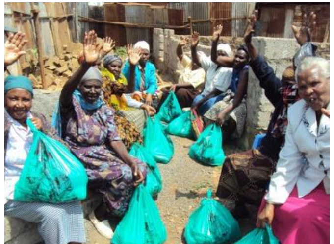
Elderly persons showing appreciation after receiving food donations