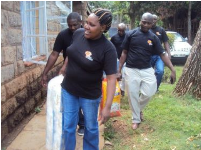
Equal Africa team delivering donation