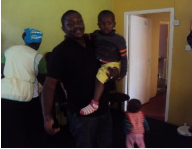
Equal Africa staff carrying an abandoned child