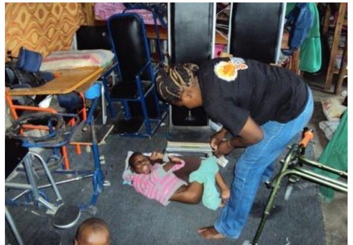
Equal Africa staff dressing a bed-ridden