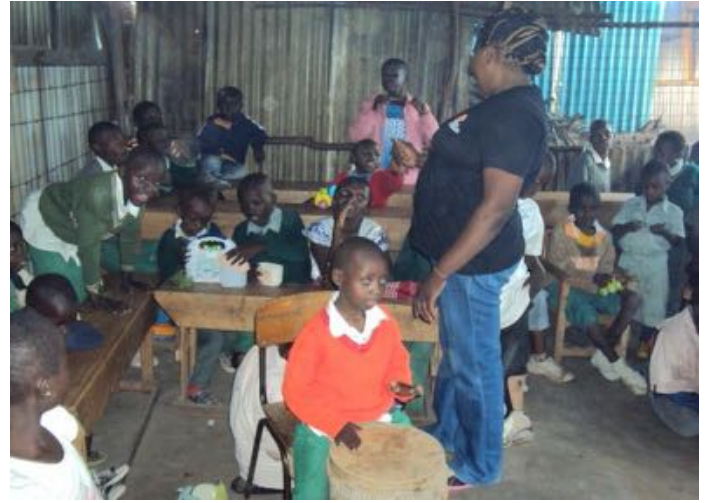
A visually-impaired child playing drum at the Home