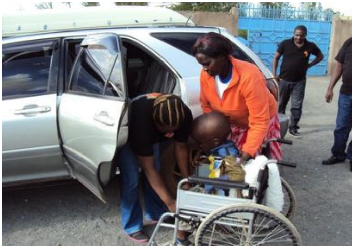
Equal Africa staff helping a PWID board a vehicle to the hospital