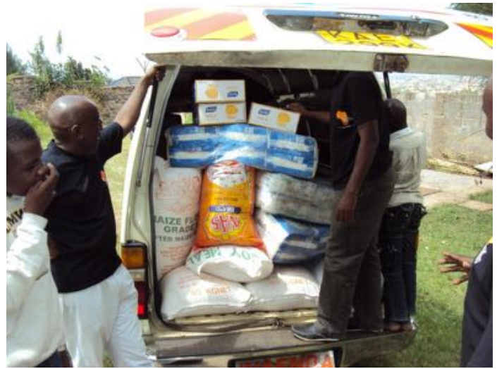
Donations arrives at the Home