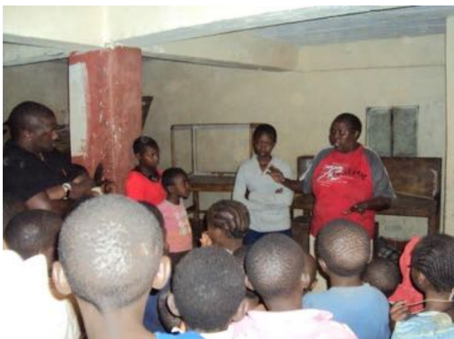
Good Samaritan MD giving a vote of thanks