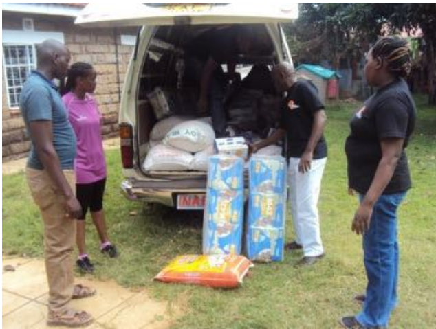
Donations arrive at Angel's Home