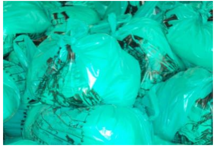
Donations for the elderly