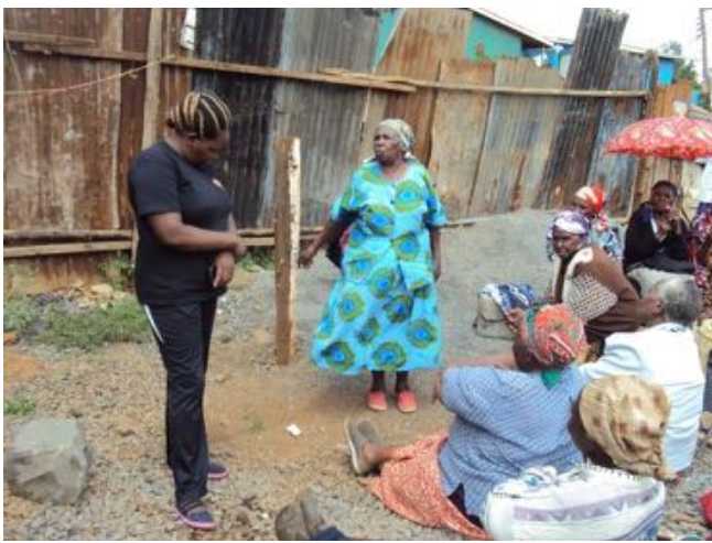
An elderly asking a question