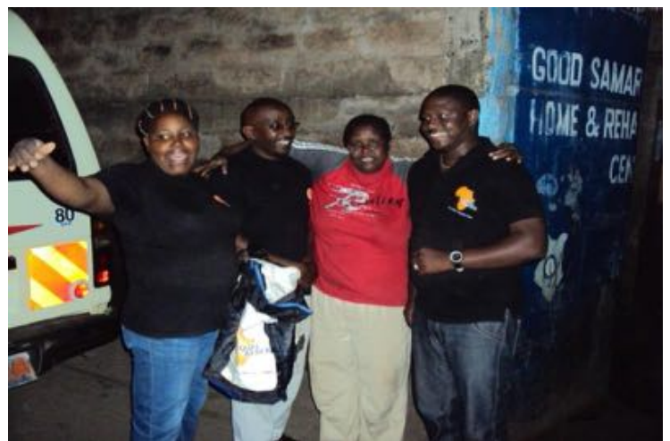
Mercy, Good Samaritan MD bids EA team bye