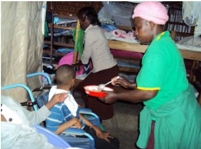
Caregiver feeding a disabled child at the Home