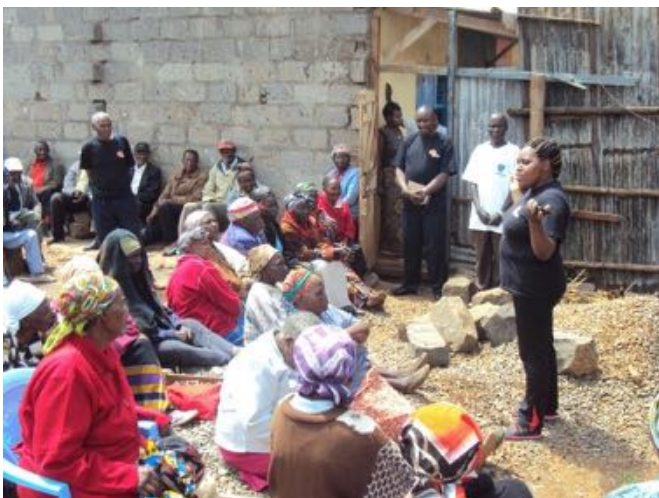
EA staff addressing the elderly