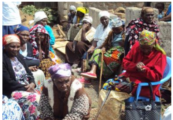
Elderly persons listening keenly to the speaker.