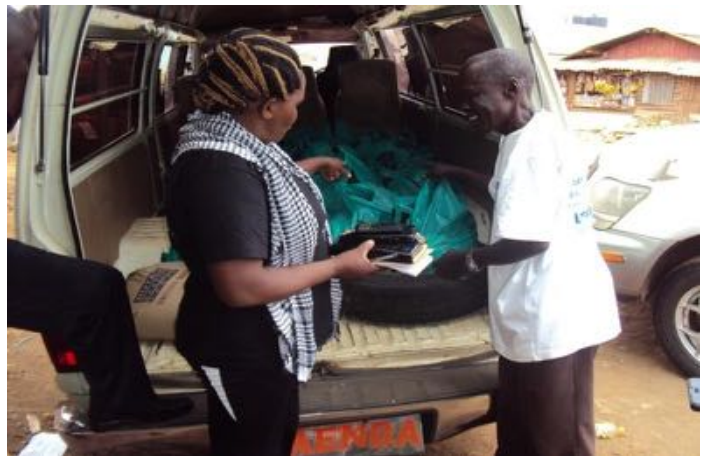
Equal Africa staff with an elderly person