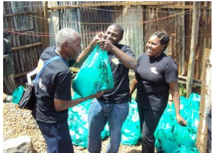
Food donation presentation to an elderly lady