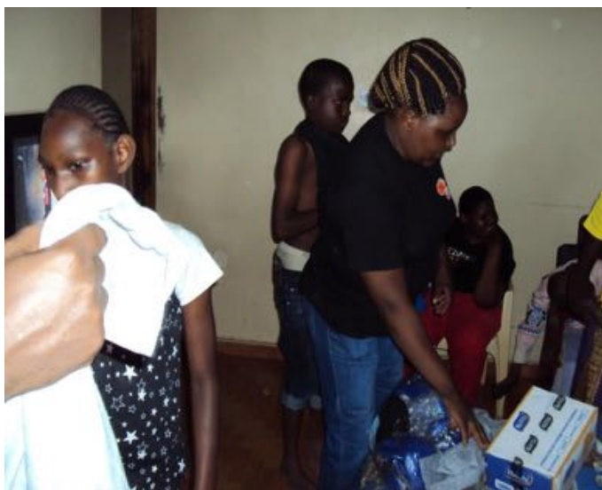
EA staff with PWIDs at Toto rehab