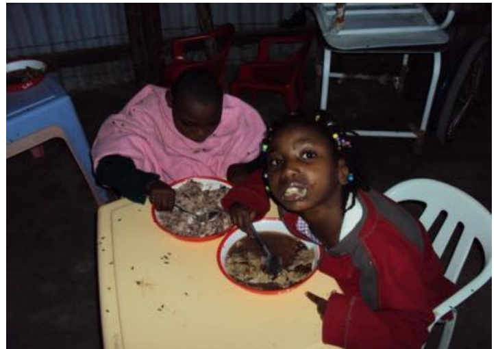
PWID children feeding at the Home