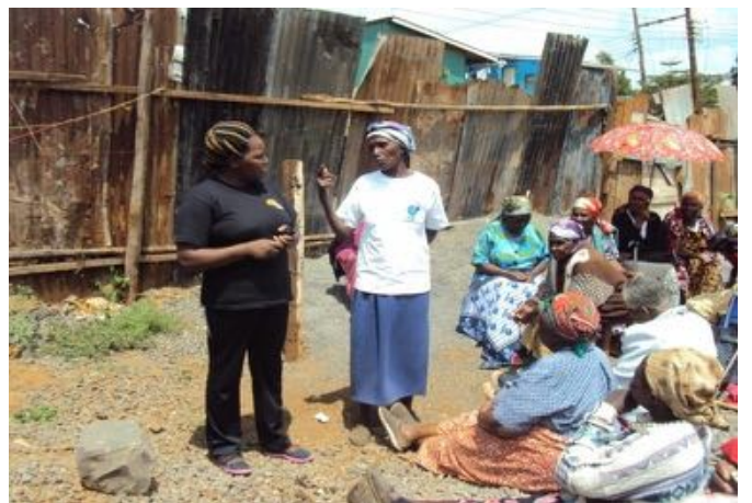
The elderly person making comments