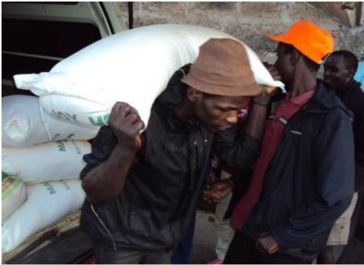
Donation being Off-loaded