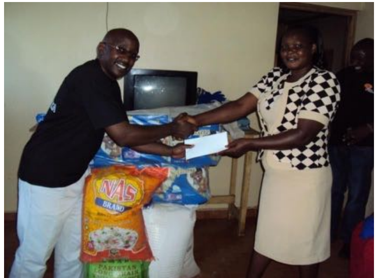
Cheque presentation to the Home