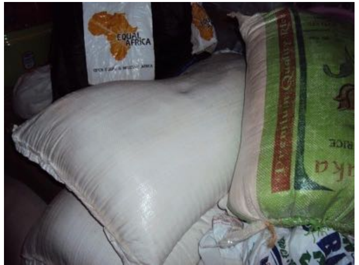
Donations for the Homes