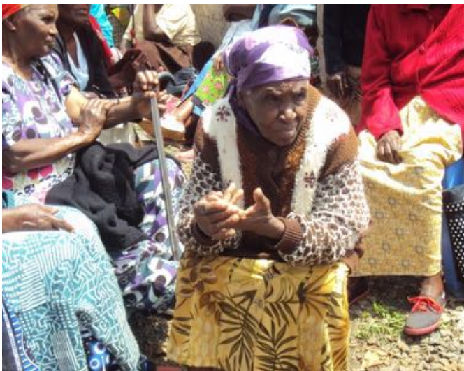
An elderly woman following the proceedings