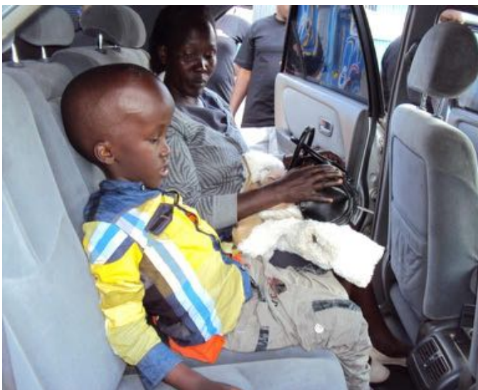
A PWID with a caregiver headed for hospital