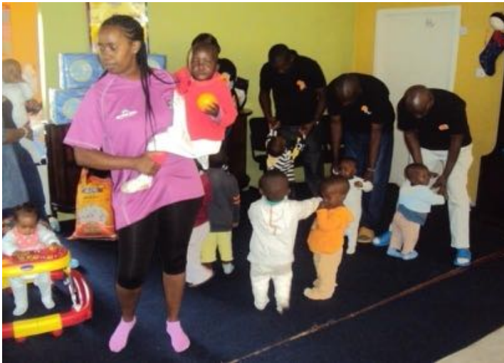
Equal Africa team training orphaned-toddlers how to walk