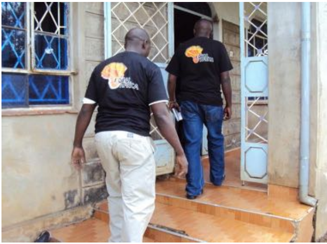
EA team enters the Home