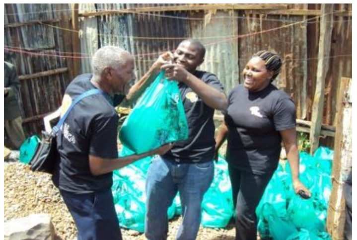
Food donation presentation to an elderly lady