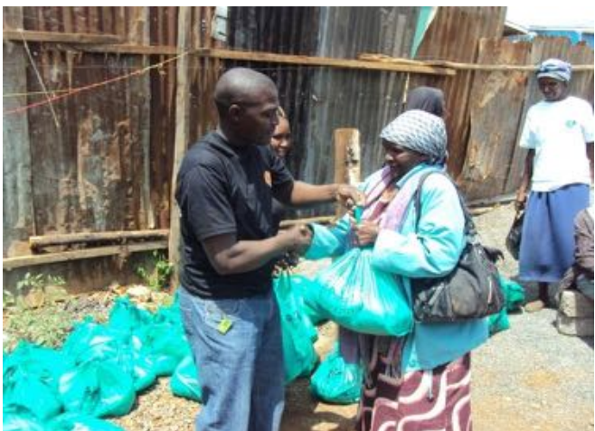
An elderly lady giving thanks for the food donation