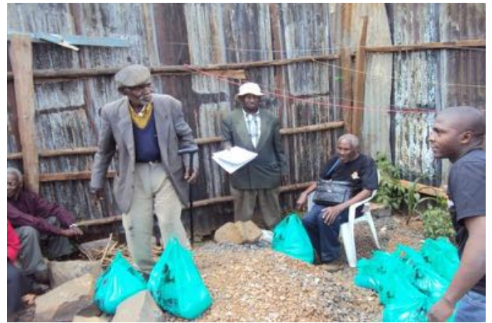
An elderly person with a list of the elderly persons