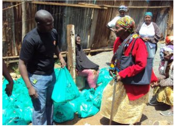
Elderly appreciating food donation