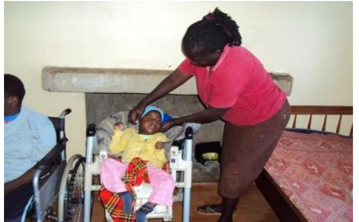
A caregiver fitting an orphan a warmth- cap