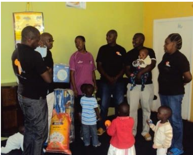
Equal Africa team interacting with orphans