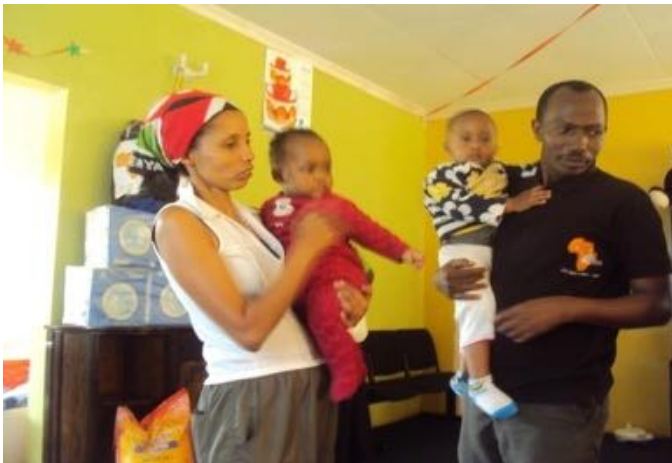
Abandoned children at the Home.