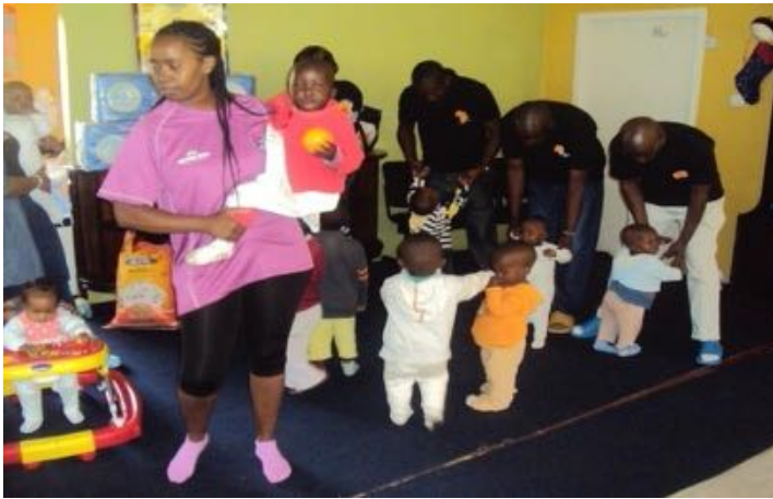
Abandoned children having at the Home