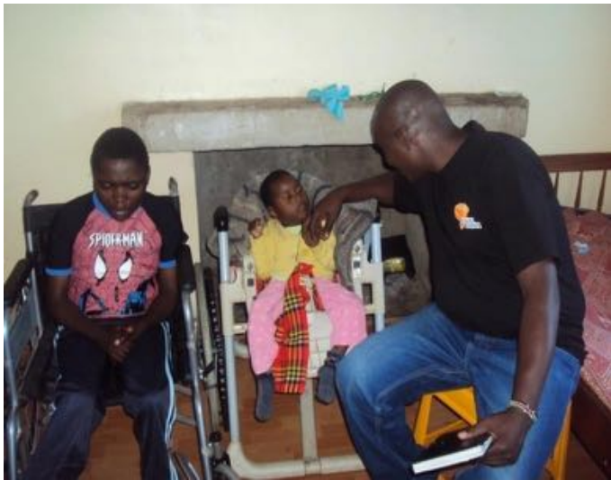
EA staff interacting with children at the Home