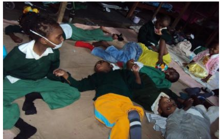
Bed-ridden children at the Home