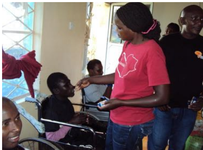
A caregiver feeding a PWID at the Home