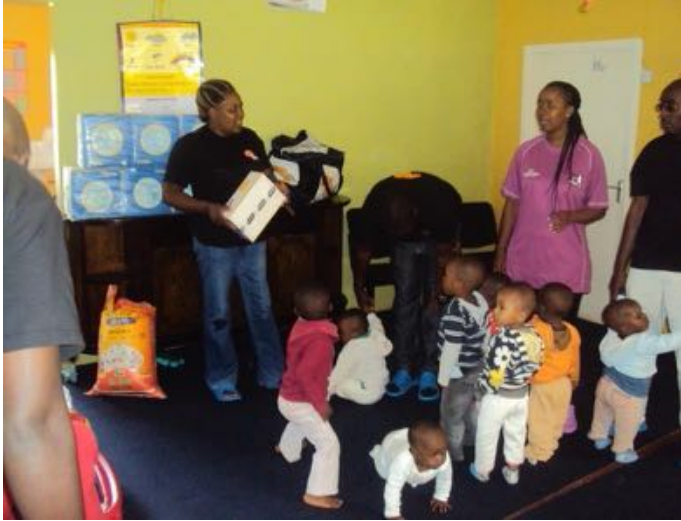
Abandoned children waiting to be served with snacks