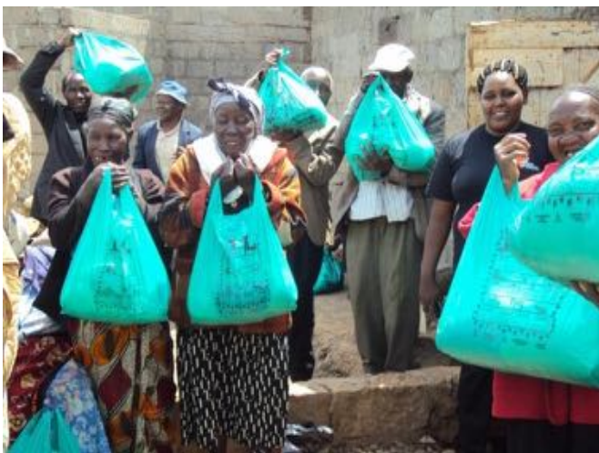
Elderly people show appreciation for the donation