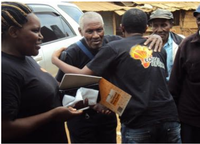
Elderly mutembei welcomes EA team