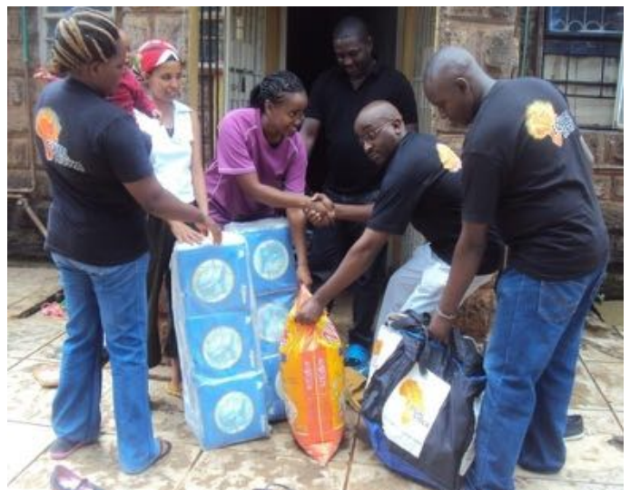
Donations presentation at the Home.