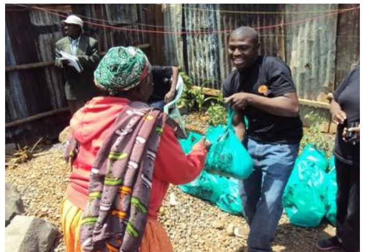
Food donation presentation to an elderly woman