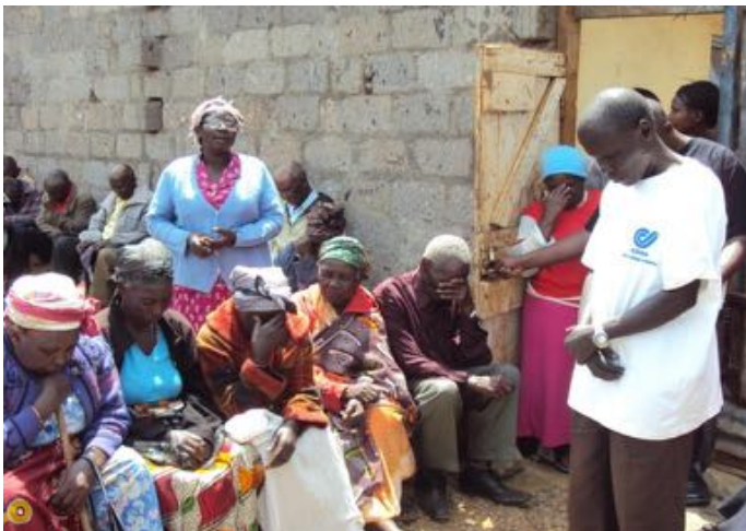
An elderly praying for the meeting