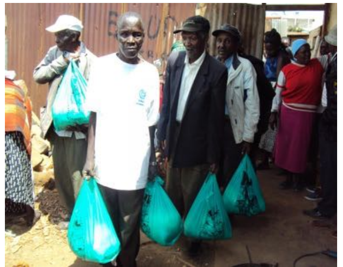
Elderly bids EA team bye