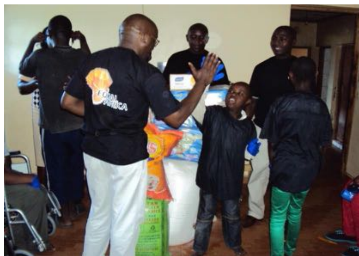
Equal Africa staff having fun with a PWID at the Home