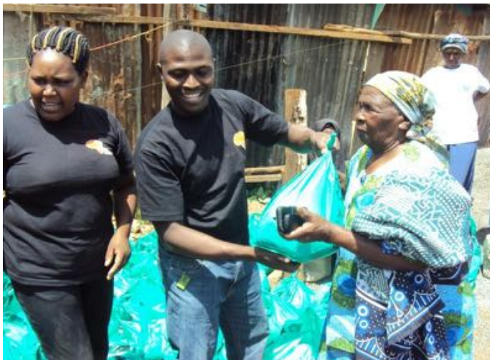
Elderly appreciate food donation