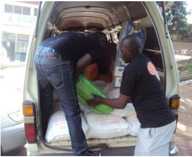
Equal Africa staff loading donations