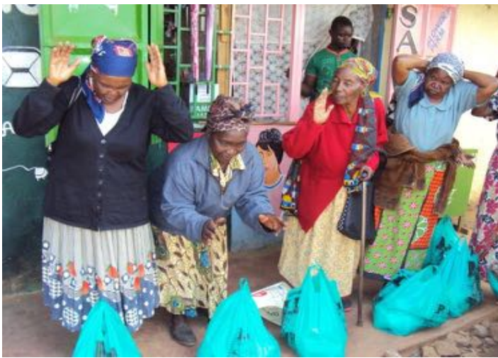
Elderly expressing their gratitude to EA