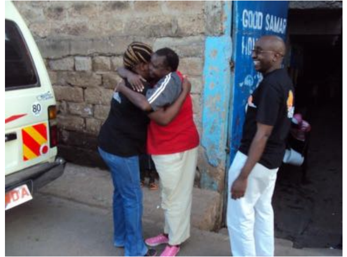
Equal Africa team being welcomed at the Good Samaritan Home