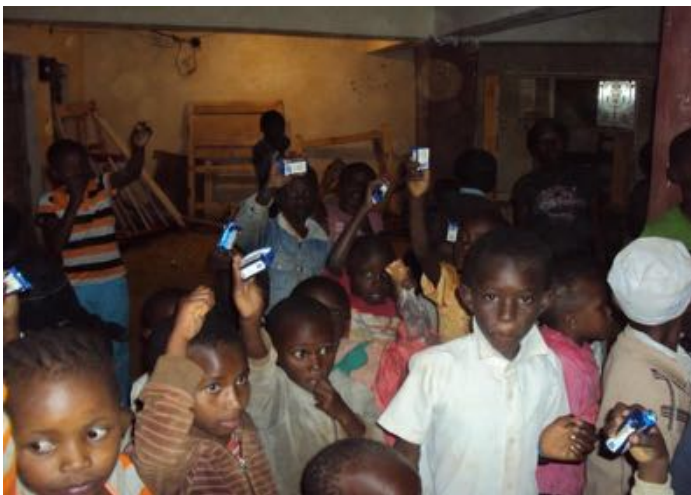
Orphans enjoying snacks