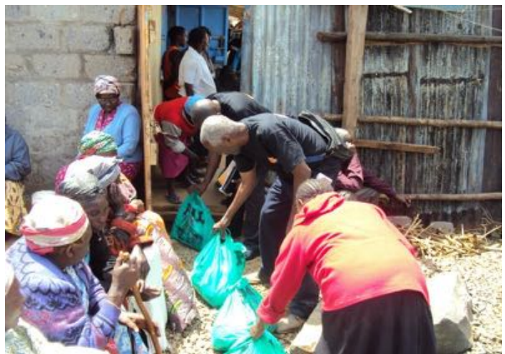
Elderly persons help in arranging food donations