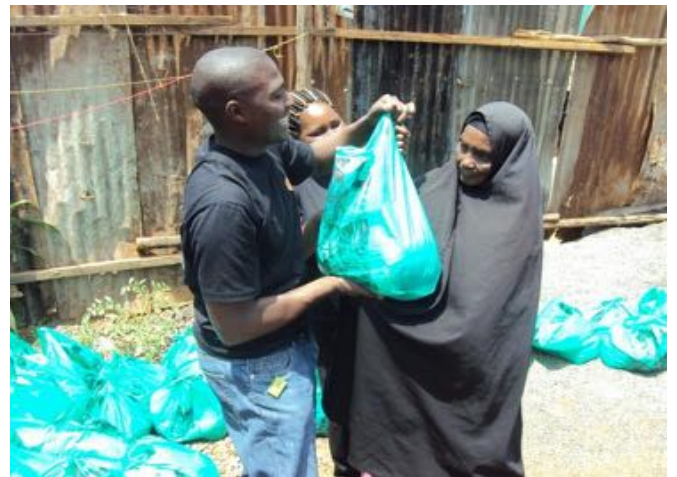
Food donation presentation to an elderly lady