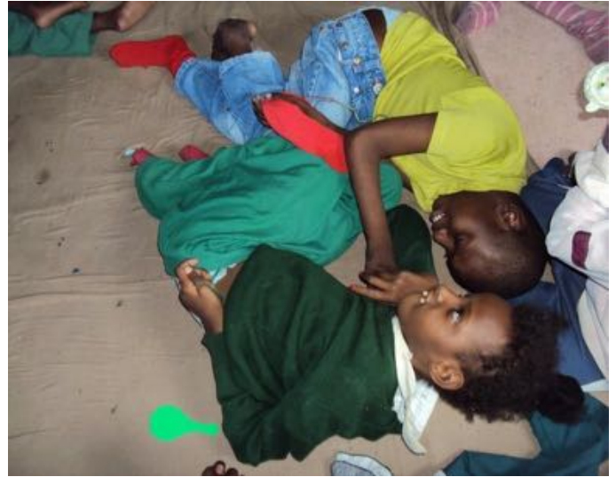
Bed-ridden children at the Home