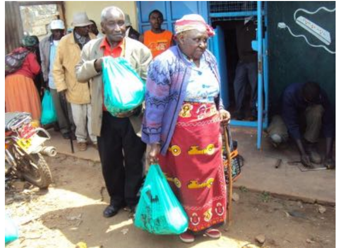
Elderly leaving for home