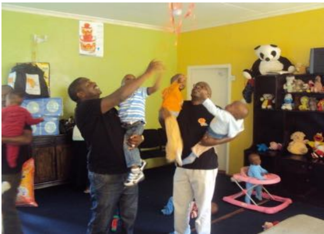
Equal Africa team interacting with orphans