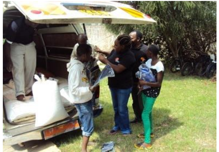
Children at the Home help to off-load donations