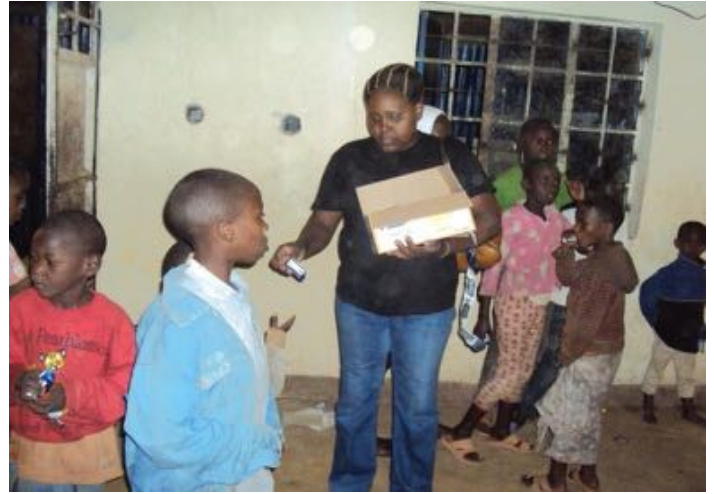
EA staff giving snacks to the orphans