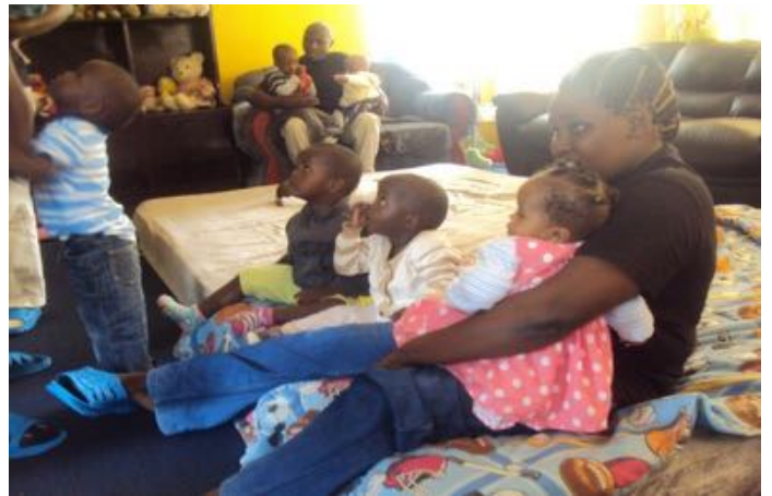
Equal Africa staff interacts with a girl who is mentally disabled