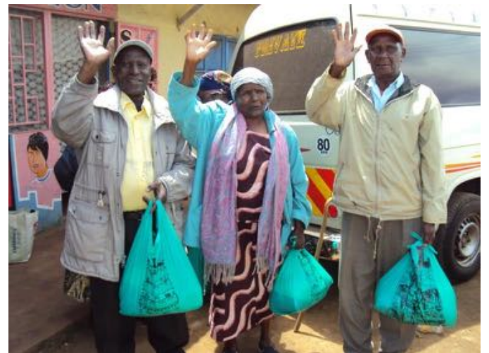
Elderly bids EA team bye