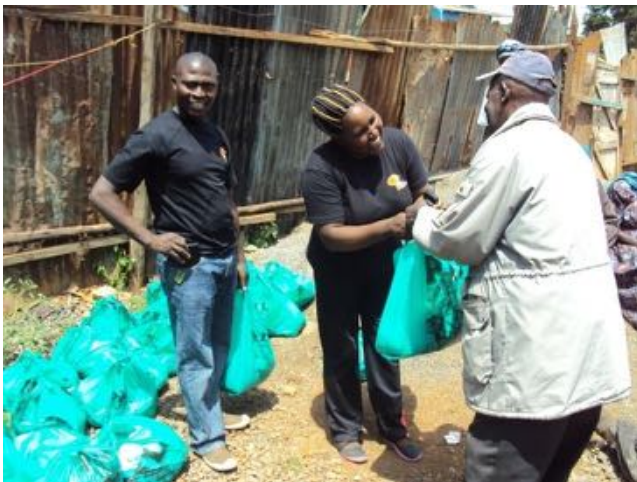
An elderly man receiving food donation