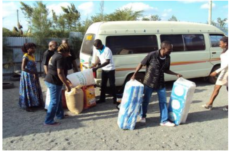
Donations deliveries to Compassionate Home