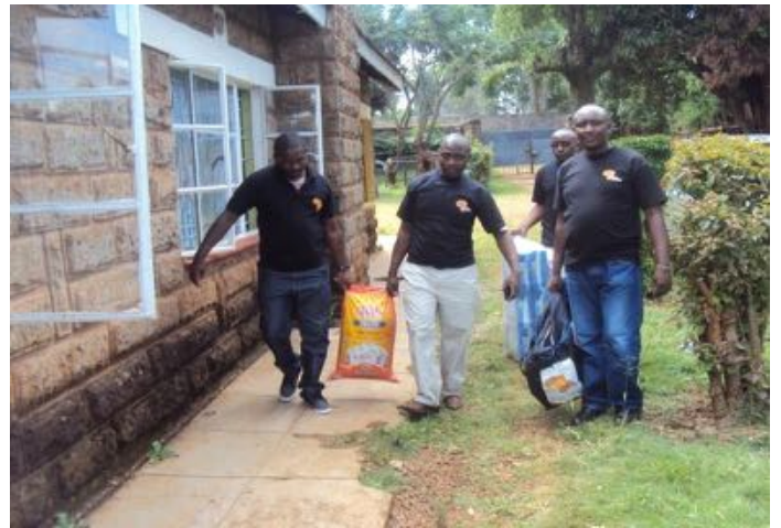
Equal Africa team delivering donations