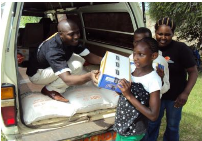
A PWID carrying snacks