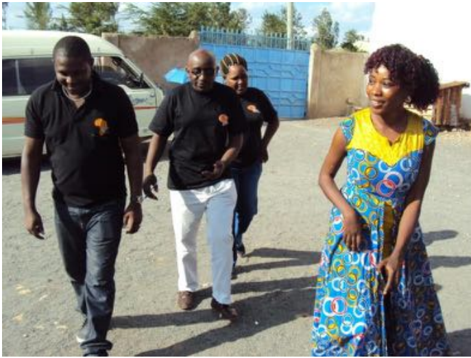
EA staff arriving at Compassionate Home