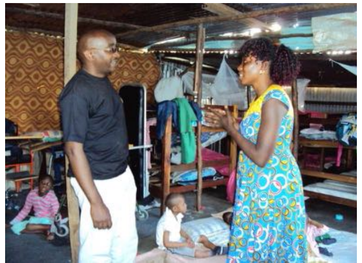
Compassionate MD giving a vote of thanks