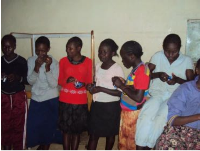
Orphans that sat for KCPE enjoying their snacks at the Home