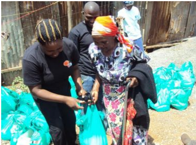
Elderly receiving food donation