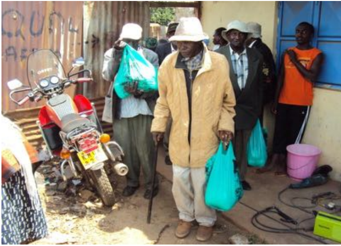
Elderly leaving for home