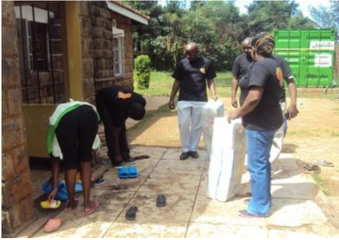
Equal Africa team