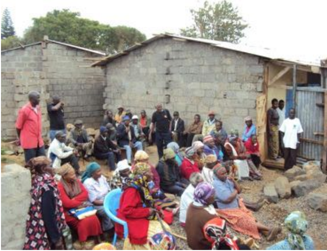
Elderly persons listening to an EA staff.