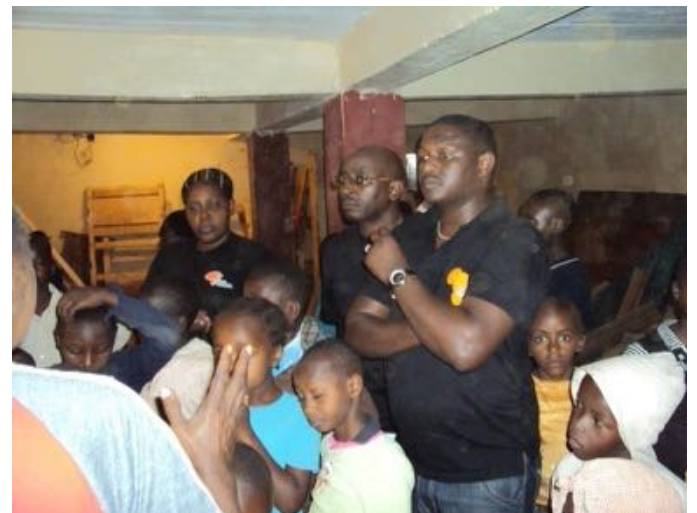
Equal Africa team listening keenly to the speaker at the Home