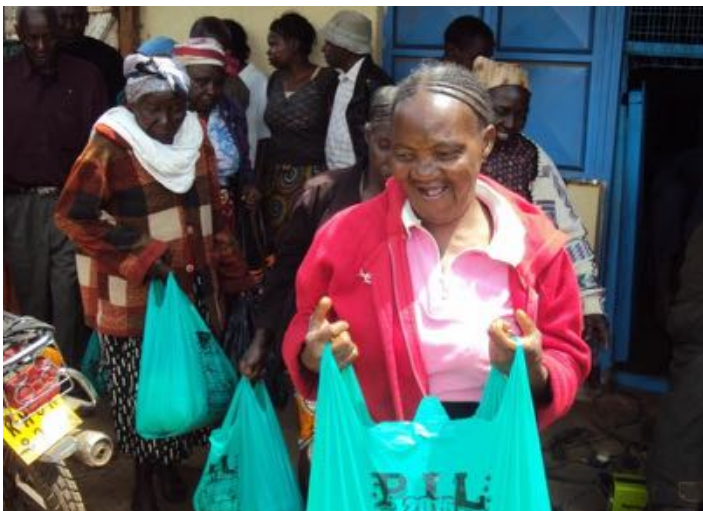
Elderly persons excited as the leave for home