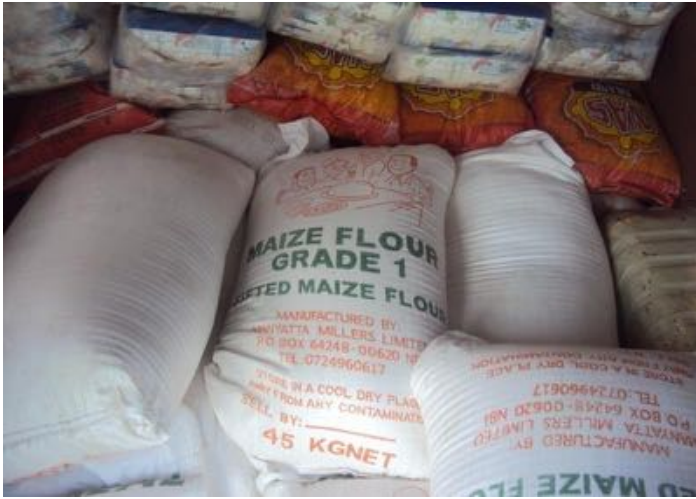
Donations destined for the Homes