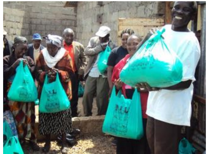
Elderly people show appreciation for the donation