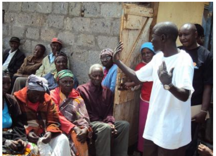
An elderly person talking to the elderly.