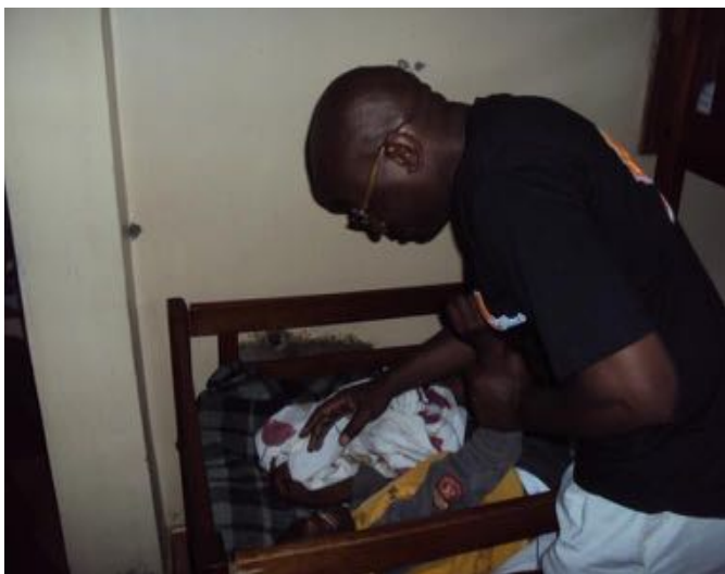
Equal Africa staff helping a bedridden child