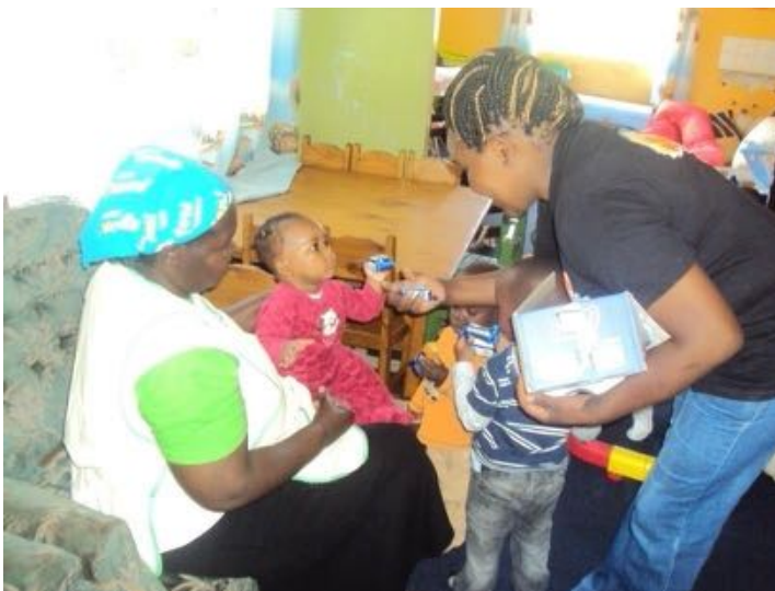
An abandoned child being served with snacks