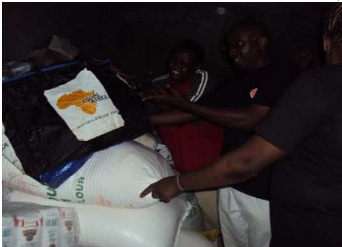
Food donation for the orphaned children