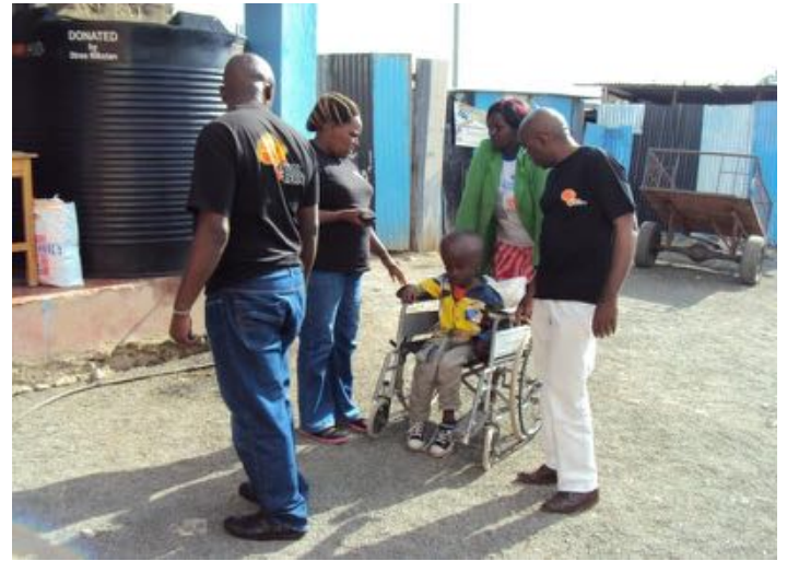
Equal Africa team interacting with a caregiver