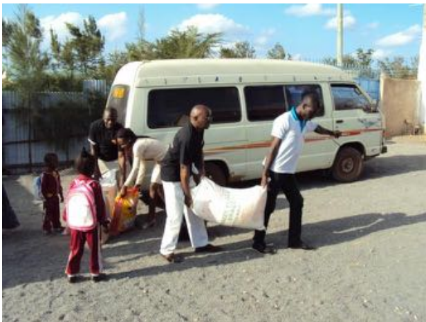
Donations deliveries to the Home