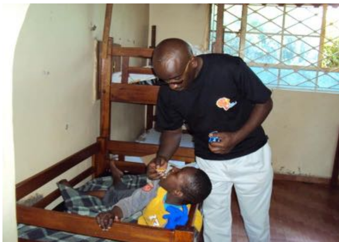
A caregiver feeding a PWID