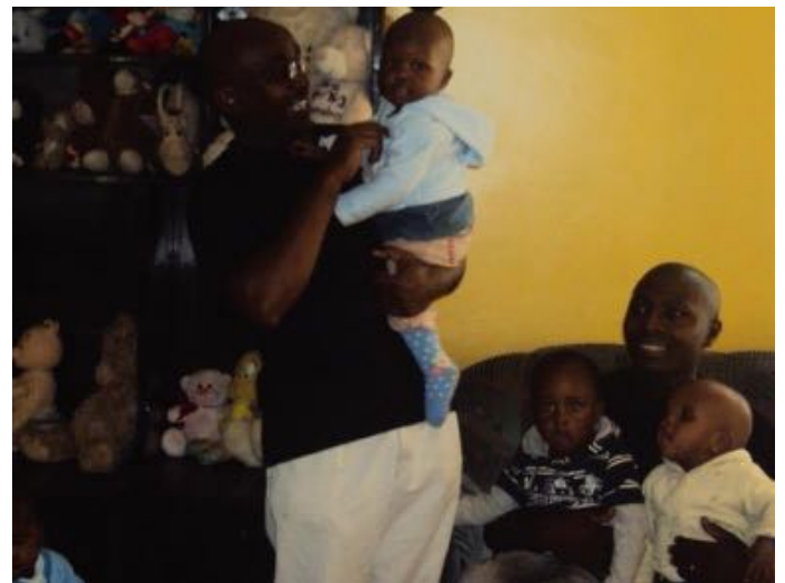
EA staff holding an abandoned baby