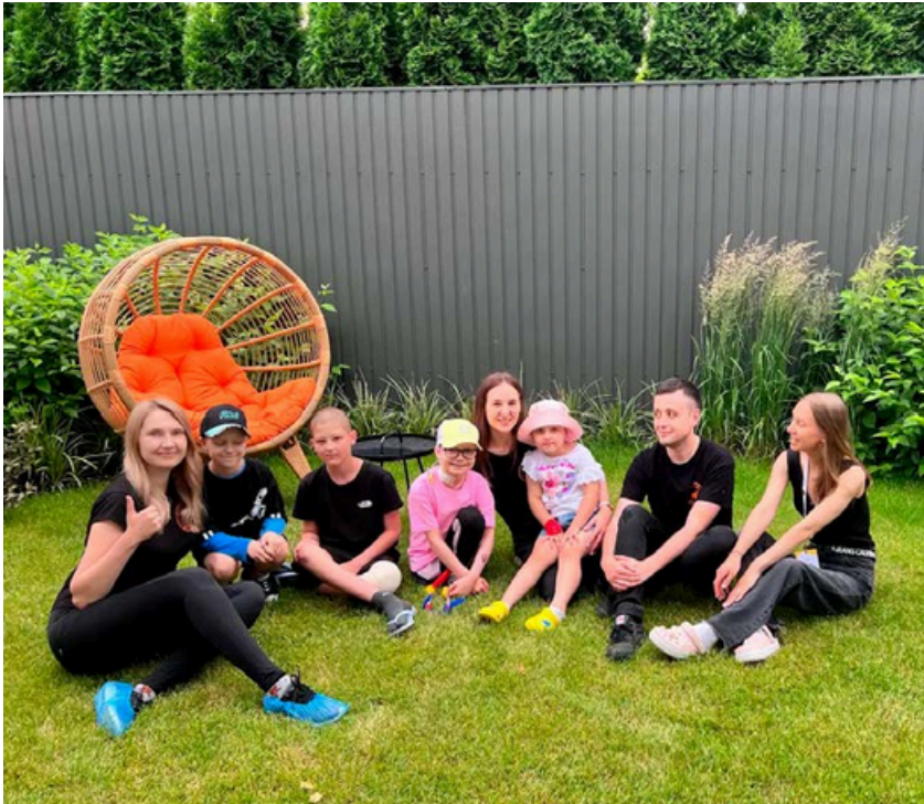
THERAPEUTIC GARDEN FOR HEALING