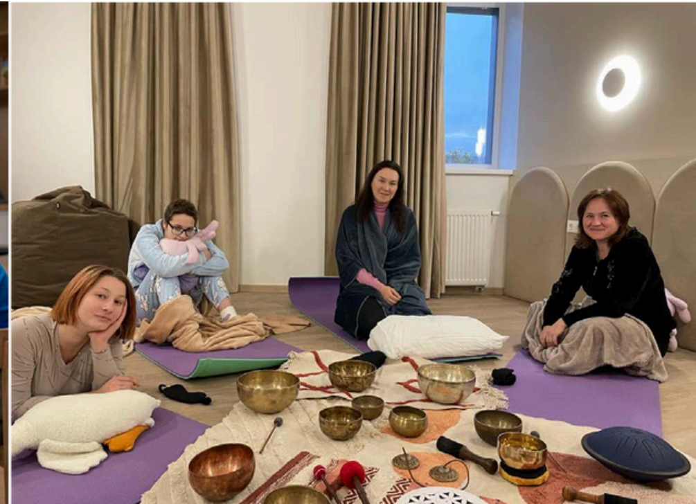
SOUNDPROOF SPACE FOR MEDITATION OR PRIVATE REFLECTION