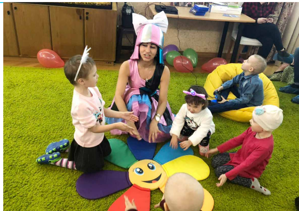
▲ We celebrate birthdays

In addition to a comfortable daily life, there are many entertainment and recreational activities at the Dacha. Big parties, birthday celebrations, meetings with friends, movie sessions, dreams come true and meetings with celebrities. Instead of a thousand words about what emotions the children feel during these events, we will share some pictures of those unforgettable moments: