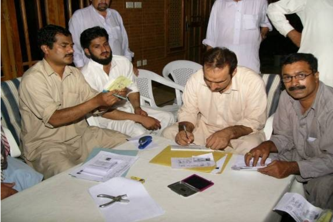
RDSP team helping the IDP's of Swat in form filling.

Sahar program is about improving the socio- economic conditions and infrastructure of rural life. It is to build a sustainable economy through the involvement of communities. RDSP team believes in a well developed society, which has quality living conditions, good socio-economic conditions, excellent sanitation system, clean water facilities and quality food. RDSP team is working closely with its partner communities and donors to develop the under developed conditions or rural people here in District, Mardan