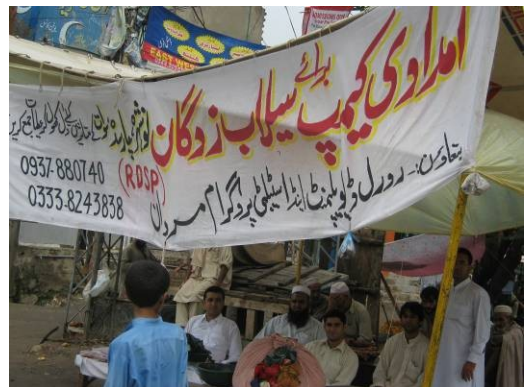
RDSP volunteers collecting aid for the flood affected people in different locations in District Mardan