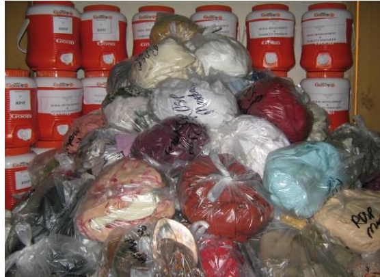
Immediate relief packages including water coolers and clothes ready to be distributed to the flood affected people.