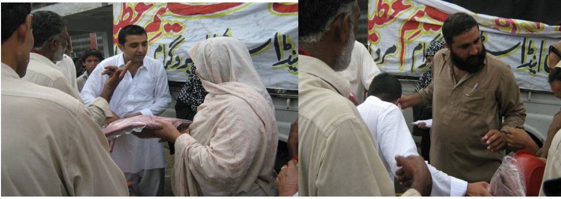
Chairman & Staff members distributing clothes in Charsadda