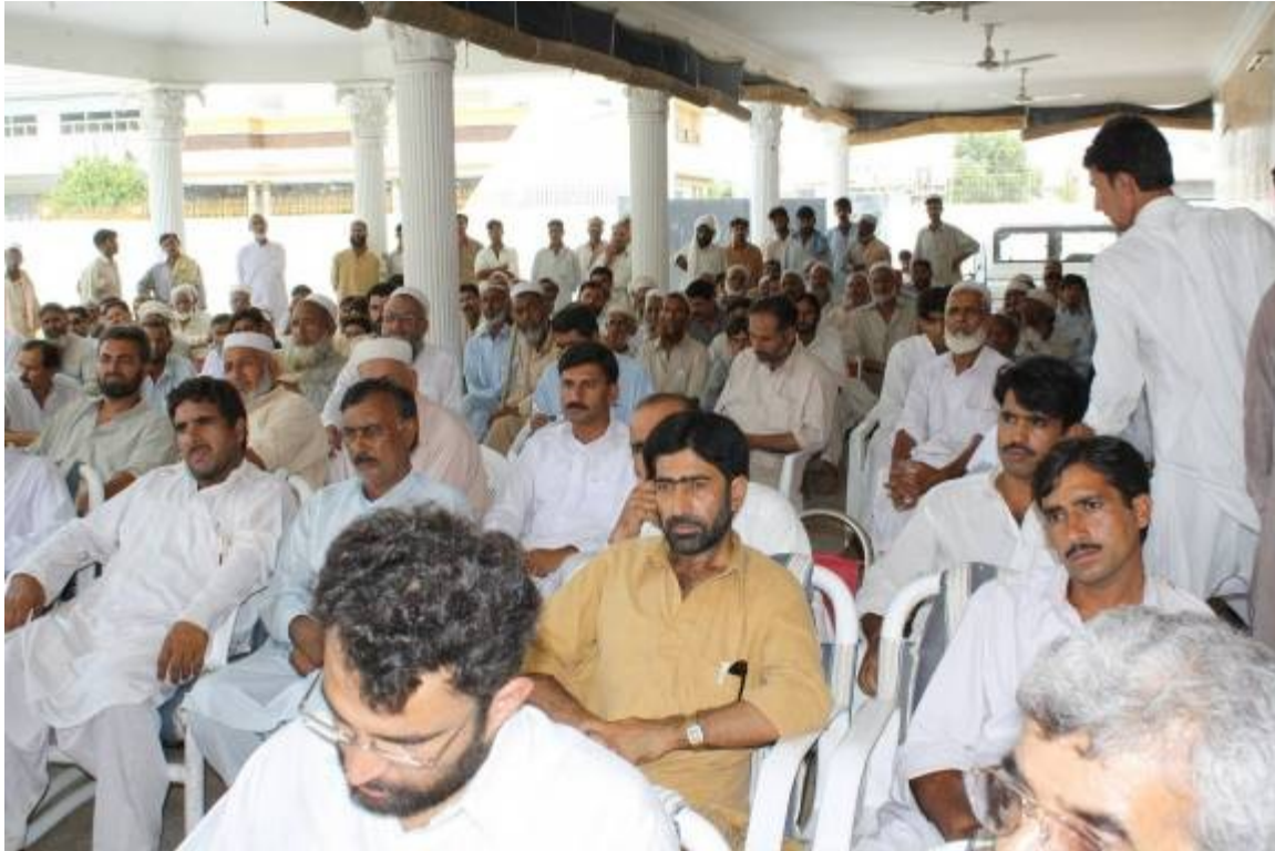
(Meeting of RDSP's General Body)

(List of all partner organization can be provided on request).