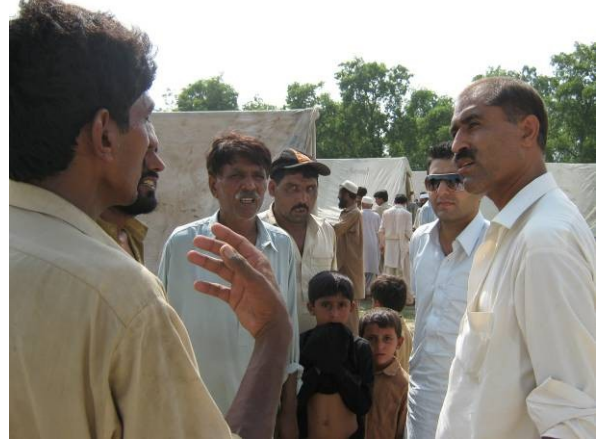
Chairman RDSP visit to Nowshera Relief Camp assessing the situation himself, and talking to the flood affected people of Nowshera.