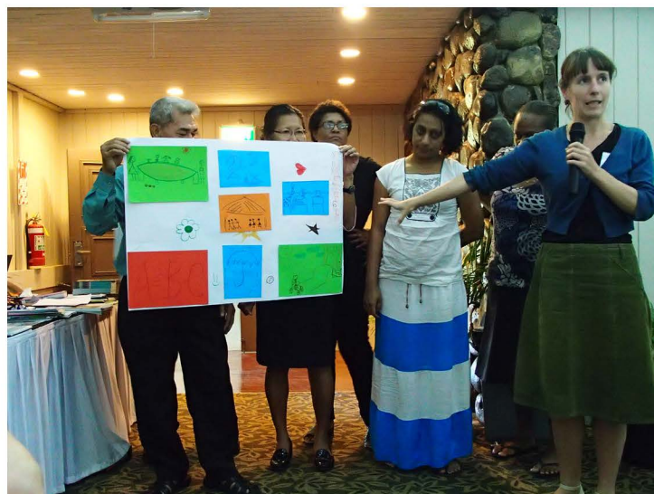
The Many Barriers Women Face

Document to their respective countries and advocate to implement the suggested changes.