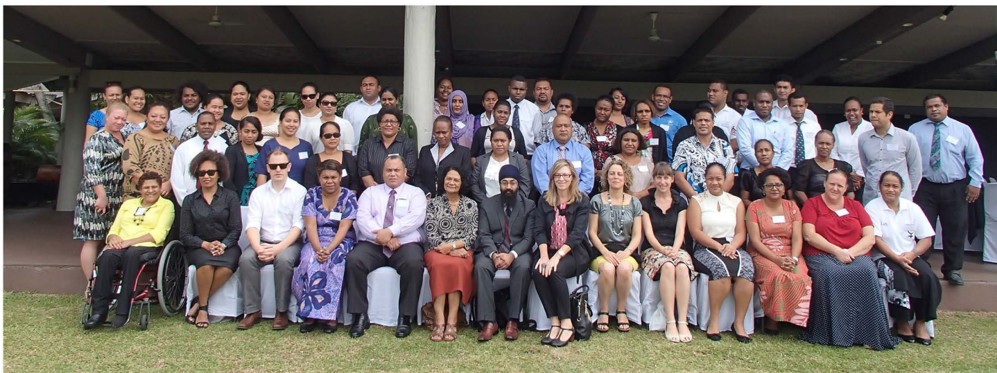
Regional Consultation on Gender and the Law – Nadi, Fiji Nov. 17-21st

Nadi, Fiji – Lawyers from across the Pacific Region (12+ countries) gathered for a Regional Consultation on Gender and the Law that was hosted by the Regional Rights Resource Team (RRRT) and Fiji Women's Rights Movement (FWRM). This brought together over 50 attorneys (including observers) representing various governments (Attorney General's Offices), private practitioners, and civil society.