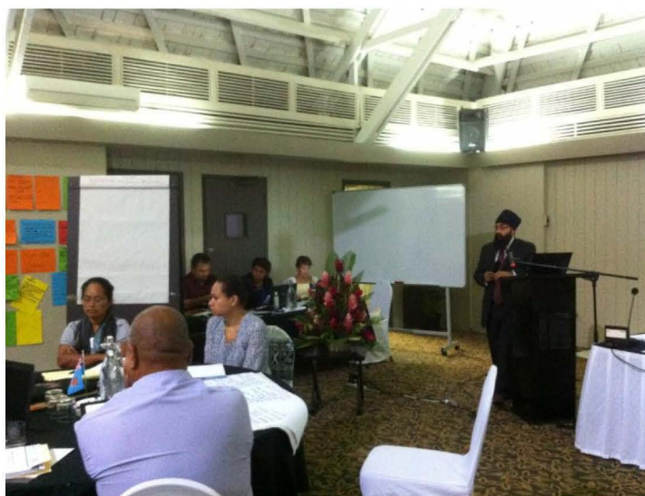
ICAAD / DLA Workshop

ICAAD and our pro bono counsel, DLA Piper Australia delivered a presentation and workshop. Being a part of this Consultation gave us the opportunity to engage individuals working within different sectors of society who have the ability to work towards effective implementation of human rights within their respective countries. Securing multi-sectoral participation to assure awareness and impact on gender based violence was a predominant theme throughout the week-long event.