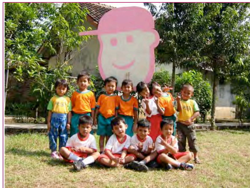
The next generation of Borobudur celebrates with giant Green Map Icons