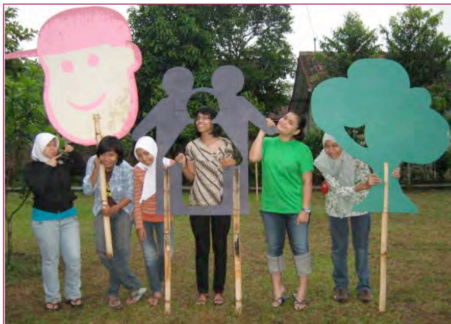
Involving local residents in cherishing and preserving this World Heritage Site