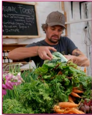
Cape Town South Africa