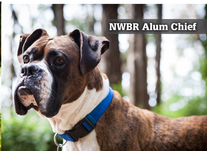
NWBR Alum Chief