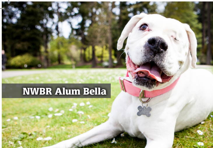
NWBR Alum Bella