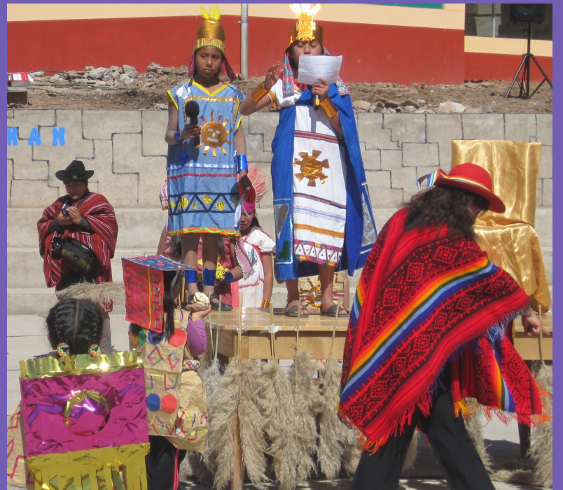
CW students learn history by creating a theatrical presentation to honor the Inca History during Inti Raymi. Students made all costumes, researched the history and created the play.