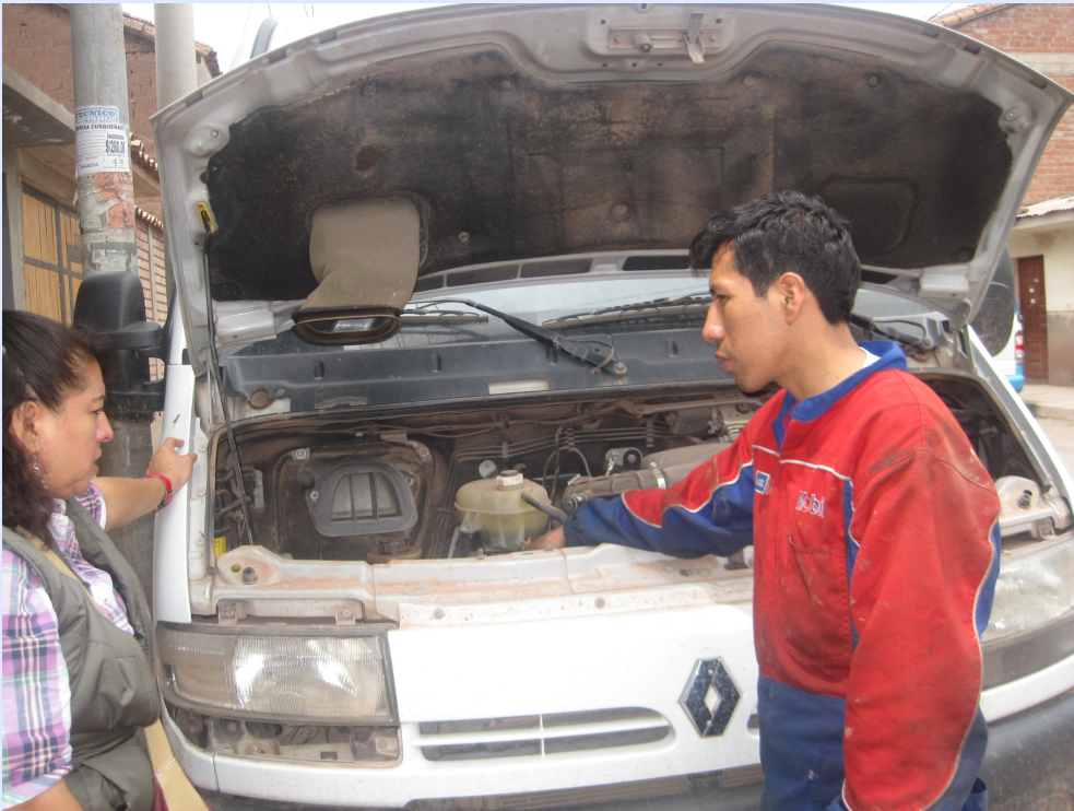
This is our BIG problem child. Our only School transportation is broken down again.

each morning and afternoon to deliver our students safely to and from school have taken a toll on this vehicle. The road is still not repaired as promised by the mayor of San Sebastian, a Cusco suburb, where our school is located. Big chuck holes made by large trucks during the heavy rains make the roads nearly impassable and really beat up our van. We are blessed with a skilled and loyal mechanic who shows up wherever we are broken down and will stay even by flashlight to get the repairs done. So we remain in operation and the school has not missed a day due to lack of transportation for the students -so far. But Ruth tells me we need another 21 seat van to share the transportation with less wear and tear on them both each day. A big school bus will not do well on our roads. So for 2015 this is on the top of our wish list.