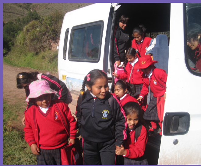
CW school van is tired but without it... no class that day