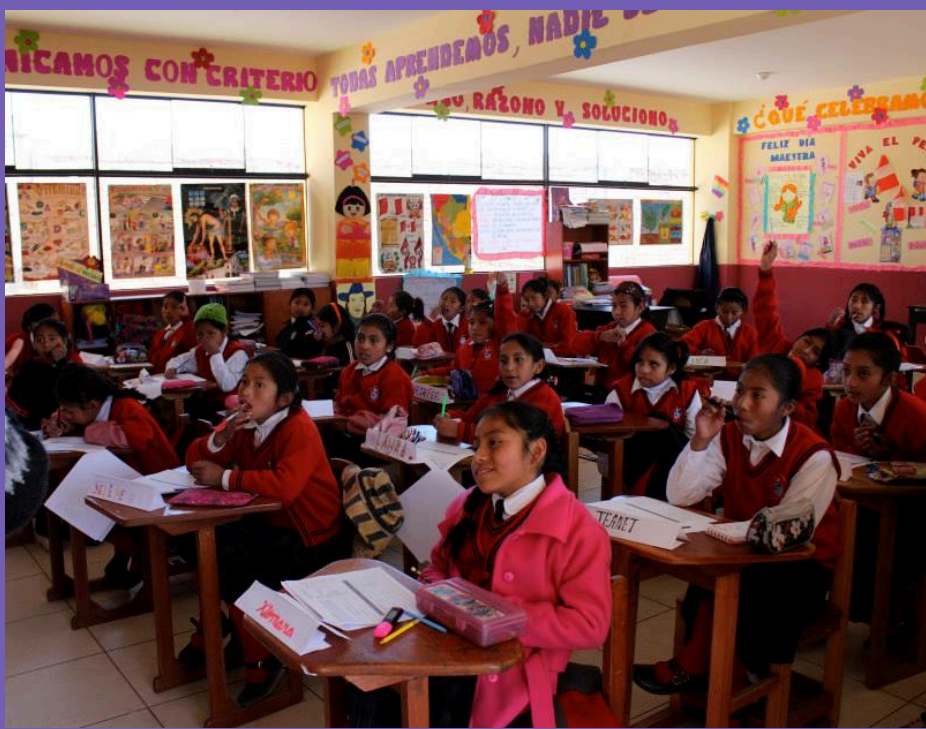
Class is in session and all are paying attention.