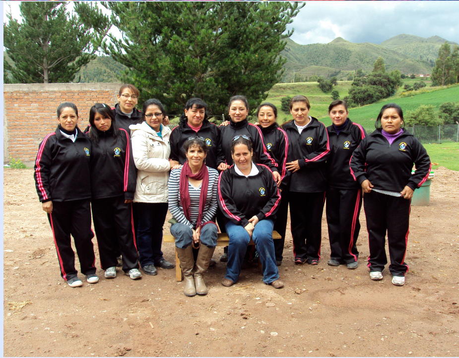
The CW staff; our 8 teachers, 2 cooks, 1 secretary and Administration.

Chicuchas Wasi School for Girls provides quality primary education and promotes gender equality, self-esteem, and human dignity for the marginalized indigenous girls of rural Cusco, Peru. With the CW education and skills the girls are empowered to become economically independent. They become important role models and leaders for the next generation of CW students. Our parent classes focus on helping the students family to understand the value of educating their daughters. The importance of family support is emphasized and families learn more effective communication skills that help to deter domestic violence against women and girls.