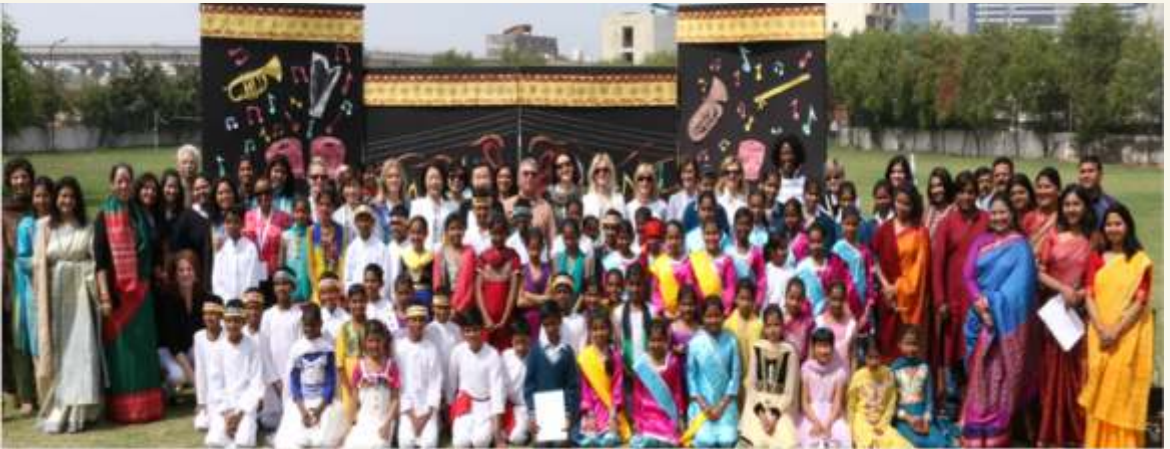
Thank you KPMG for Giving VIDYA the Wings to Fly

Later, the five scholars of KPMG visited the First World War Centenary celebrations organized by the Indian Army at Delhi Cantt. The students gained many insights into India's participation in the First World War.