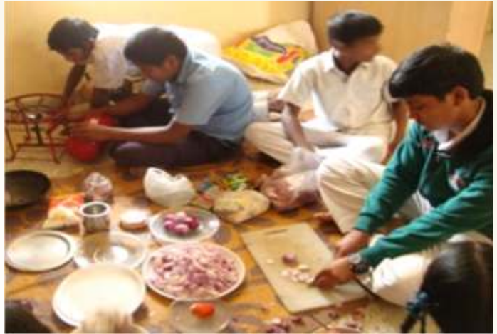
Boys had a Blast Preparing the Dishes

In Bangalore, a life skills workshop in Gottigere High school was the monthly event to mark the 30 years celebrations. After a two weeks toil, the final result was a fantastic array of food platter from South India. As new learning, Chinese food was also included.