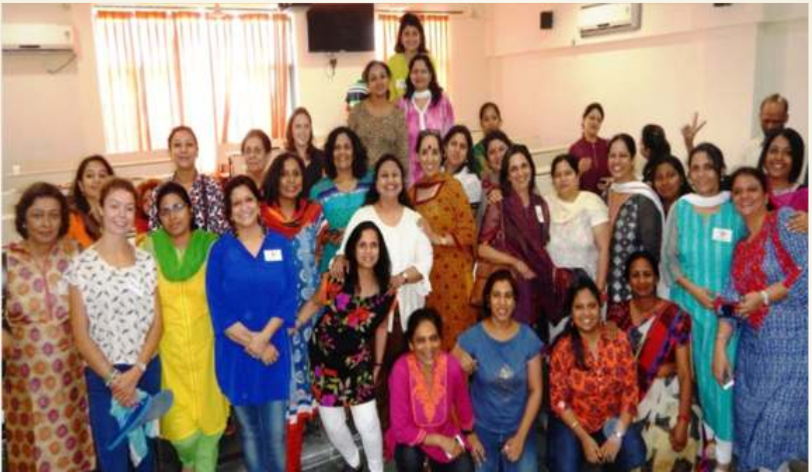
Kudos to Delhi Team for Successfully Handling the Conclave