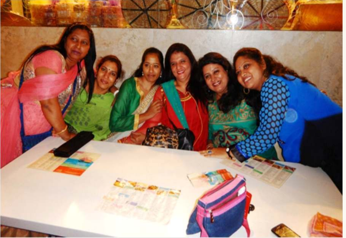
From Mumbai with Love

Team Mumbai was fun, enthusiastic and almost magical. Professional and well organized, the team presentations have left a strong imprint on rest of the members. We all have lot to learn from team Mumbai specially on Volunteer Management.