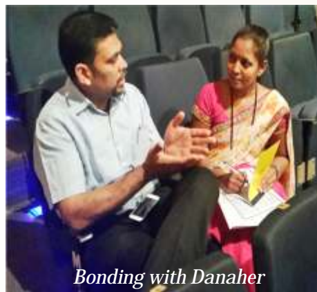
Bonding with Danaher

Danaher, a US based company arranged a fun filled evening for students of Beyond School and Youth forum. There were street plays on gender sensitivity followed by experience sharing by alumni. One group of leaders had a one to one mentoring session with the youth. The younger students also bonded comfortably with the team.