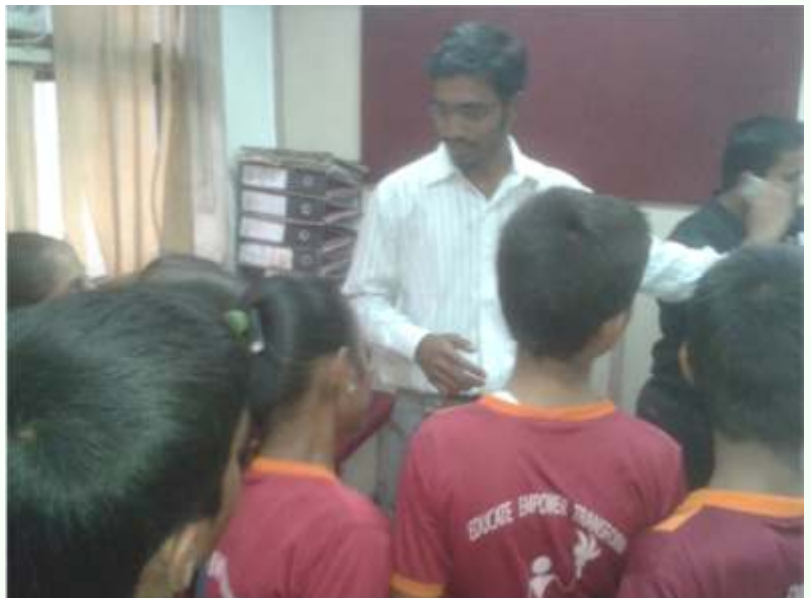
Banking Beyond School

Banking on Banks. Gautam Nagar and Phule Nagar visited the Saraswat Bank at Powai and learnt the details of banking. They were also made aware of importance of savings.