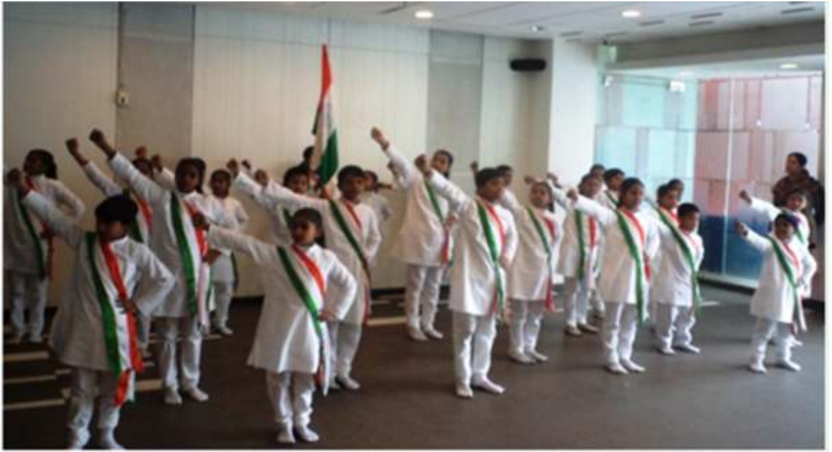
Mera Desh Mahaan!

It was cold and dripping yet the students turned up to salute the national flag on Republic Day. A cultural programme was presented in the Panchsheel Club highly appreciated by the members.