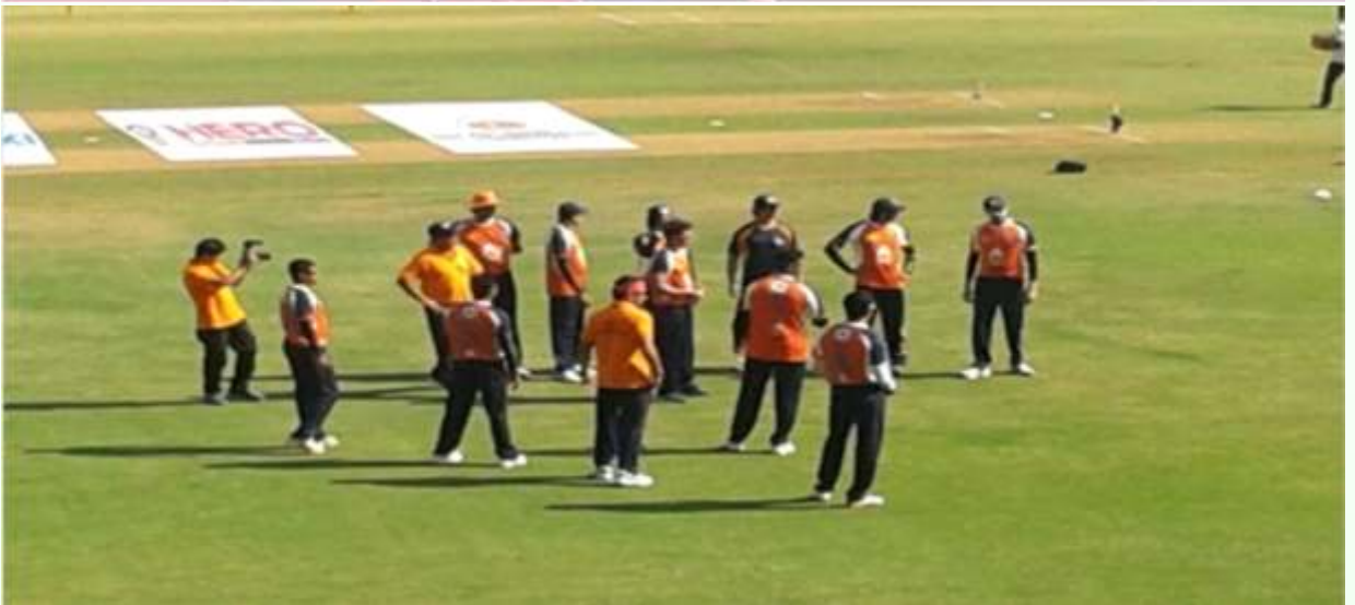
Three Cheers for Mumbai Heroes!