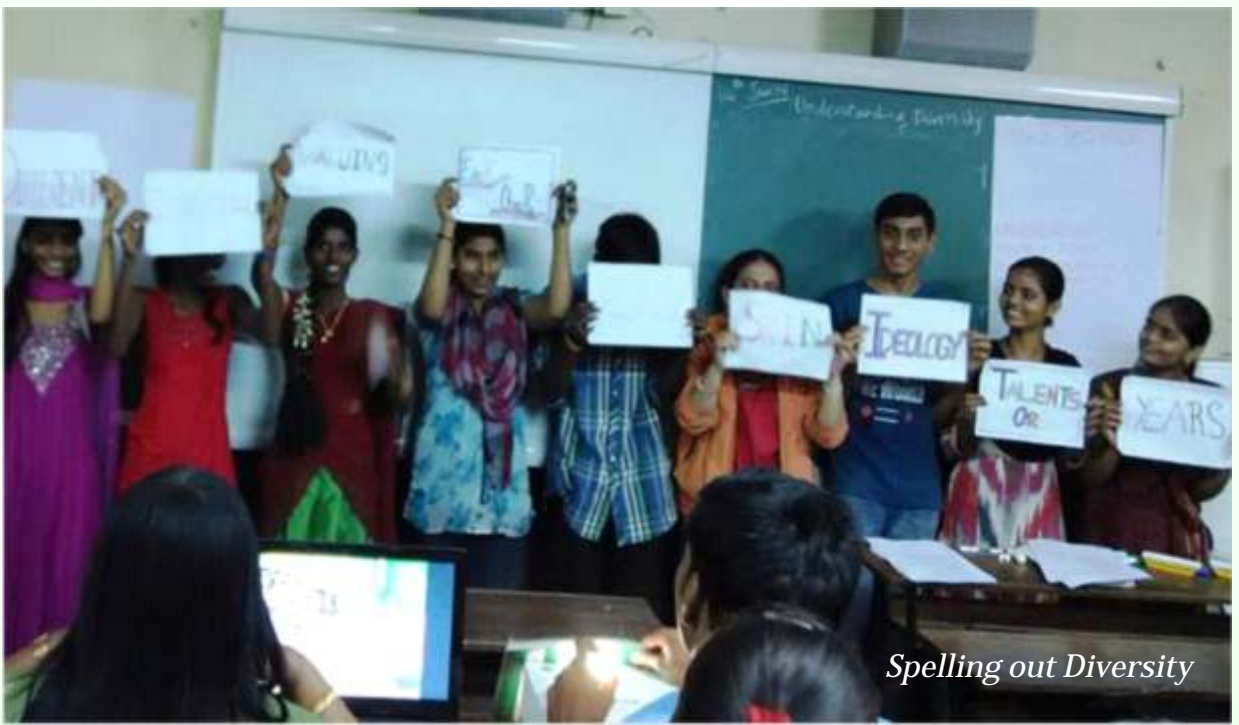
Spelling out Diversity