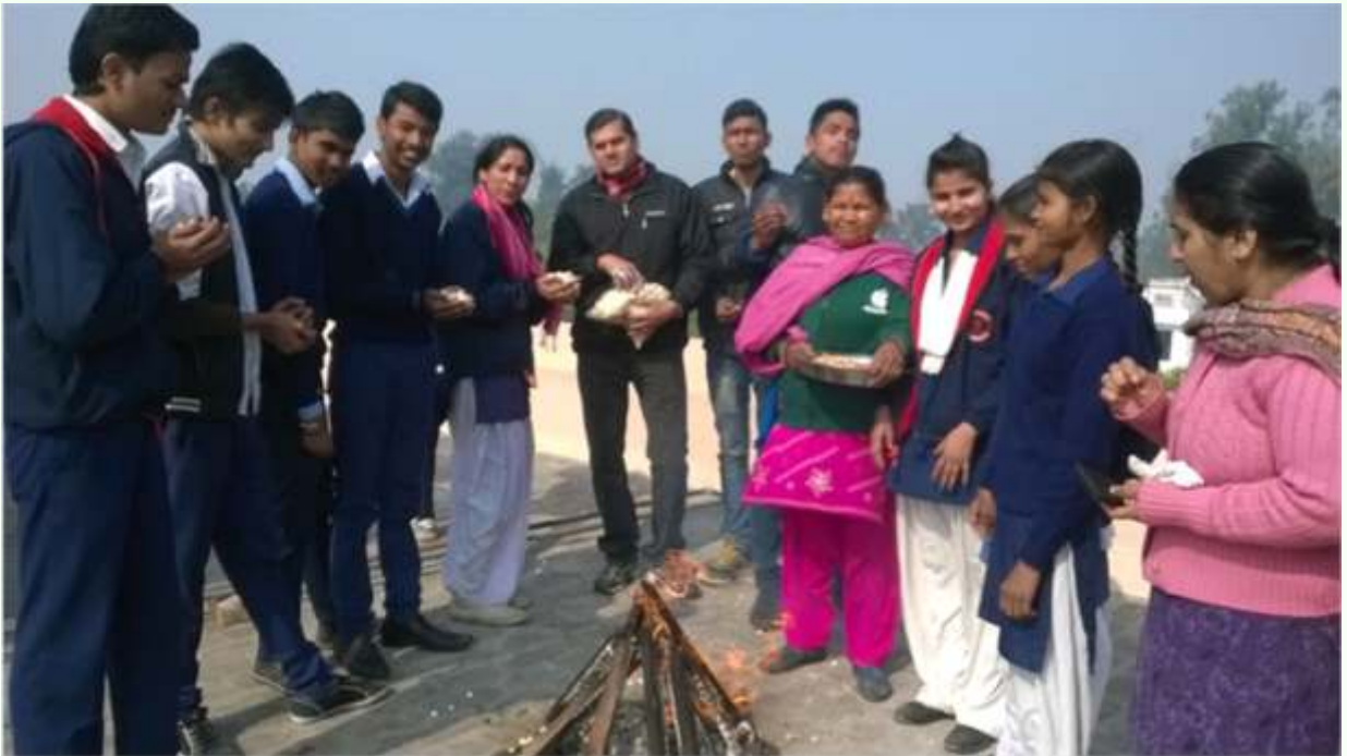
Popcorn and Peanuts around the Bonfire on Lohri

The Indian Institute of Technology (IIT) centre reopened after winter break on January 12. Regular classes started for Open School students and adults along with Republic Day Celebrations which included essay writing. The subjects were Clean India, Gandhi ji , Swami Vivekananda etc.