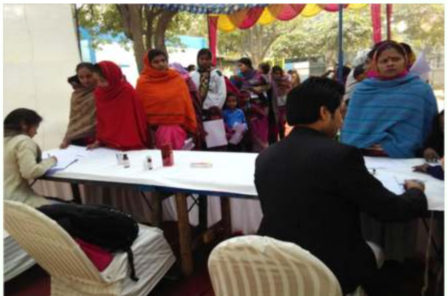
Thank you EFRAH

A Health Camp was conducted in partnership with Empowerment for Rehabilitation Academic & Health (EFRAH) promoting general health, hygiene and sanitation.