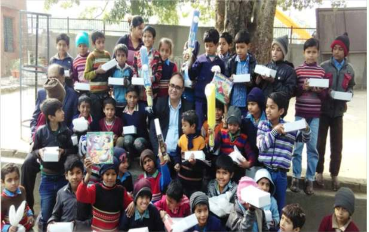
Thank you for Gifts, Tata Capital

Team Tata Capital visited the centre on January 23. They blessed the centre with gifts for physical and mental fitness. VIDYA is grateful to Tata Capital and Ivolunteer for coordinating this visit. The students are enjoying every bit and every moment of playing and learning with their gifts.