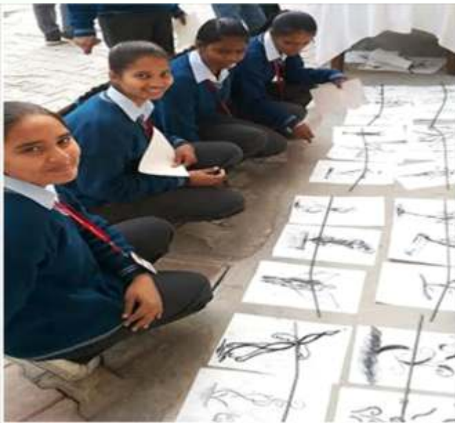
Learning to Create a Logo

Many American volunteers reached the school through Youthreach from Vesper ( www.vesperatelier.org ). They were here to install a sculpture of VIDYA logo. In two days that they were here, they interacted with the senior students starting with exploring the meaning of VIDYA logo. Later an element of sound was incorporated in each alphabet making students aware how it sounded! Various drawings and discussions helped in identifying important cultural and human conditions to be incorporated while creating a logo.