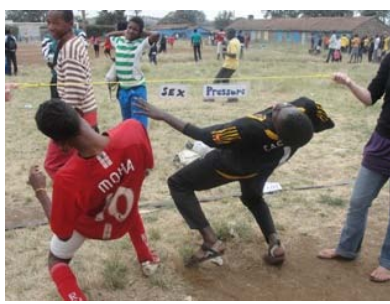
Off-field HIV/AIDS activity.