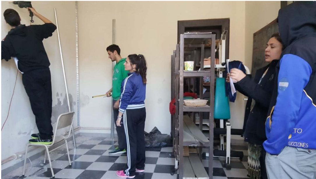
One of the buildings that needed repair, and the group at work.

Please consider supporting one VISIONAR student through the school year, which represents USD $1,000 in today's exchange rate. This amount helps pay for university fees, school supplies, books and transportation. As always, any amount is deeply appreciated and welcome.