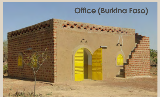
Office (Burkina Faso)

The Nubian Vault technique makes it possible to build housing appropriate for many uses, from simple rural homes to two-storey urban dwellings, but also community facilities (education, health, agriculture/livestock, culture, religion, offices, etc.).