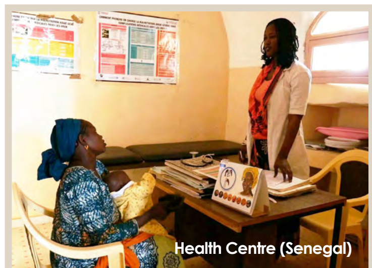
Health Centre (Senegal)