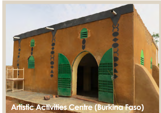
Artistic Activities Centre (Burkina Faso)