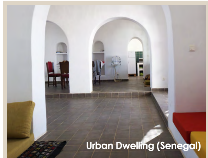
Urban Dwelling (Senegal)