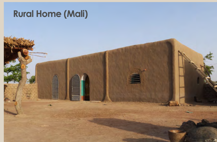
Rural Home (Mali)