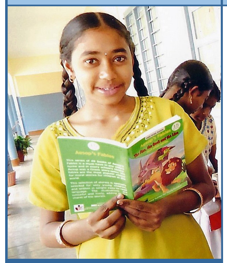
This girl at Sister Seline's Home explores their library. Right: Girls at Sneha Sadan use their new computer lab.

World's Children has already funded libraries in eight orphanages. Our goal is to provide library books, encyclopedias and book shelves for all our homes, opening up a world of imagination for our sponsored children. We have 28 homes to go!