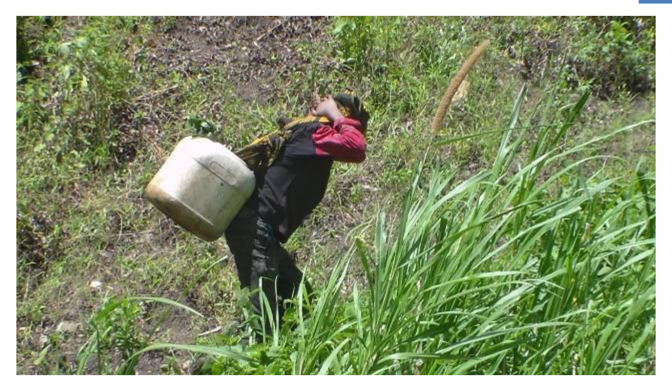
A girl carrying a Jerrican of water from the valley to her home in the mountain, she was married at 15 years