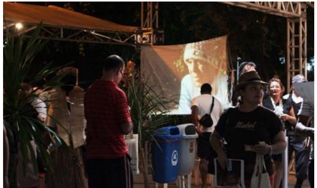
Photo: Video “Argures” being exhibited on Teia Nacional da Diversidade 2014, the greatest national event of popular culture in Brazil