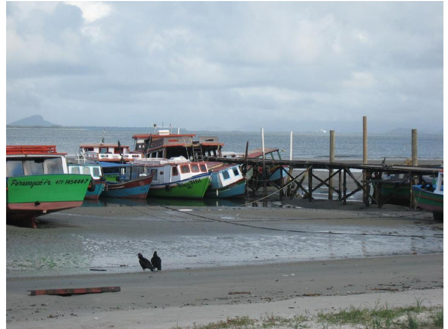
Pier access to the island. There are no motor or animal traction vehicles