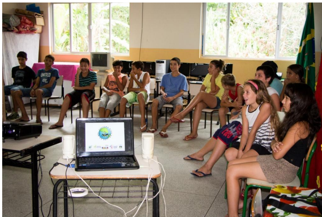
Children and teenager of Ilha do Mel on a project's meeting

The pupils learn traditional, creative and democratic basics. They develop a diversified opinion and, as adults, they can participate at decisions and solutions belonging to the region they live. As indirect impacts we recognize cultural preservation and the beginning of a conscious sustainable tourism.