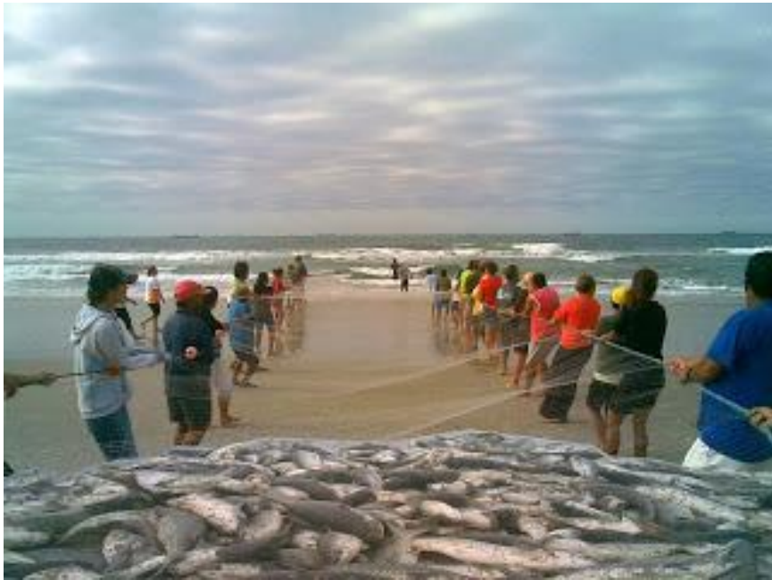
Traditional community fishing in Ilha do Mel

Living Culture of “Ilha do Mel” is a project that promotes the development of education, culture and citizenship in traditional fishing communities in the coastal region of Paraná, Brazil. The actions are especially for children and teenagers.