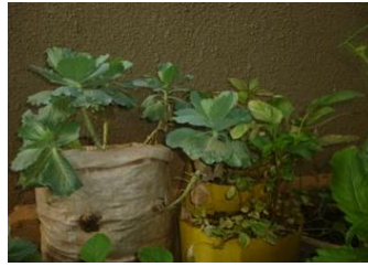
Some of kitchen gardens established using bags and containers