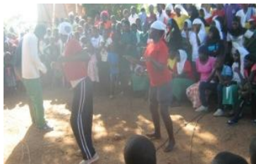
This photo is one of the schools music & drama competitions for 3 schools –with a theme of educating a girl-child on “Girl Power Enhancement for Equitable Development”