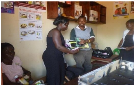
UCODEF Programme officer hands-over several packets of Synthetic hair to a woman beneficiary to enable her start salon business for Improved livelihoods. 'as part of Human Rights awareness initiative with some Income into her pocket & improve household Incomes & self reliant.