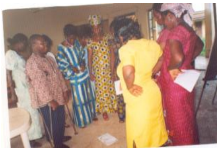
This photo is one of the local outreaches awareness on human rights for women in Nakuwadde –Village –Wakiso District