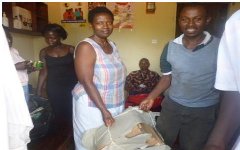
This photo demonstrates some women receiving the tool kits to start their enterprises and boost their household incomes.