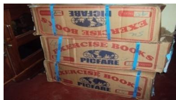
Picture 6 above : Some of the scholastic materials to support the girl child education