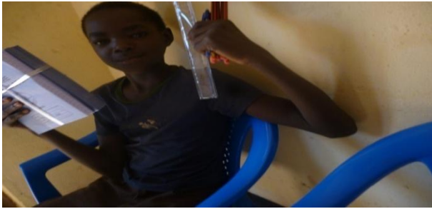
A school girl displays scholastic materials gotten from UCODEF. She promised hard-work at school in return

empowerment and awareness of their rights to enable them participate and contribute confidently to the decisions affecting them and at different levels of community and national development. At the end of the project women and girls are placed in a position where they are able to single out their rights, be able to claim and demand them responsibly from the duty bearers.