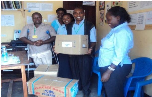
UCODEF team receives support of scholastic materials from MildMay Uganda at UCODEF offices-Wakiso

bargaining power, to be able to choose wisely from various life choices. She is made informed and empowered enough to know her rights and where to claim and demand them in the event that they are violated or abused. At UCODEF, we are proud seeing vulnerable girls maintain uninterrupted school attendance as well as sustaining exceptionally good performance in class!