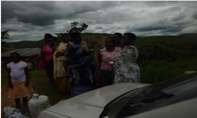
Photo below is for Women Sharing Views and reflections just after Women and Human rights Workshop in one of the Villages of Busukuma Sub County-Wakiso District

“There is no developmental strategy more beneficial to society as a whole – women and men alike- than the one which involves women as central players”. Kofi Annan (Former UN Secretary General)