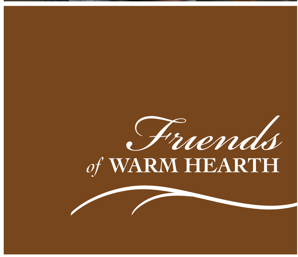
ANNUAL REPORT 2007