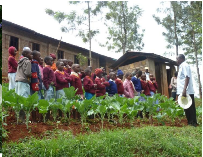
4. OUR WORK WITH THE SCHOOLS