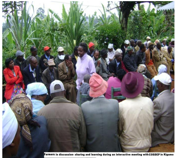
2. FARMERS INTERACTIVE MEETING SESSION