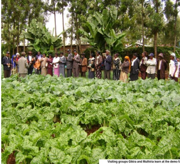
1. FARMERS EXCHANGE VISIT AT COSDEP'S DEMO CENTER