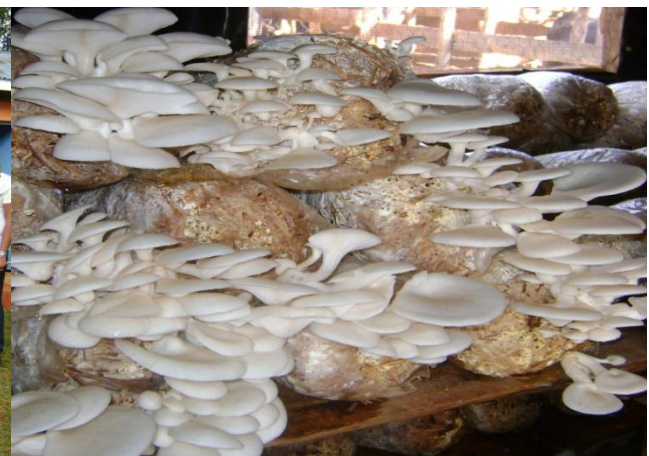
6. OYSTER MUSHROOM PRODUCTION PROJECT AT THE DEMO