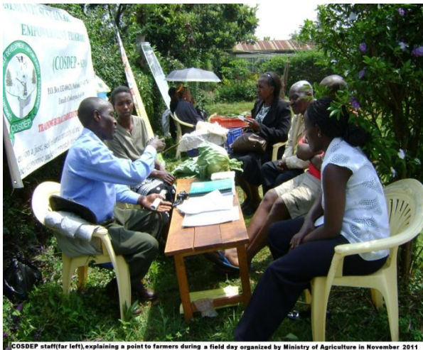
3. EXHIBITING OUR WORK DURING A FIELD DAY