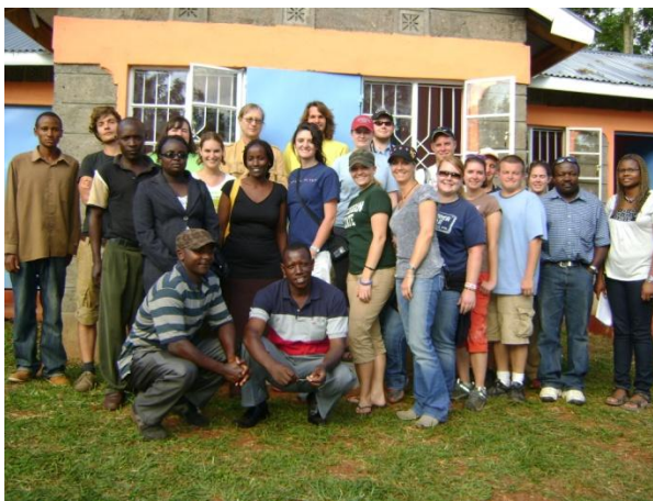
5. HOSTING STUDENTS FROM LOUISIANA UNI. (USA) AT OUR DEMO