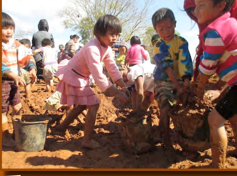
with teachers, students and community members in Northern Shan State