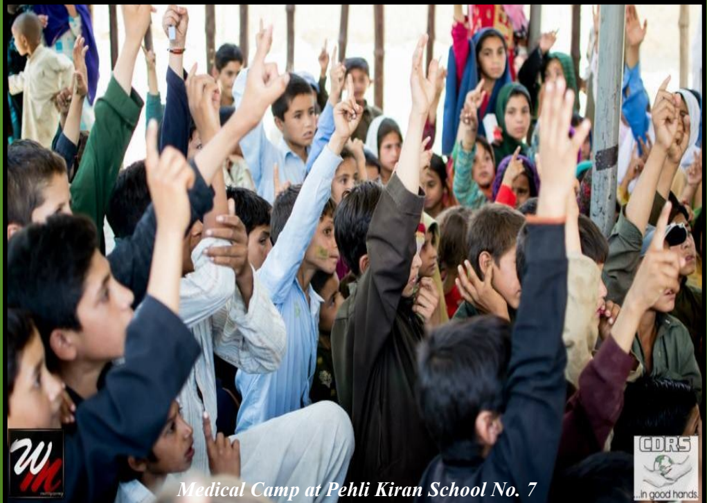
Medical Camp at Pehli Kiran School No. 7