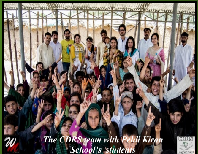
The CDRS team with Pehli Kiran School's students

On 10 May, patients gathered for our Eye Camp at The CDRS Mother & Child Health Center in Bagh Dheri, Northern Swat, to receive eye checkups. Our Volunteer staff of expert Ophthalmologists checked 1,002 patients and performed 40 cataract surgeries. In partnership with Wali Welfare Trust, a total of 300 prescription eye glasses were distributed. In the end, patients left the camp happy with the great services provided to them, confidently knowing they're "in good hands" with CDRS.