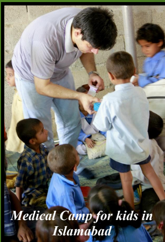
Medical Camp for kids in Islamabad