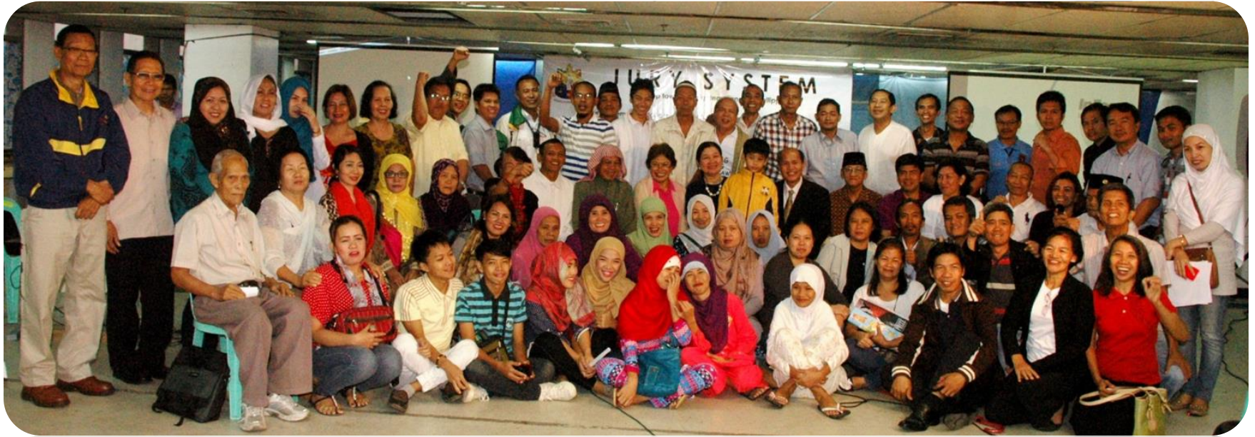
JURY SYSTEM SEMINAR QUEZON CITY, DECEMBER 08, 2014