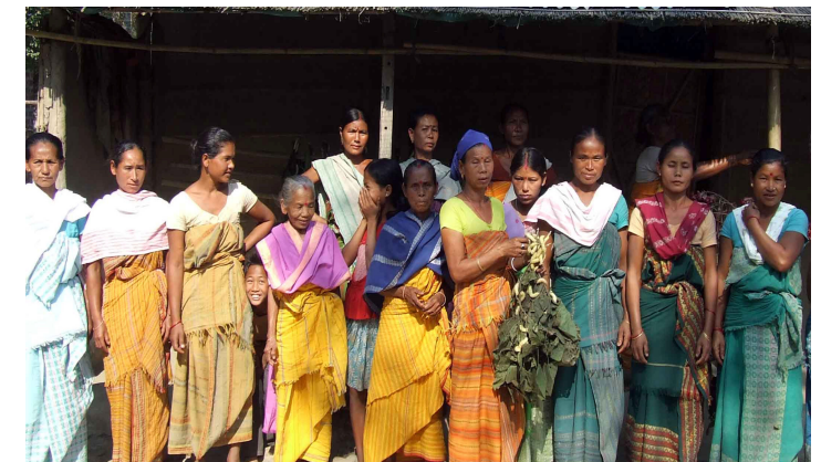
A four year old Self Help Group formed by Dolphin Foundation

The program has already covered 100 such villages successfully with significant level of impact and the strategy is under replication to cover more such areas.