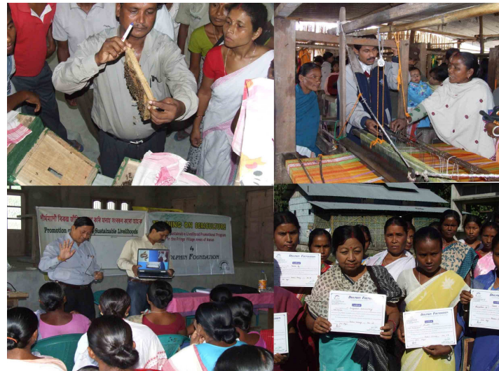
Skill development trainings on various livelihoods

The basic idea of the program is to ensure food security to the target communities living in the fringe of Protected Areas