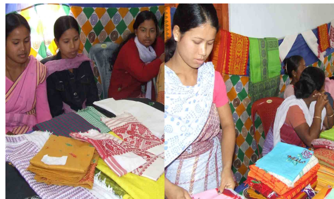
Livelihood Exhibition organized