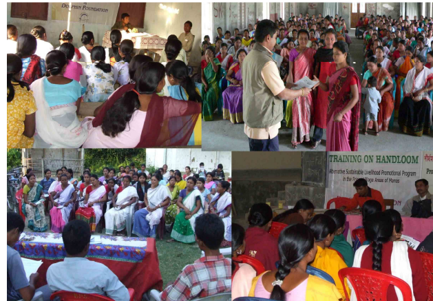
Awareness generation & Motivation Program

Earning livelihood has been a major challenge for the natural resource dependent marginal communities living around the remote Protected Forest Areas of rural India. These communities are considerably underserved due to the remoteness of the area they live in and deprived because of inaction of Wildlife Protection Act. Their traditional forest based livelihood rites were all curtailed after the forests at their neighborhood were declared as Protected Areas. Most of these areas are also highly affected by extreme annual flood besides extensive crop & property damage from wild animal depredation, a big blow to their ever bad economy.