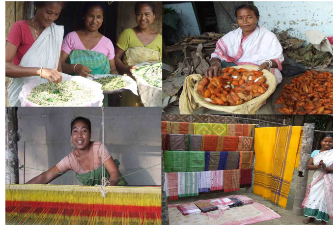
Beneficiaries of the Program