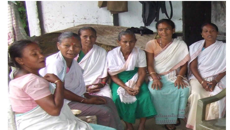
A SHG formed by Dolphin Foundation

of Northeastern India through scaling up of the traditional secondary Livelihoods up to an economically viable level. The poor & the illiterate womenfolk of the targeted households have been used as the media as they are the most suffered group in the community. To ensure the sustainability of the approach being made a “third front “has been developed at the