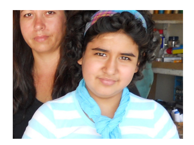
Our "mercy" medical fund helps relieve some of the miscellaneous medical costs for families with a sick loved one, (like this young girl who is now free of cancer), along with dental, and other unexpected emergencies.