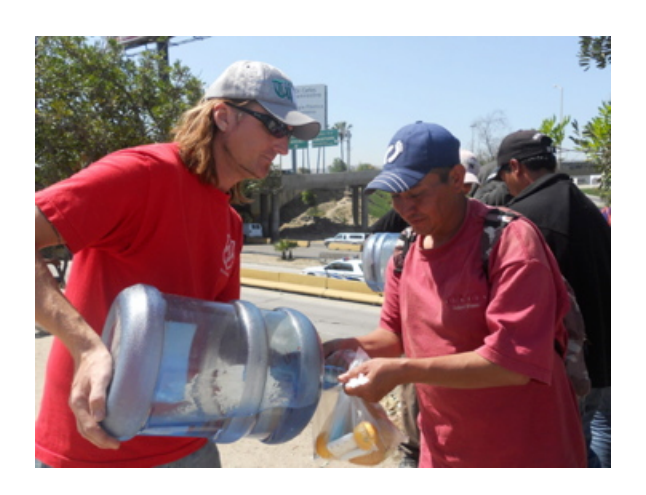
Outreaches to the homeless, living in the streets and aqueducts of the Tijuana River. Many are addicts, but some agree to go to Christian rehab with us.