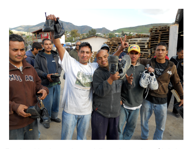
Food and basic needs are delivered to various Christian (and non-Christian) rehabs throughout TJ. A donation of shoes to VOB, put smiles on the faces of these guys.