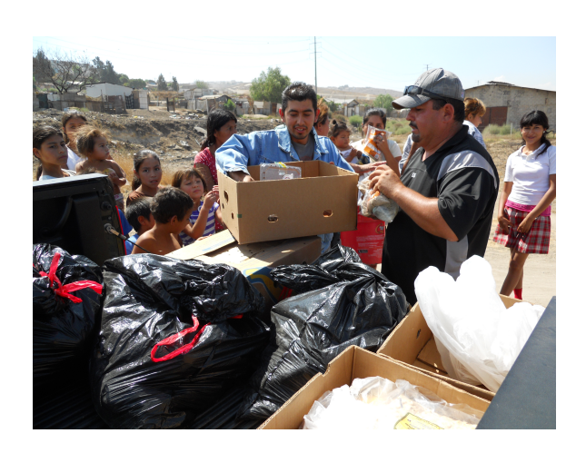
VOB assists in several weekly dispenses of bread, produce, and sweets, which are distributed in some of the poorer colonias, helping families provide balanced meals.