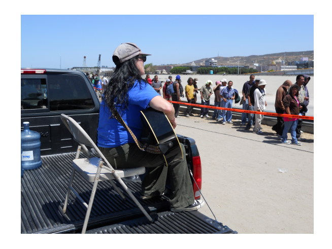
Worship is essential when desiring to bring peace to a place of hardship and distress. The Lord is faithful to draw men unto him. Worship sure does it!