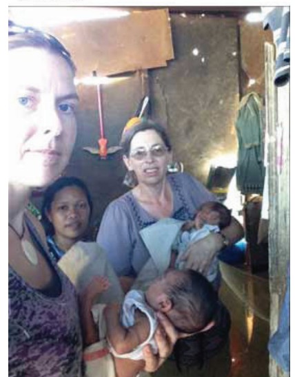
Found twins, born pre-term and malnourished. We are taking care of them now.