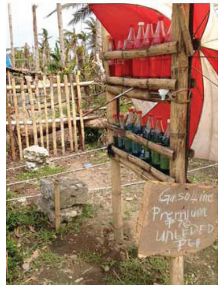
Gas for sale...